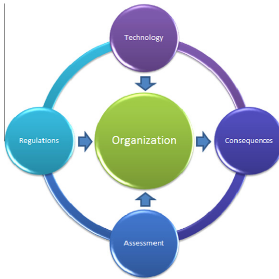
Fig. 1. Key dimensions of Green IS decision-making.