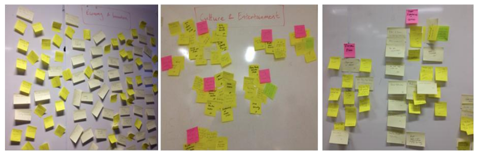
Figure 2 KJ Method; from the left: 2a, 2b, 2c.

Starting from the left of Figure 2, step 3, and 4 of the KJ Method are represented.