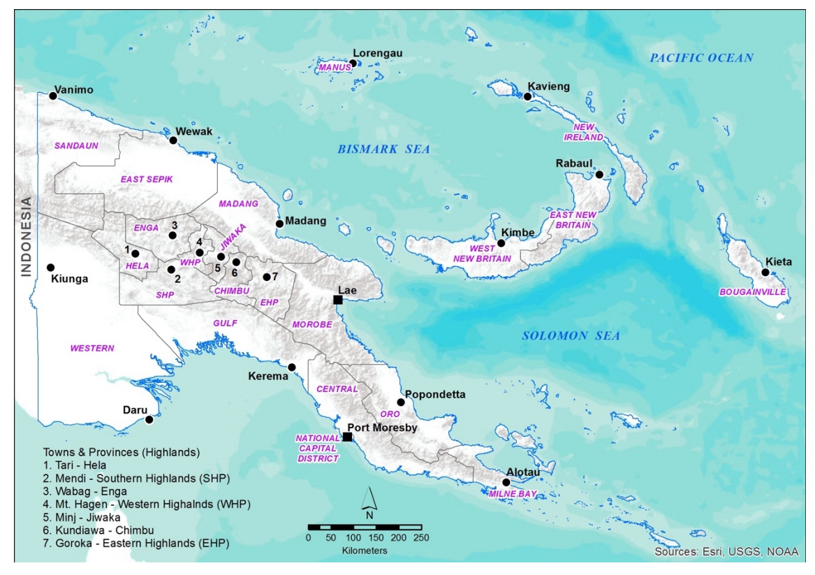
Figure 1 : Provincial map of Papua New Guinea (created by Tine Ningal through DIVA-GIS based on Esri, USGS, and NOAA data).

The characteristics thus described, and sometimes stereotyped about others' 'culture' or 'pasin', are often also commonly agreed categories, even if evaluated differently depending on perspective. Simbus may, to use the evoked categories of provincial identity, for example, evaluate Hageners' conduct as 'greedy', in terms of allegedly being more predisposed to the idea of withholding resources from kin. Whereas Simbus pride themselves for always looking after kin in need, and for a propensity to share with others whatever they have. In another context, someone identifying as Simbu may bemoan feeling constantly drained of his resources by the demands and expectations from kin, jokingly stating he wishes he was born a 'PNG Chinese', meaning Hagener (perceived as never sharing), who are supposedly not subjected to similarly constant expectations for sharing one's resources and monetary income. Correspondingly, Hageners voice pride about their business-mindedness and success at business, alleging that Simbus do not seem to handle money the right way in order to succeed in business. Simbus do not necessarily disagree with this assessment, rather stressing that Hageners' approach to business conflicts with moral values and sensibilities surrounding exchange that Simbus take pride in.