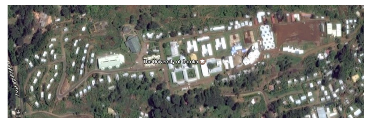
Figure 2: Bird's eye view of the University of Goroka campus. (Google Maps/Earth; image approximately 2011).

Most of the university's facilities are located on the spatially-confined stretch of the Humilaveka plateau corresponding to the old airfield. From west to east, the plateau holds the Steven Eka Library building, which also houses the university management, the Mark Solon Auditorium complex, the Vice-Chancellor's residence and some staff housing, the student mess and the main quadrangles of academic offices and lecture halls, student dormitories, a sports field, and another small section of academic facilities towards Okiufa village to its East (see Figure 2). The edges of the plateau are partly lined with staff housing, and larger staff housing compounds extend on and below the slopes of the plateau to its west and south-east. The limitations of space have recently led to multi-storey construction, such as seven-storey student dormitory buildings.