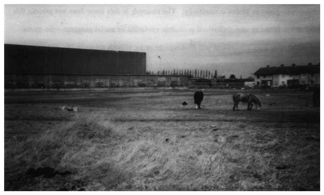
Figure 2 Site for the new Equestrian Centre in Cherry Orchard, Dublin.

programmes to date. They are financed, under EU targeted funds designed to mitigate 'social exclusion' directly from the Exchequer and they exist parallel to, if not truly independent of, government. In modern Ireland, such organizations are ubiquitous to all of the poorer neighbourhoods in the greater Dublin area and to most poorer neighbourhoods in cities and towns outside of Dublin.