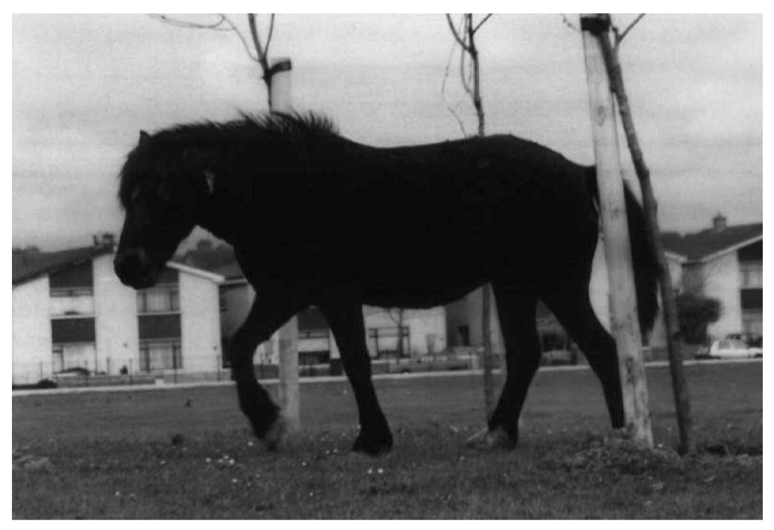
Figure 4 Suburban horse.

qualities of symbolically resisting structural violence, and invoking issues like identity and community ownership. Besides being kept as pets, they are competitively displayed in informal horse shows in the neighbourhood, as well as being a popular subject for many of the local wall murals (see Figures 3 and 4).