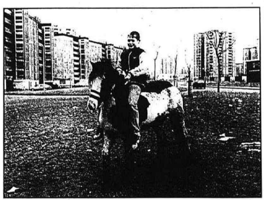
For the parents, the Dublin horse-craze phenomenon has meant no needles, no cars, no crime; for the kids — freedom.

He agrees that the majority of current owners won't be able 'te meet the licence requirements, but aid it is not corporation's role to "pander to what has built up over the years". One in five complaint to his office are about wanderin brones, he said, and they are "impractical pets" in built-up areas. "We don't have the land it build houses, let along cater for horses. Next week, the pet of the horses. Next week, the pet of the