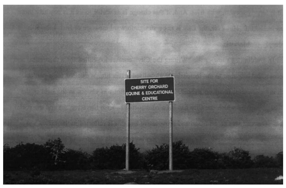
Figure 1 Site for the new Equestrian Centre in Cherry Orchard, Dublin.

The genuinely attractive idea is that there are strengths in any community and that these strengths can be built upon for socially desirable ends. Such language seems to promote an inclusive solution to problems by encouraging and (ideally empowering) various actors at the local level – business, residents, and representatives of statutory bodies and voluntary agencies (what in 'Blairspeak' in the UK are referred to as 'stakeholders') to address issues as they arise. Finally, these policies seem to move away from top-down decision-making structures, associated with older understandings of governance and towards flatter 'regulatory' models of decision-making and action.