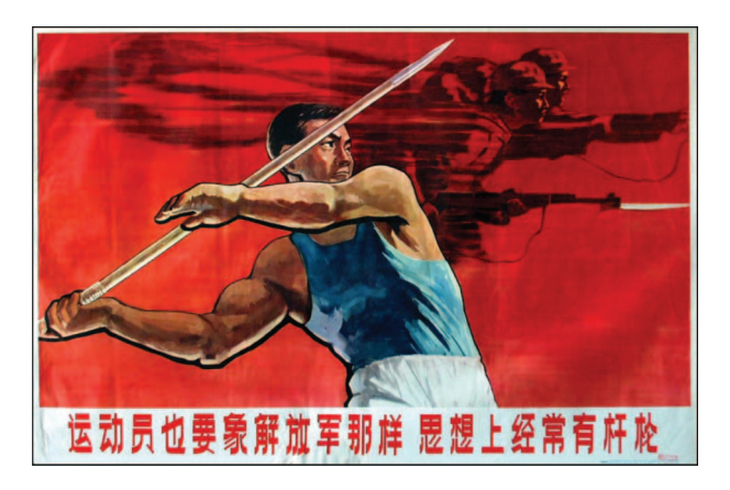
Figure 1. Sichuan People's Press. 'Athletes should learn from the People's Liberation Army and equip their minds with the right focus- like the direction of a rifle' (Poster). Chengdu: Sichuan People's Press, 1965.