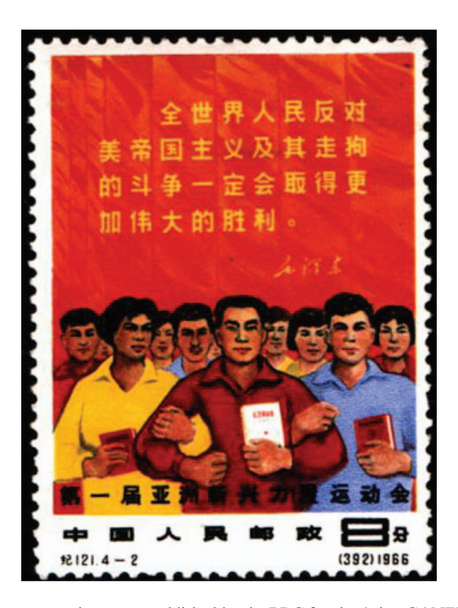
Figure 4. Commemorative stamp published by the PRC for the Asian GANEFO (published on 31 December 1966).

The Asian GANEFO was underwritten in large measure by the PRC. As in China's other diplomatic projects, for example the Algiers Conference Complex built for the 1965 Second Asian-African Conference and the TAZARA Railway Project for Tanzania and Zambia, the Chinese government helped build infrastructure in the form of a sports stadium with 50,000 seats as well as other facilities in Phnom Penh, the capital of Cambodia. It also helped train 300 referees for the games in five months. With the support of Norodom Sihanouk, the king of Cambodia, the Games were successfully held between 25 November and 6 December 1966, virtually simultaneously with the Fifth Asian Games which took place in Bangkok between 9 and 20 December 1966, from which the PRC was excluded and Taiwan included. Seventeen countries and regions with more than 2,000 athletes participated in the