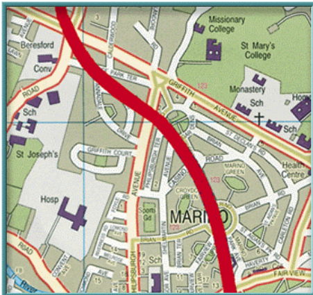
3 Via Marino