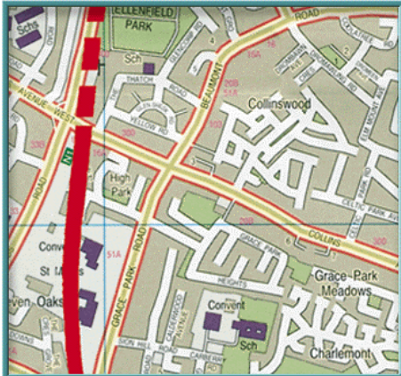
2 Via Grace Park Road