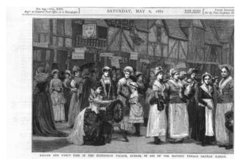
FIGURE 2 'Lady stallholders' for the 'Old Dublin' Masonic Bazaar, 1892.

bazaars' appeal, and further emphasises the familiarity of the Dublin crowds (as well as the bazaar organisers) with the 'modern' interests in both Eastern exotica and commercial entertainments such as early cinema and internationally known music hall acts.