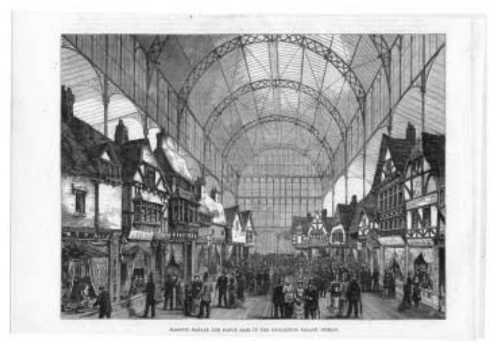
FIGURE 1 The plaster and lath 'Old Dublin' of the Masonic Bazaar, 1892.

Of course, the West's interpretation of 'the East' is evoked in the very concept of the bazaar, and this had been used both to increase the bazaar's allure to customers and to raise moral, social and political concerns about their impact upon Western society for as long as they had been held. Few if any moral or social concerns seem to have been raised about the 1890s Dublin bazaars, however, and indeed their presentation of 'the East' appears to have mutated by this late stage of the nineteenth century into a highly