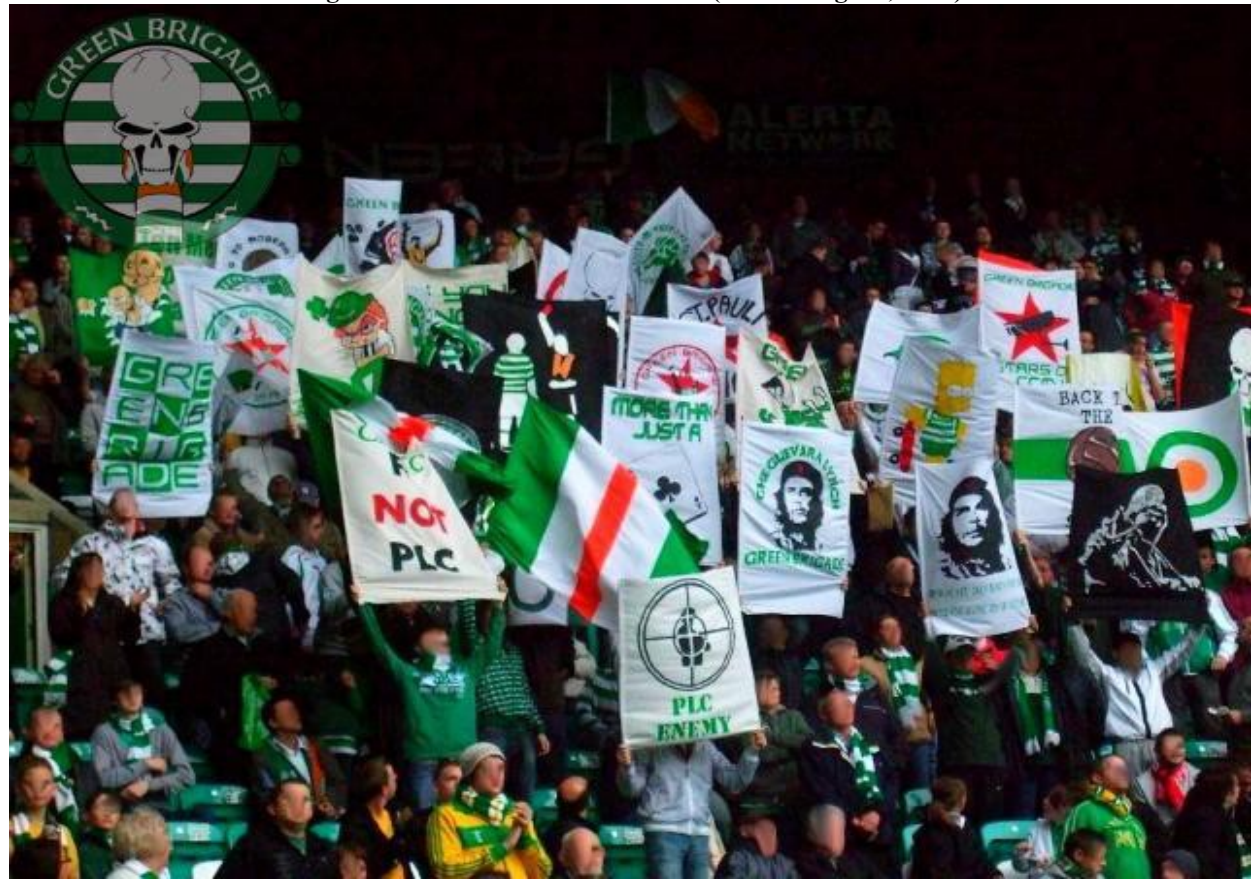
Various two-sticks (Green Brigade, 2014)