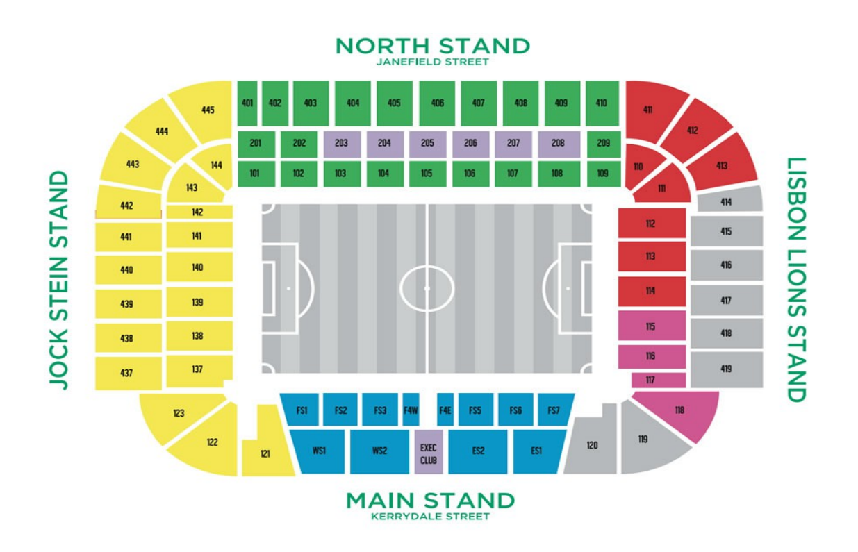
Plan of Celtic Park, with the Green Brigade's Section 111 in the lower tier of the North East corner of the stadium (Celtic FC, 2014)

From the outset the group created a distinctive set of symbols, with the 'rebel' identity of the group expressed in their slogan, 'Until The Last Rebel', sometimes written as 'UTLR'. The group badge is a skull, resembling a football, with an Irish tricolour scarf around its neck.