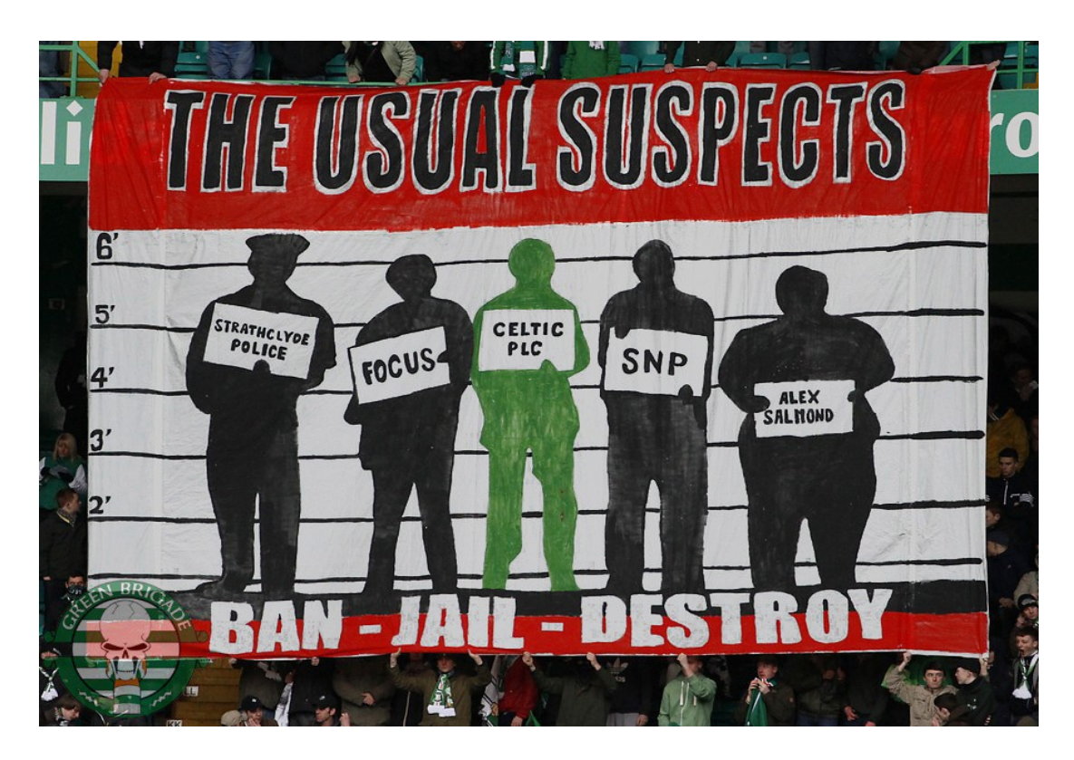
'The Usual Suspects. Strathclyde Police. FOCUS. Celtic Plc. SNP. Alex Salmond.