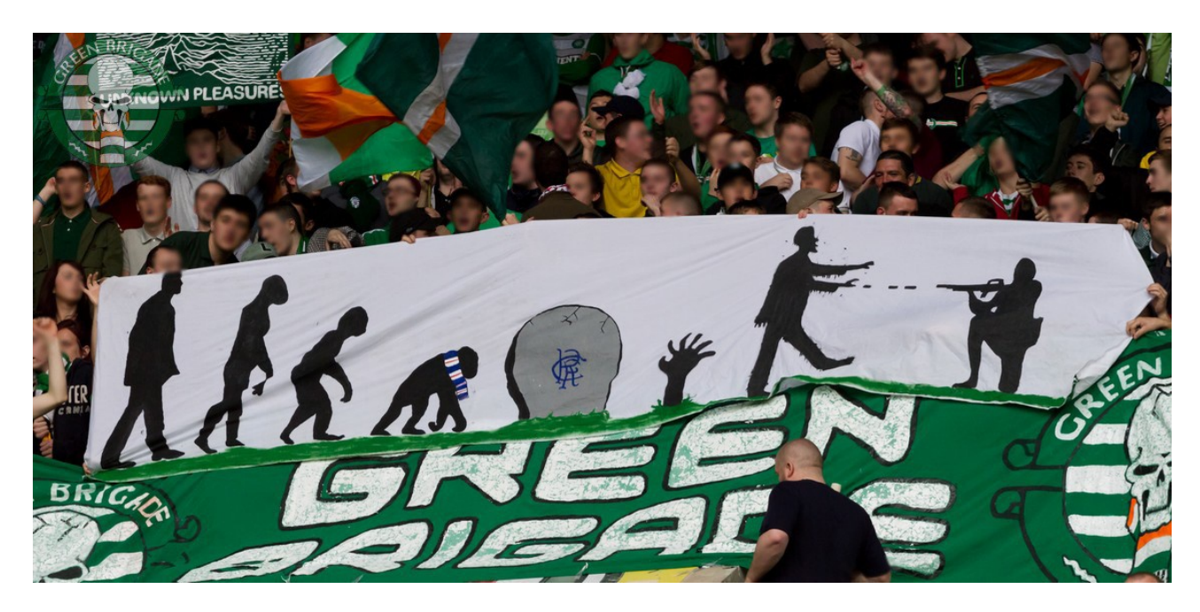
"Zombie" banner Celtic vs Norwich (Green Brigade, 2014)

[...] a kind of de-evolution of humanity, coming down from the Rangers strip, right down to the monkey, em, down into the grave, resurrecting as a zombie, and then, em, a silhouette rifleman shooting a zombie. For a lot of people that was seen as harmless, and couldn't be considered a crime because zombies aren't real. (Participant 3: 9)