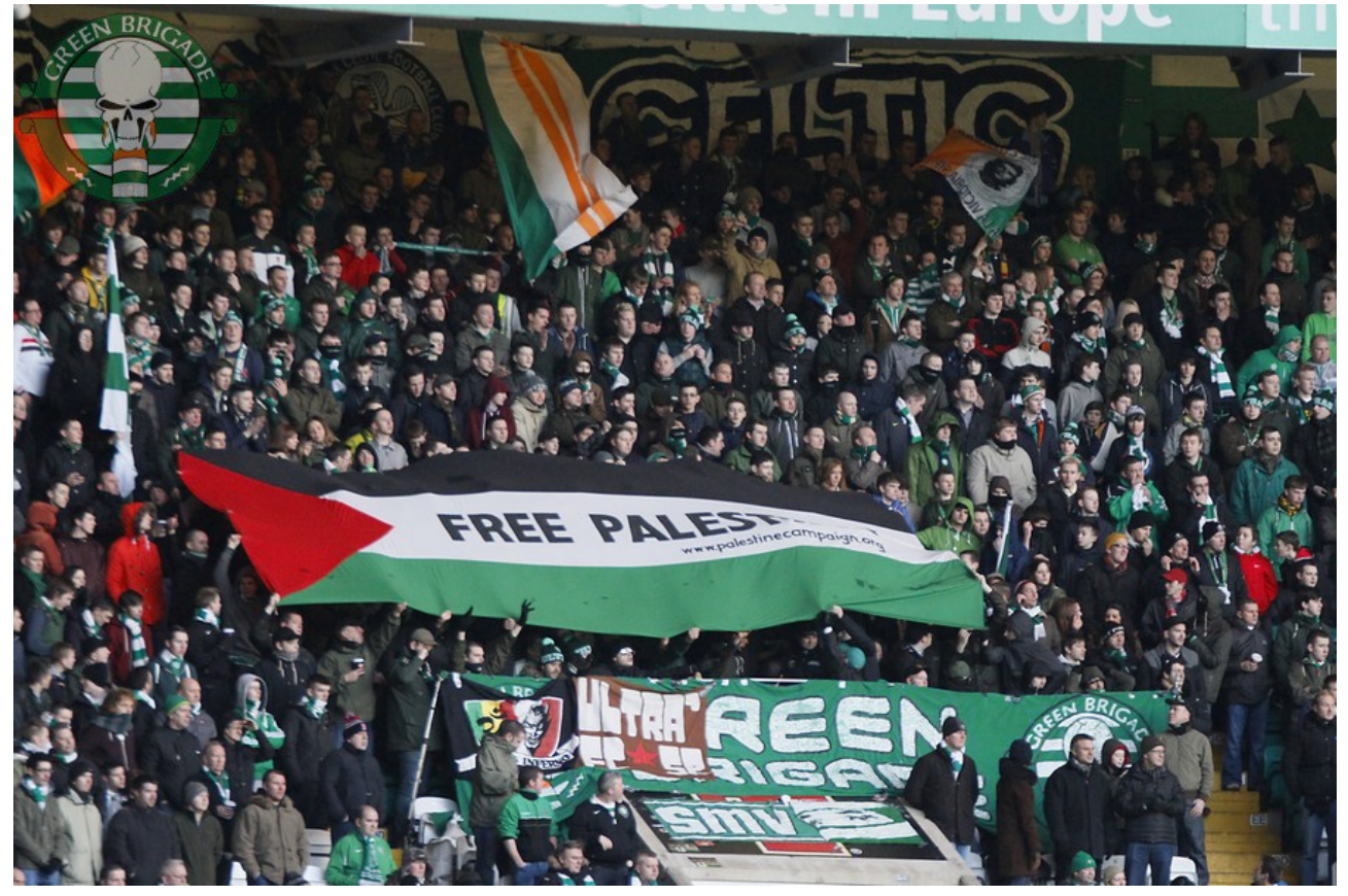
Celtic vs Hearts, 2012/2013 Season (Green Brigade, 2014)