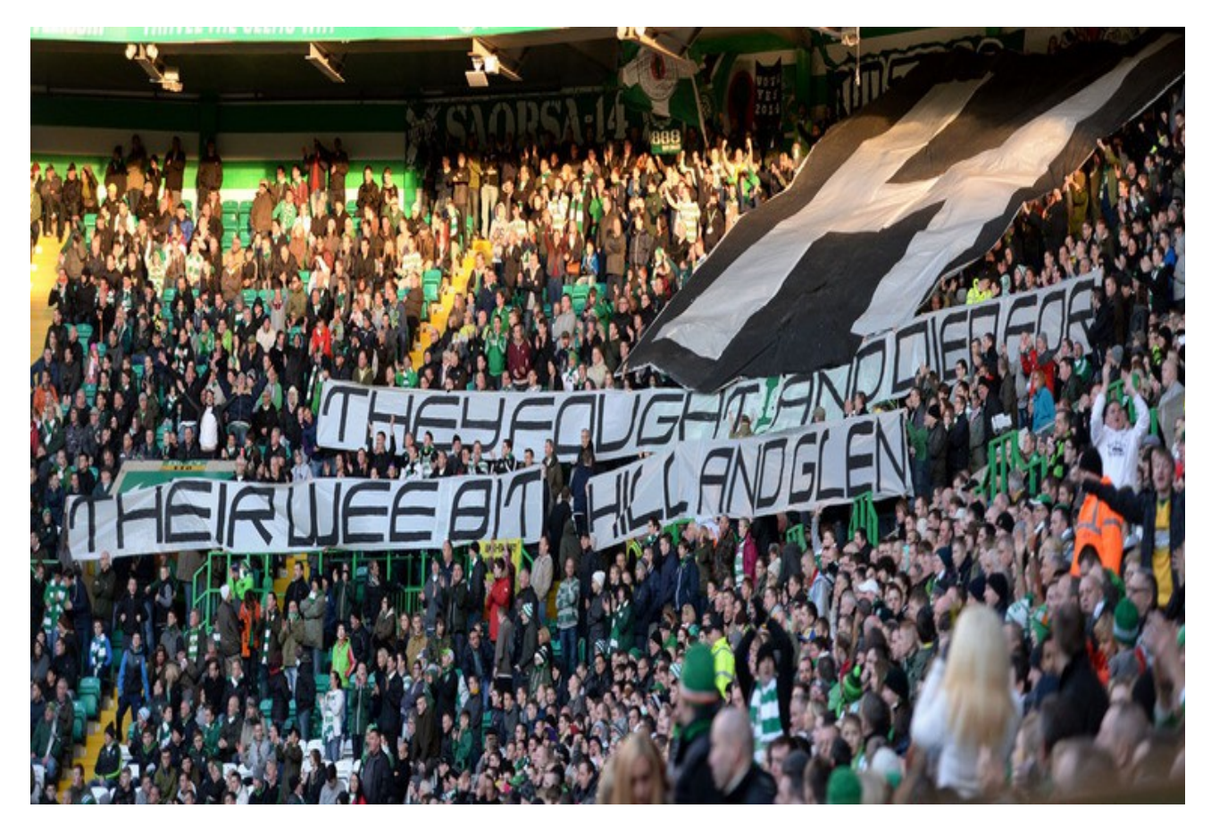
'H - They fought and died for their wee bit hill and glen' Celtic vs Aberdeen, 23<sup>rd</sup> November 2013 (Sky Sports, 2014)