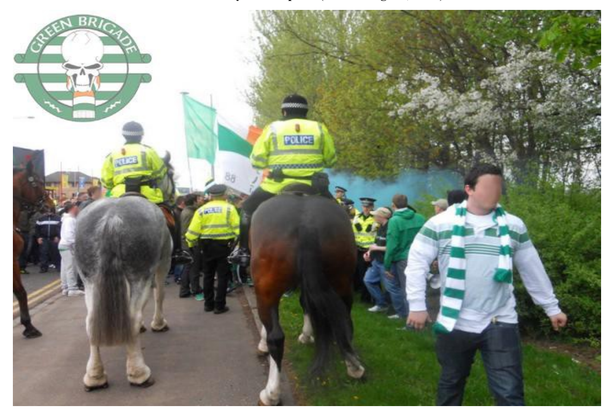
Police move in after pyro is lit (Green Brigade, 2014)