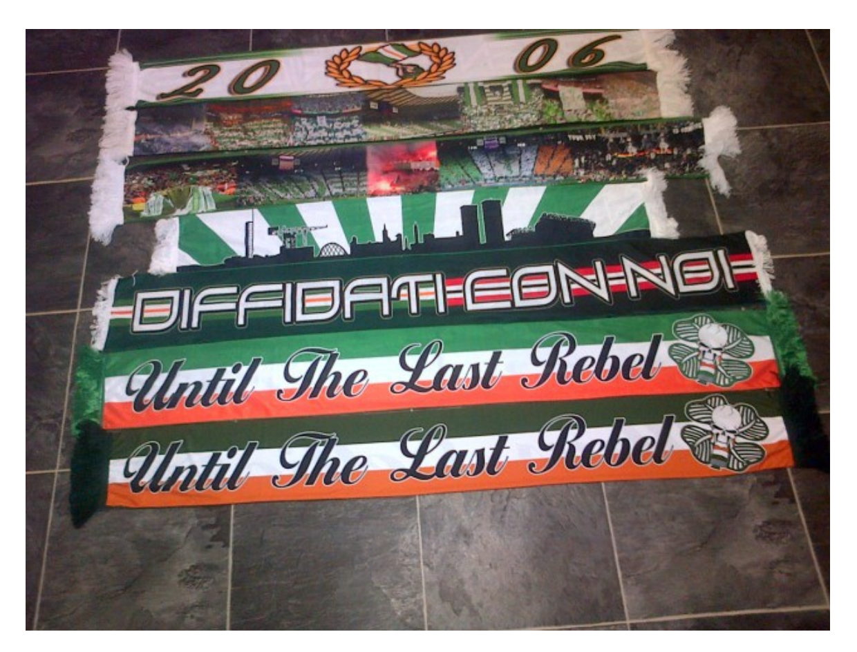
Green Brigade scarves (Green Brigade, 2014)

As well as stickers, the Green Brigade also produces merchandise, or merch, which it sells to raise funds, gifts and swaps with other ultra groups, and wears itself to matches and social events. Merch varies from silk-printed scarves featuring various designs, to items of clothing such as t-shirts, hoodies, shorts, rainproof jackets and cagoules, baseball caps and bucket hats, and enamel pins (Ultras Tifo 2014).