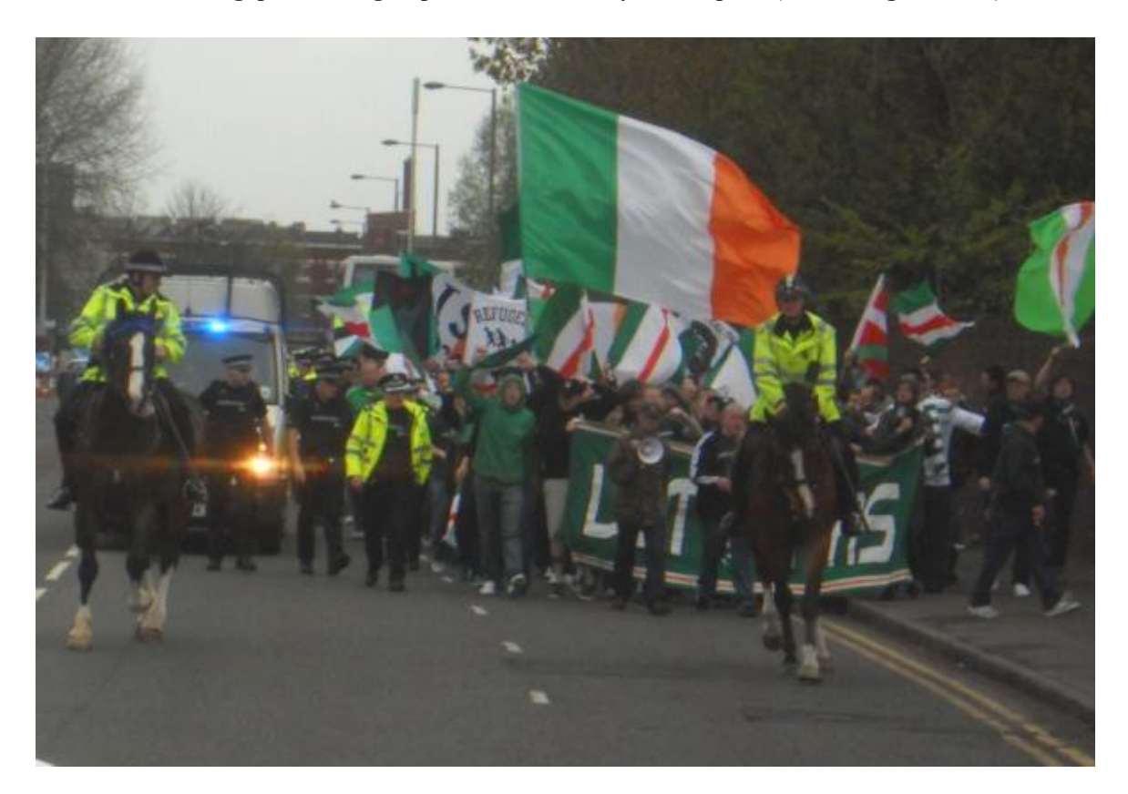
Tricolour, group banner, and police 'escort' (Green Brigade, 2014)