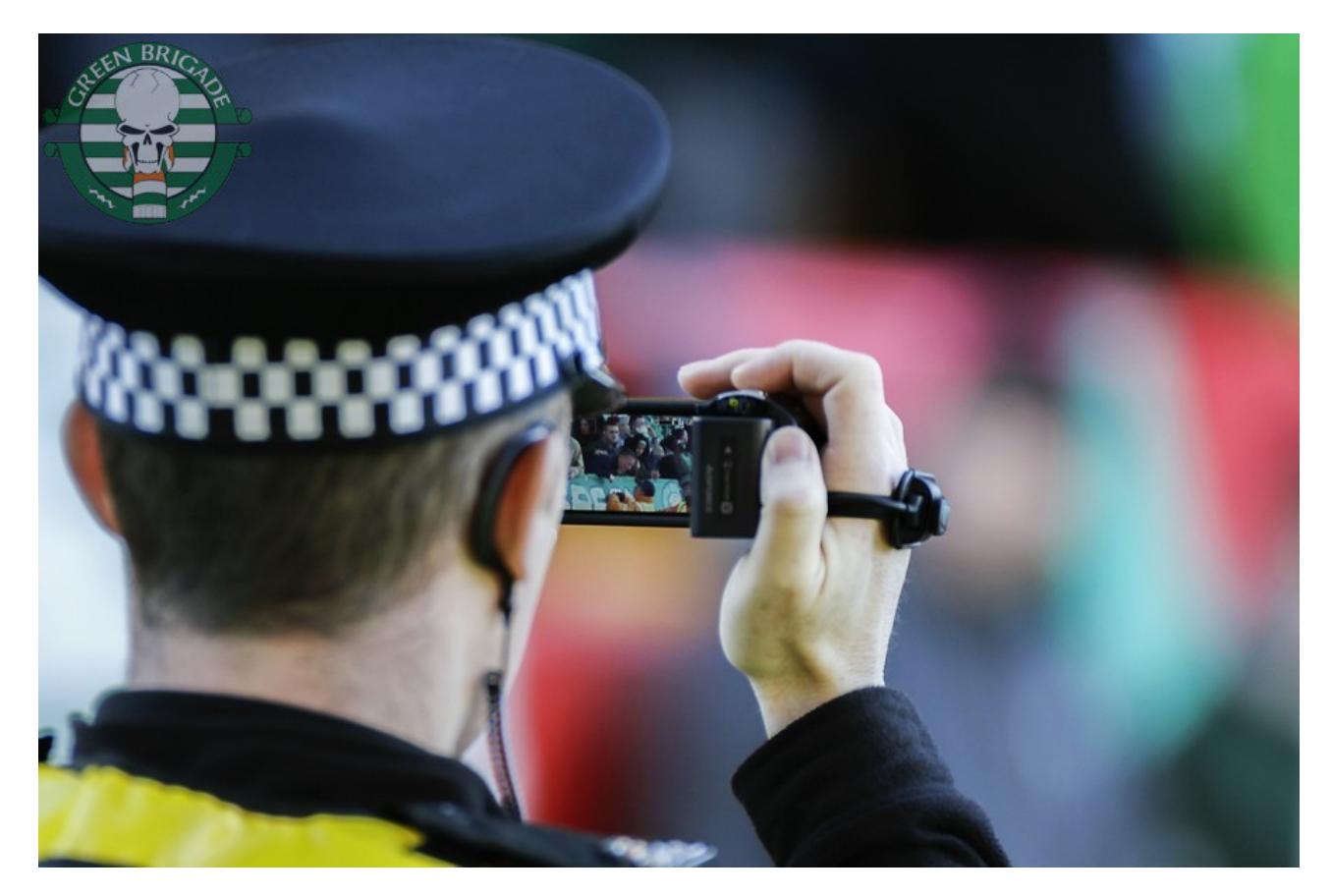
Police video-record Green Brigade members (Green Brigade, 2014)

As well as the 'human' interaction between police and group members, from stop and searches to baton charges, there is also a more detached, yet equally as intrusive, form of police harassment in, namely the use of surveillance. This most often takes the form of using video camera surveillance, either with hand-held video cameras, with cameras mounted to officers' stab vests, or the use of fixed CCTV.