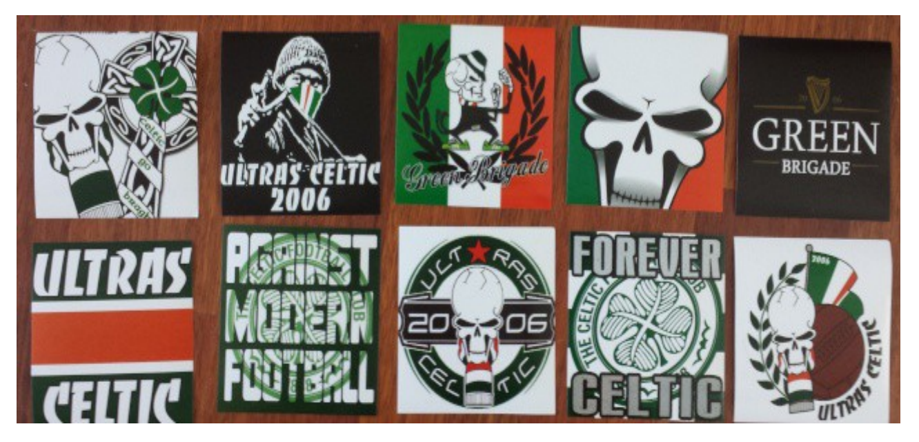
A recent batch of Green Brigade stickers (Ultras Tifo, 2014)