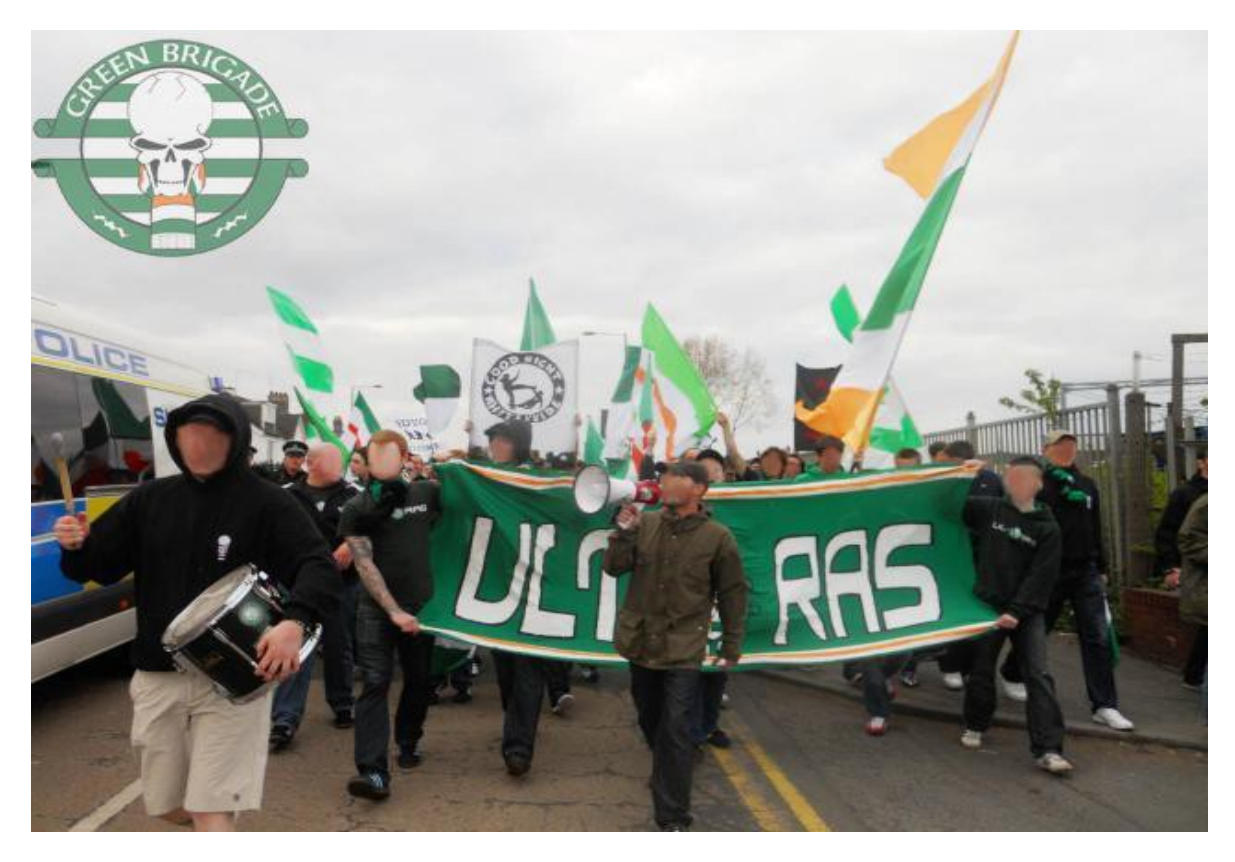
Drum, megaphone and group banner on the way to Hampden (Green Brigade, 2014)