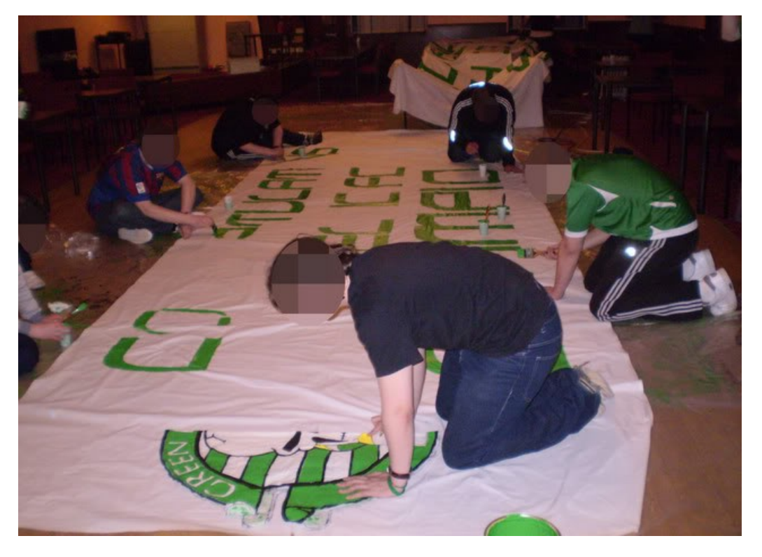
A banner making session (Green Brigade, 2014)

Banners are a central tool for expressing the group's beliefs and identity, with banner-making also providing a social space for members to meet with non-members, and is one of the main ways for interested people to get their faces known and to get involved in group activities (Twists n Turns, 2014). The group has also consistently used a distinctive font ('Zero Hour') in the majority of its tifo (banner) displays (dafont.com, 2014)<sup>3</sup>. Displays have included protests about Bloody Sunday, displays of friendship with other ultra groups, mocking Rangers, the Great Hunger, anti-Irish racism, Palestine, the Offensive Behaviour Bill, and celebrations of Celtic's history (Green Brigade, 2014).