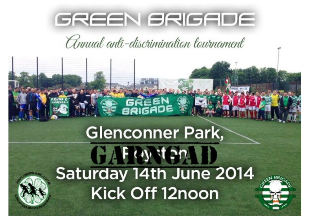
Advertisement for the 2014 Anti-Discrimination

Football Tournament in the Garngad area of Glasgow (Green Brigade, 2014)