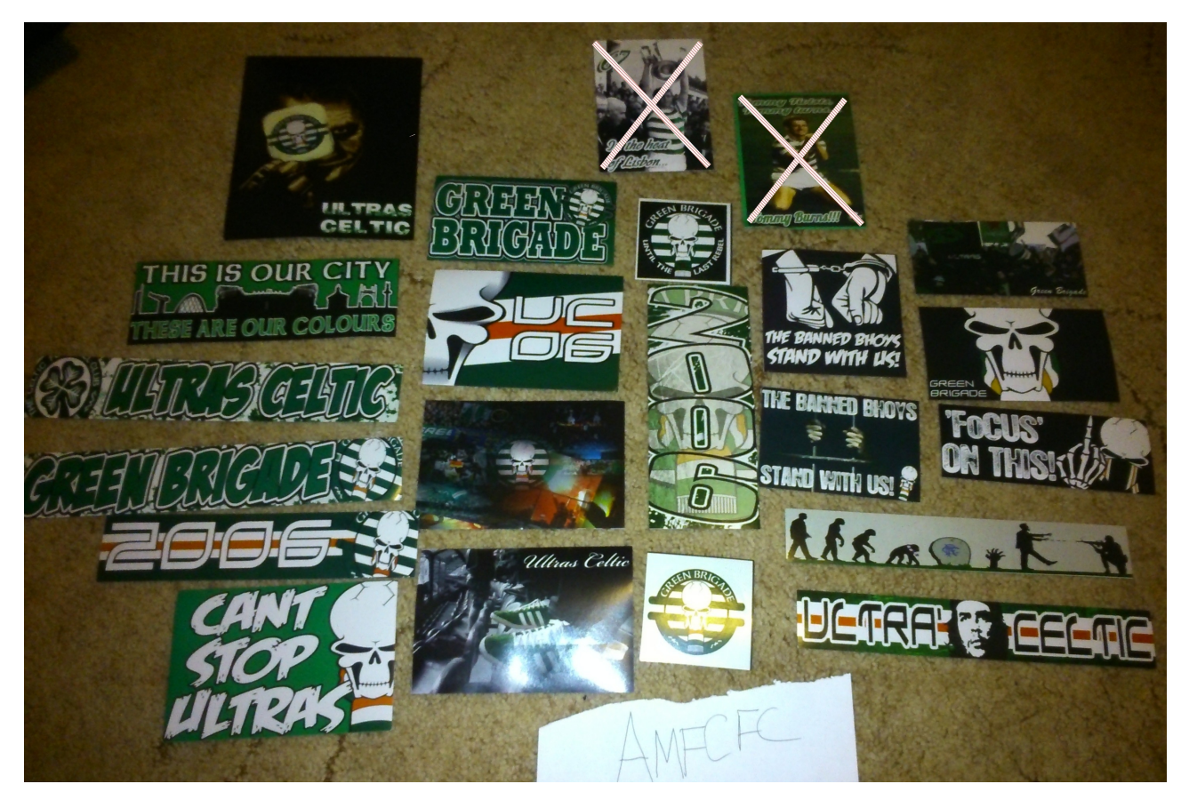
A selection of Green Brigade stickers