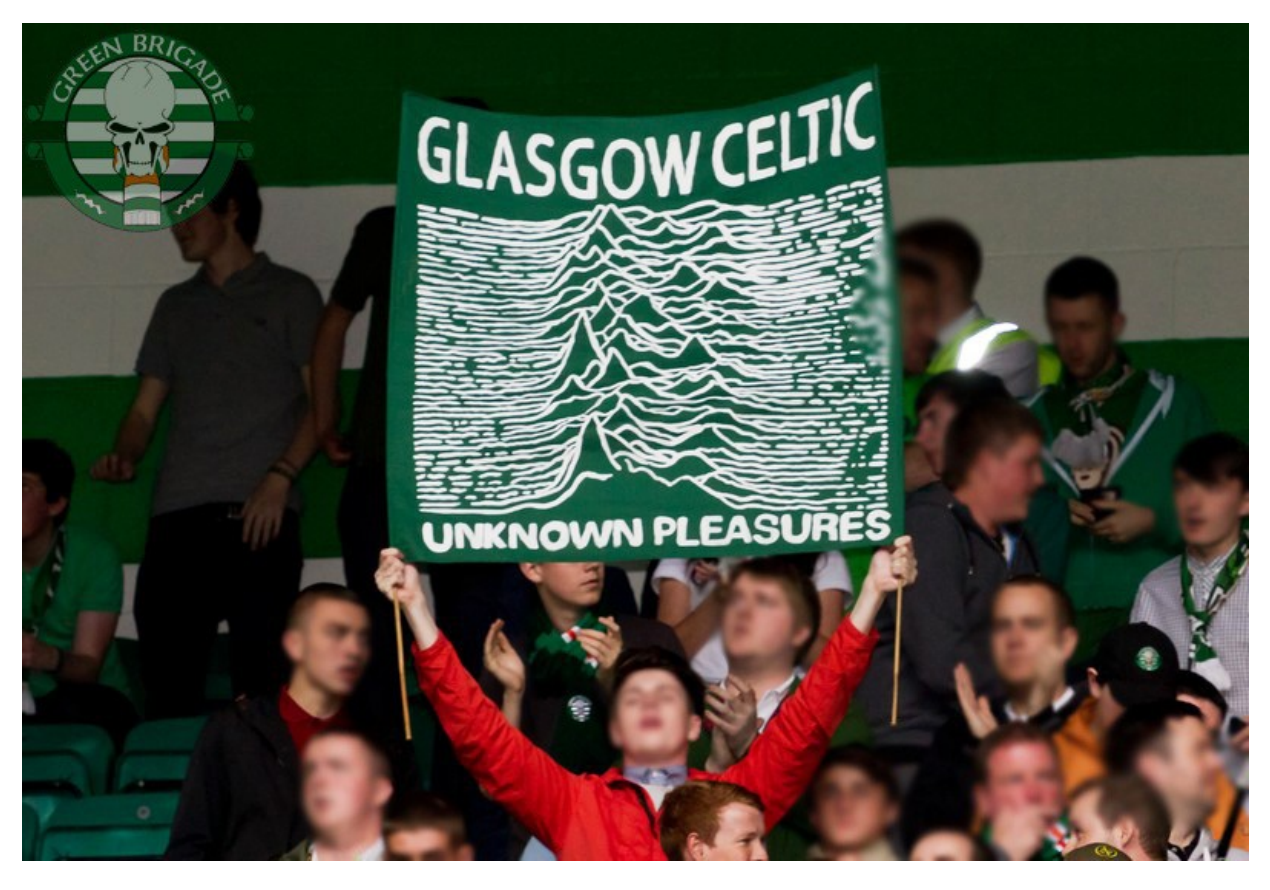
'Glasgow Celtic – Unknown Pleasures' (Green Brigade, 2014)