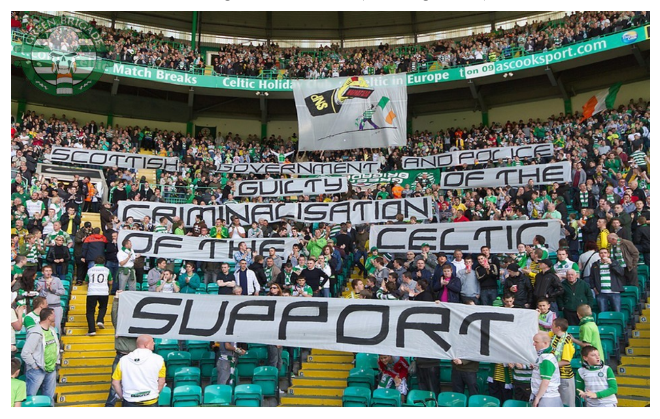
'Scottish Government and Police guilty of the criminalisation of the Celtic support' Celtic vs Inverness, 2011/2012 Season (Green Brigade, 2014)

Celtic vs Rangers, 2011/2012 Season (Green Brigade, 2014)