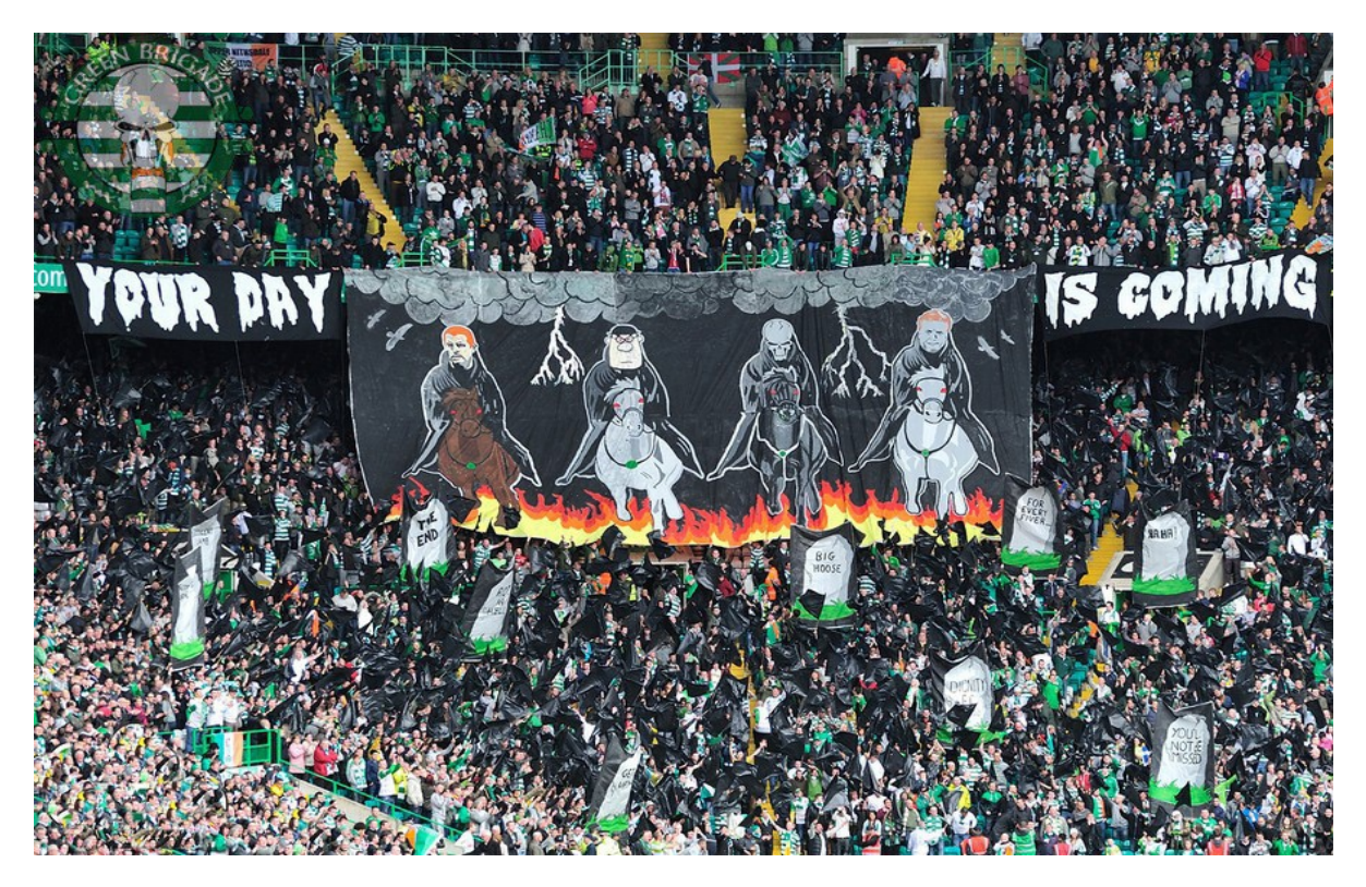
Four horsemen of the Apocalypse display mocking the impending liquidation of Rangers

Celtic vs Rangers, 2011/2012 Season (Green Brigade, 2014)