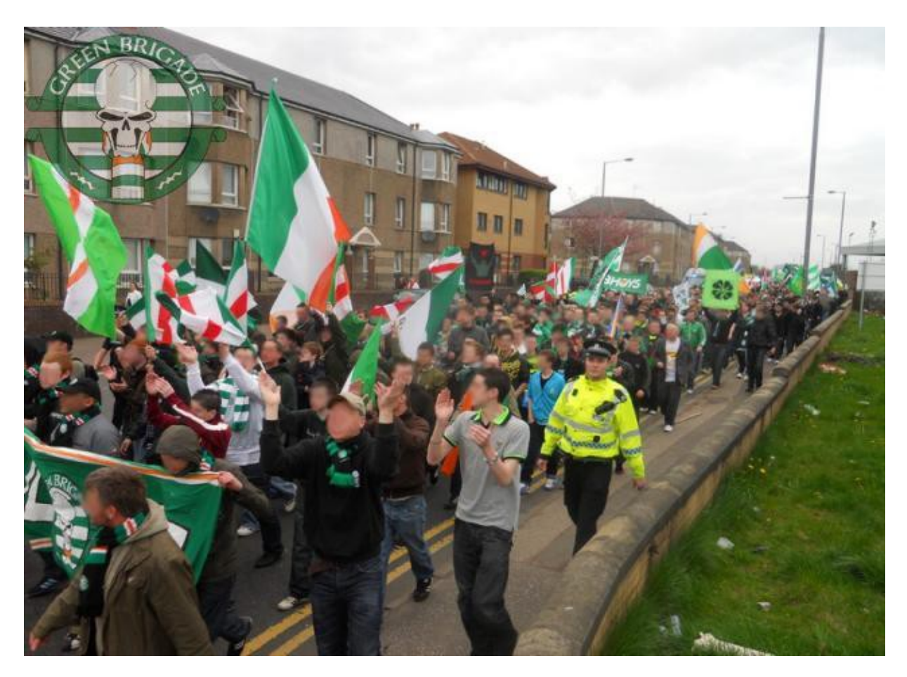
On the way to Hampden (Green Brigade, 2014)