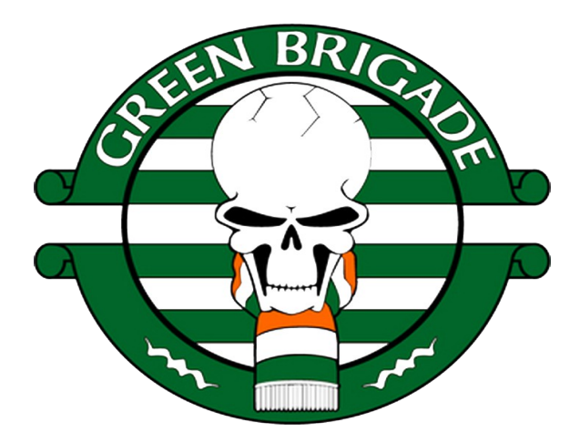
The Green Brigade badge (Green Brigade, 2014)

From the outset the group created a distinctive set of symbols, with the 'rebel' identity of the group expressed in their slogan, 'Until The Last Rebel', sometimes written as 'UTLR'. The group badge is a skull, resembling a football, with an Irish tricolour scarf around its neck.