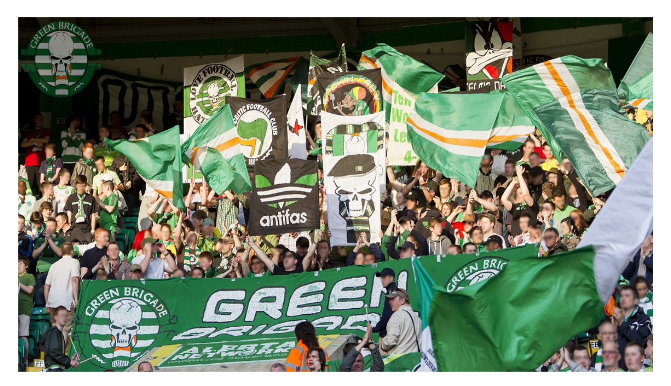
Various two-sticks (Green Brigade, 2014)