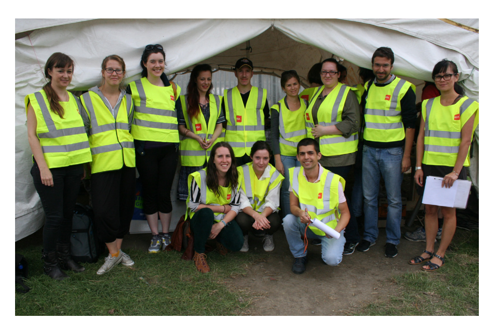
Figure 5: Volunteers at Granby Park, 20 August 2013.

experience, or helping them to improve their language skills. Of the 43% not currently in active employment for a number of reasons, over half of these felt they gained skills through volunteering in the park. 10% of the respondents said that volunteering at the park had helped them to gain employment, which is an incredible legacy for GP. While the majority of volunteers had volunteered before (80%), nearly all (98%) said they would volunteer in the future as a result of this positive experience. This may be attributed to the striking sense of community and camaraderie amongst the volunteers we observed. But also many volunteers commented that they felt a sense of achievement by contributing to the park. Not one respondent felt that the experience was negative; half of the people surveyed said that the main reason they volunteered was because they believed in the goals of the park as communicated by Upstart.