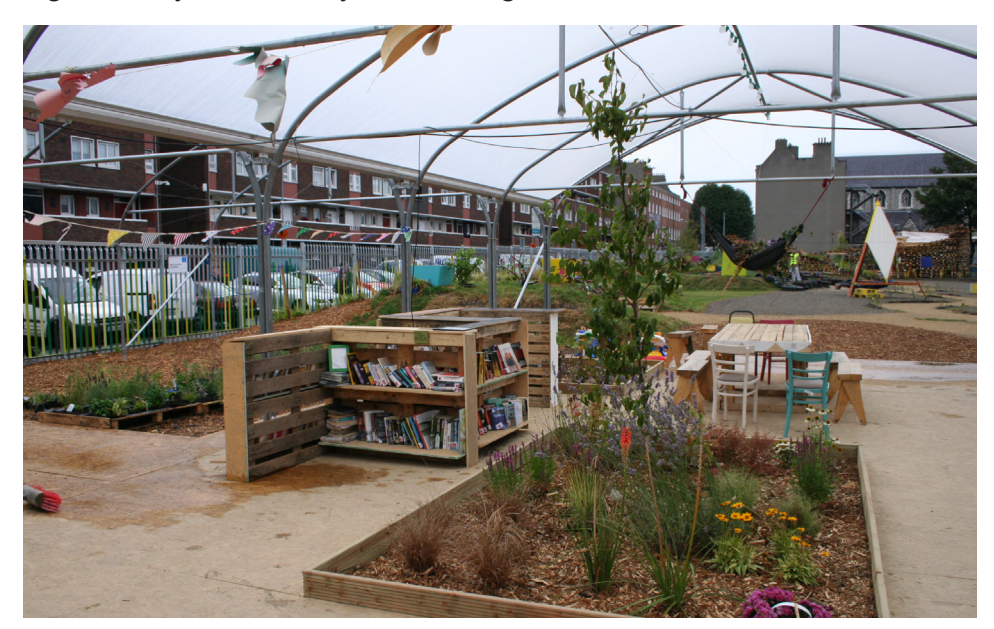
Figure 4: Polytunnel & Library, Granby Park, 12 September 2013.

by McArdle on 4 September 2013; based on the respondents and feedback from the research team, some questions were slightly revised. Second, the final version was available from 7-21 September at the Park's Information Desk for visitors to complete voluntarily on their own, or with the help of a Front Desk volunteer. 156 of these surveys were completed in total. In both phases, respondents were asked if they could be contacted again for a possible interview or further questions; from the pilot surveys, five people were willing to be contacted again and provided email addresses, and