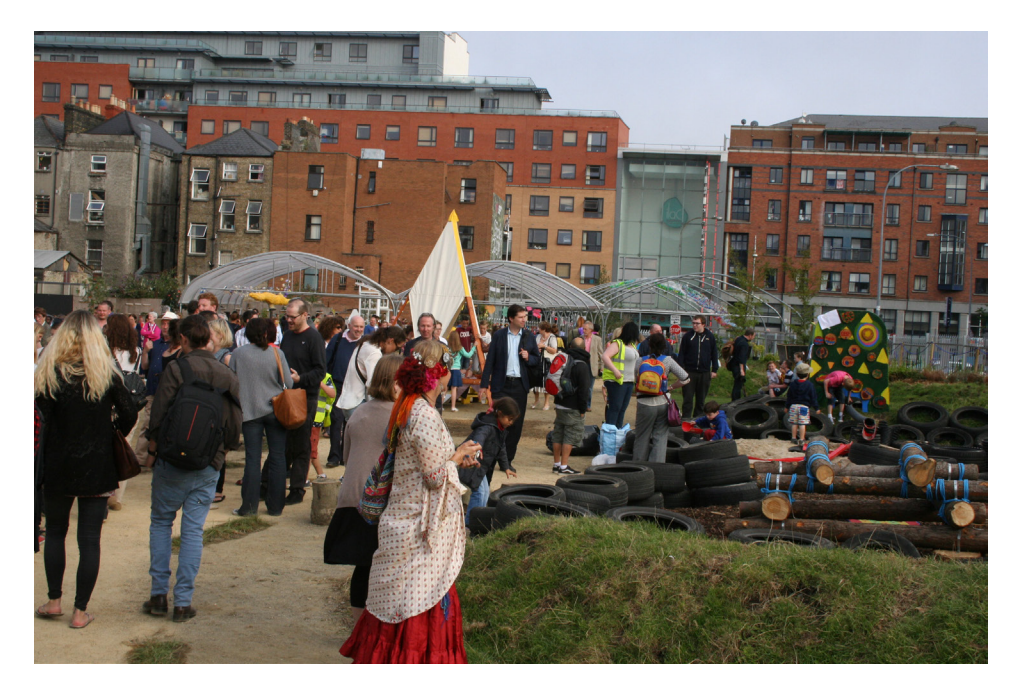
Figure 1: Launch of Granby Park, 23 August 2013.

park's concept and coordinated a volunteer network responsible for its day-to-day running, the park was to be 'a place of creativity, nature, imagination, play and beauty' that was free and open to everyone (Granby Park, 2013). Before and after the opening of the park, other not-so-visible and experimental local, volunteer and community-based projects contributed to and built upon the park's success (Kearns, 2013). Overall, the park was well received in the media and locally, but criticised by some scholars for using public funds and contributing to the city's neoliberal agenda (Bresnihan and Byrne, 2013), and by some artists for not working closely enough with the community (public discussion at Granby Park, 2013).