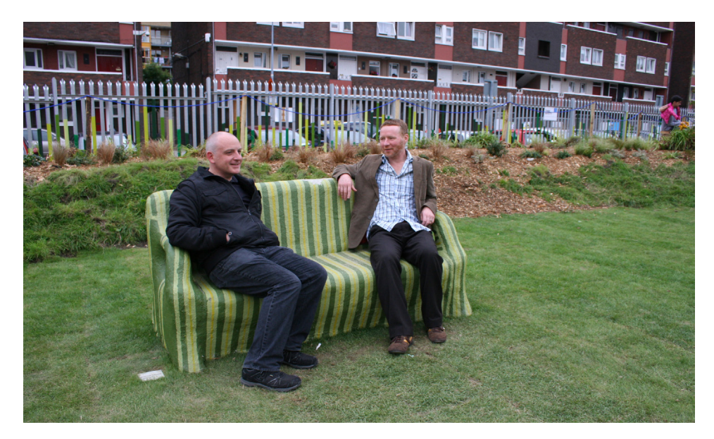
Figure 7: Creating a manifold commons: Granby Park as a convivial space in the city.

their children played in the park. Volunteers also remarked upon the positive community spirit, and how inspiring it was to change people's attitudes and perceptions of the local area. Both visitors and volunteers also valued what one visitor described as the 'cross-pollination' of different groups of people in the same space. Quotes from the volunteers included that they: enjoyed 'networking with people outside their own sphere of influence'; felt empowered that they 'can do something useful'; enjoyed meeting a 'cross-section of people and personalities' and one person 'was surprised by the number of fellow-volunteers I met who live in my neighbourhood, but whom I'd never met before'.