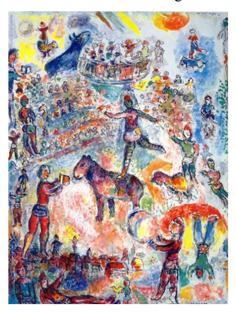
The Great Circus by Marc Chagall<sup>10</sup> (1984)

We all had a physical space, either floor space and/or tables to facilitate hands-on activities and demonstrations to encourage visitors' participation and interest in the STEM topics.