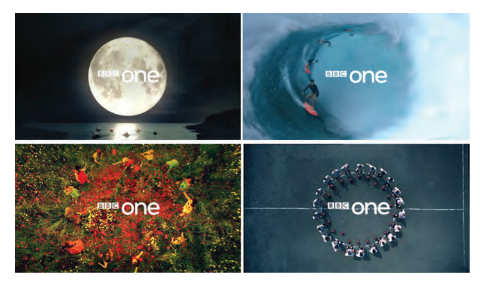
Figure 5. BBC1 idents 2006 (RedBee, 2006).

The few remaining original BBC designers had reinvented themselves by embracing new commercial business practices that had inflicted painful restructuring, but they were now beating the independent design companies at their own game. Prestige had returned within the department, but at a cost to what Williams (1981) describes as the 'alternative' and 'oppositional' groups – the part of the workforce that remains attached to older cultural practices. RedBee's reach had become global to the point that in 2010 it was disqualified from the Design Week survey, which now viewed RedBee as a global rather than a UK company (Design Week, 2010).