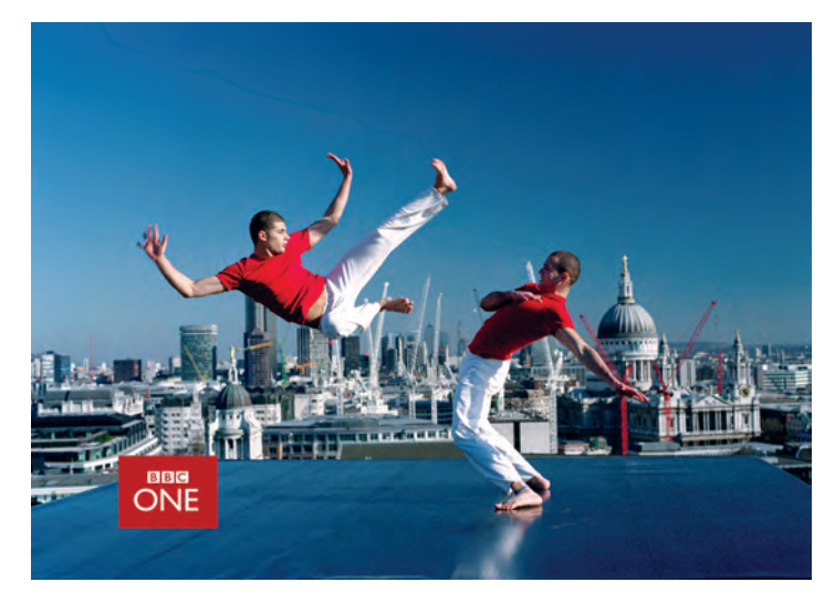
Figure 3. BBC1 Rhythm and Movement ident 2002 (Lambie-Nairn, 2002).

(Wormleighton interview, 2010). A 20-year career as a civil servant in public broadcasting did little to equip a designer for the commercial market, and so many left the industry along with their heritage skills, while a few of those who were made redundant set themselves up as freelancers offering 'traditional tv graphic design' (BECTU, 2002).