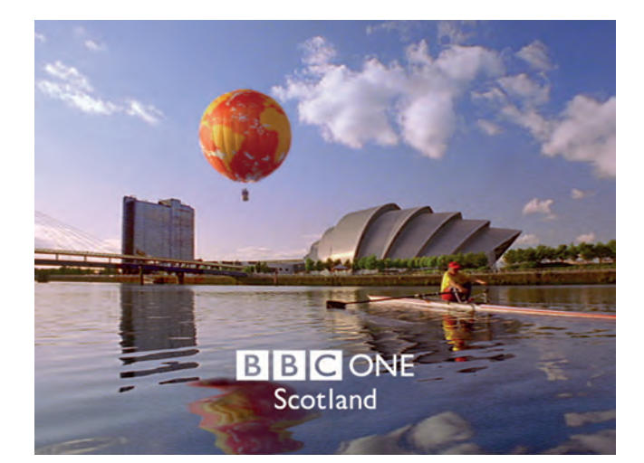
Figure 2. BBC1 balloon globe ident 1997 (Lambie-Nairn, 1997).

But after 2001 when the dot-com bubble burst, the balloon was replaced by a more rooted human image of multicultural performances, some situated again in scenic UK environments (see Figure 3). The BBC1 Rhythm and Movement idents (2002) caused dismay to many viewers by abandoning the BBC globe motif after 39 years on air (BBC, 2012). The dot-com crash had a more devastating effect on the BBC design workforce, 'a massive downsizing and an end of the old ways' (Conrad interview, 2010). There was 'a major cut in the number of traditional TV graphic designers in London' (BECTU, 2002). The oppositional and alternative groups, those who represented old analogue skills and the commitment to a public service, were made redundant and all vestiges of the old culture and its associated skills were lost, but for a few exceptional designers. What qualities did they have as designers to survive? 'There was a skills divide, and more importantly a mental divide: those who saw the BBC as a job for life, and those who wanted to further their careers'