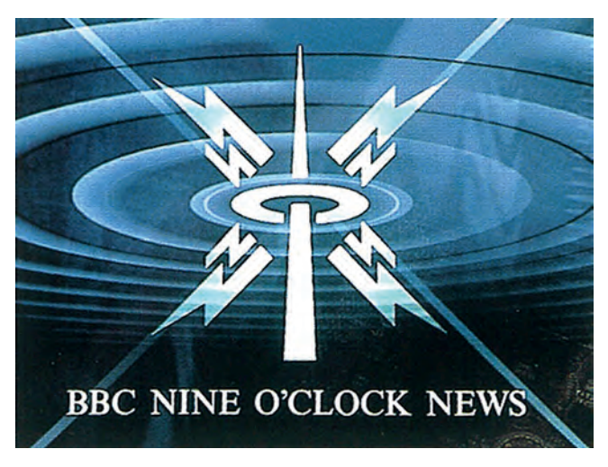
Figure 1. BBC News title sequence 1988 (Lambie-Nairn, 1988). Reproduced with permission.

culture industries appears to have similarities to the highly bureaucratised nature of the BBC, as well as its ideological relationship with mediating culture (both highbrow and popular) to the masses. While some reject Adorno's position that culture would like to be 'untouchable' and free from 'tactical or technical considerations' (Adorno, 1991: 93) as a nostalgic attachment to a pre-industrial form of cultural production, there is an important and continuing interest in understanding the increasing commodification of culture (Miege, 1989).