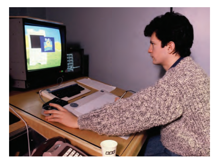
Figure 6. BBC graphic designer using Quantel Paintbox 1988.

Cheesman, and later Liz Friedman, continued to make a significant contribution to the visual change of television graphics through the following generations of designers that they taught. For many young designers of the postmodern age, there was the allure of new digital techniques to 'constantly pressure the designer into the temptations of movement and surface gloss as a solution to every problem' (Crook in Merritt, 1987: 45).