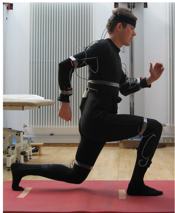
Fig. 2. Motion tracking suit with embedded sensors during the straight line lunge exercise.

After completing a motion sequence, the players' motion data is saved and loaded in a motion object. The offline feedback takes as input both the players and the experts motion object and calculates performance values for each of the sequences between milestones. Currently this figure is calculated using a distance metric in Euler space. This facilitates progression mapping of the players' performance over time. The following case study demonstrates how offline analysis can be utilised by a clinician to highlight the key areas that an athlete needs to improve on.