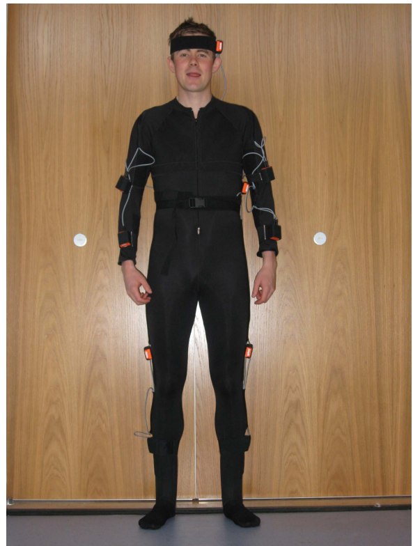
Fig. 1. Motion tracking suit with embedded Xsens sensors.

Sensor data is processed in real-time to administer audio and visual biofeedback to the users along with recording data for post game analysis. This is based on their performance in the game (i.e. how close the player is to the correct body alignment throughout the exercise programme) against pre defined expert level of performance. Modifiable