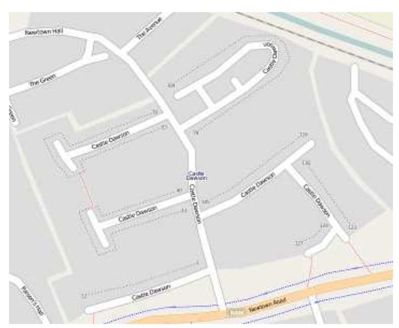
Fig. 1: An example of high resolution mapping in OSM. This is the Castle Dawson estate in Maynooth

than creating separate systems for each conference the ultimate goal is to have a standard campus navigation tool which can reused and can be easily customised by the conference organisers to satisfy their own specific requirements. After a brief survey of the academic and research staff in the Department of Computer Science at NUIM the most frequently asked questions of delegates of a conference are as follows: