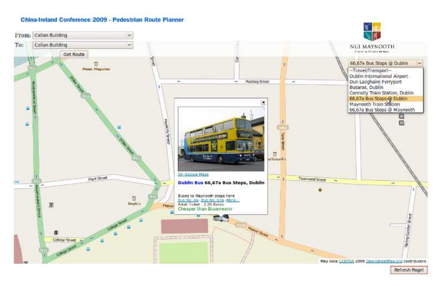
Fig. 5: The Dublin Bus travel information appears in the marker infowindow