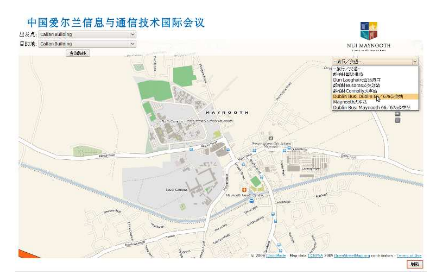
Fig. 6: A screen shot of the campus navigation system interface provided in the Chinese language