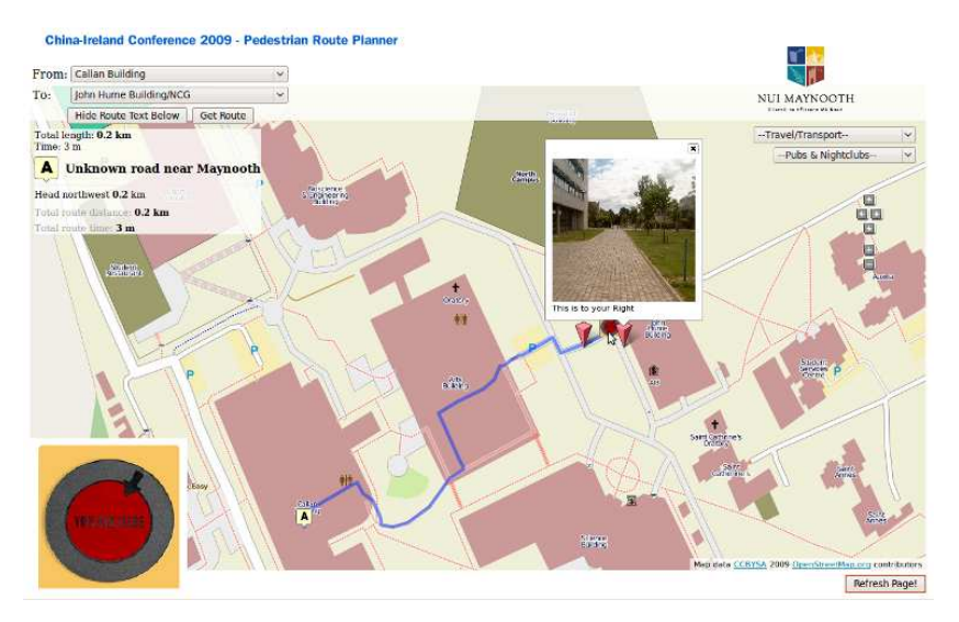
Fig. 4: Geotagged images used for assisting navigation

shortest path from. The system dynamically calculates the new shortest path and updates the map display accordingly. The geographical area from which the user can select a random points from which to plan new shortest paths between has been constrained to a 3KM grid centered on the campus.