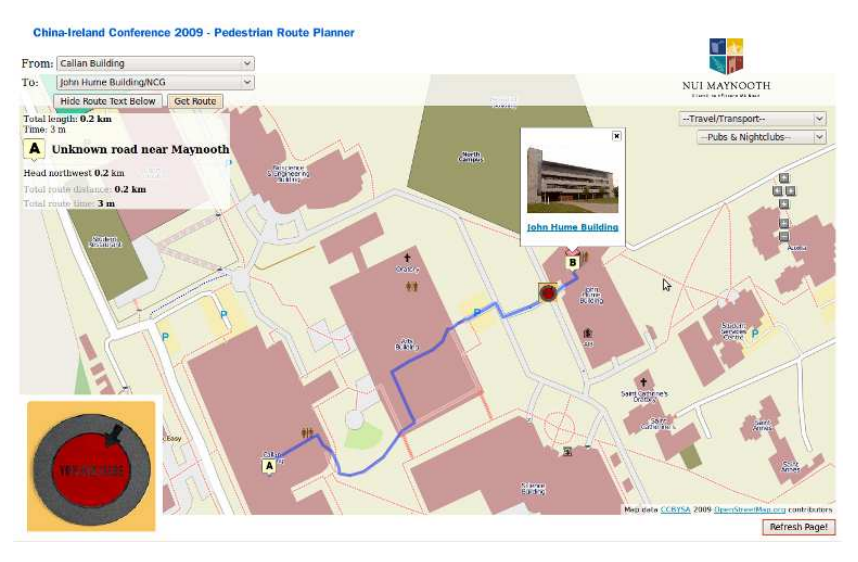
Fig. 3: The shortest pedestrian path between Callan and John Hume building using both internal corridors and external pavements

will not have access to an automobile or a bicycle during the duration of the conference. The richness of the OSM map of NUIM means that the CloudMade API can find routes on internal corridors and external footpaths, lanes, and streets. Figure 3 shows the shortest pedestrian path computed by the Cloudmade API between two buildings on the NUIM. The proposed route includes both indoor corridors and outdoor pedestrian pavements. The exact nature of the route is determined by the setting of the travelMode option as input to the route finding algorithm in the API. As mentioned above the choices available for travelMode are: \{car, car/shortest, foot, bicycle\} .