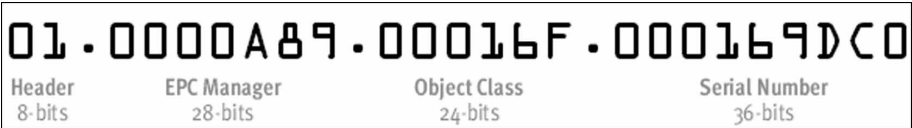
Figure 5. The structure of a 96-bit EPC (Electronic Product Code), partitioned into four parts to allow flexibility in object identification RFID (Radio Frequency Identification) tags. The header defines the type of EPC. The 28-bit manager element allows for 268 435 455 different users (typically product manufacturers), who are able to define uniquely 16 777 215 different types of object. Each of these is then assigned a 36-bit serial number, giving a total of 68 719 476 735 potential unique identification numbers per object type. In total the EPC-96 number space can uniquely identify 3^{26} different entities (source: Technology Guide, Auto-ID Centre, 2002; http://www.autoidcenter.org ).