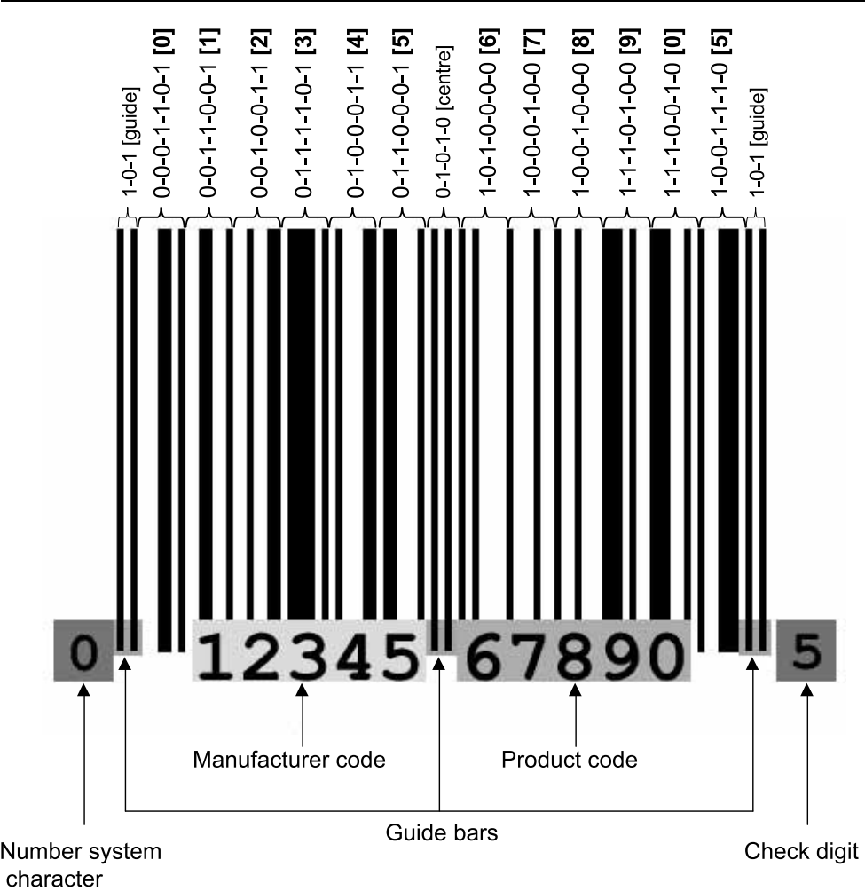
Figure 2. Decoding the barcode. Shown is a 12-digit UPC (Universal Product Code) barcode used in the United States and managed by the Uniform Code Council. The barcode media stores the number 012345678905, with each digit encoded in binary form by a unique sequence of seven black bars (1) and white spaces (0). The number 3, for example, is represented by the sequence: space – bar – bar – bar – bar – space – bar (0111101). The binary representation on the left-hand and right-hand sides are inverses of each other, so the barcode can be scanned unambiguously from either direction.

Moving beyond physical objects, there has been a move to generating capta related to information (text, sound, image, or video). Conventionally, industry-specific identification systems have developed to be focused around the particular media format that information is usually stored and distributed on, such as ISBNs for books, ISSNs for periodicals (the one for Society and Space being 02637758, which is represented as a barcode on the back cover of the printed issue), and ISWC for music. (6) These codes are often inscribed on the