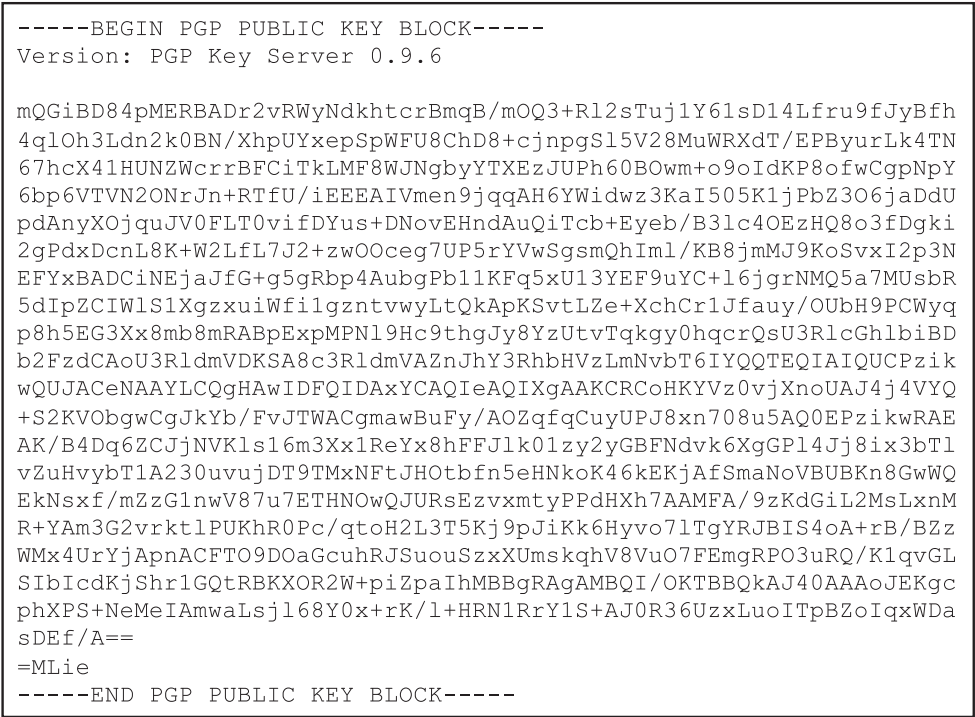
Figure 1. A 1024-bit public key used for encrypting messages for secure e-mail communication using the Pretty-Good Privacy software. This identification code provides a digital signature which effectively authenticates the sender.

The key characteristics of identification code numbers are their form (length and formatting), their granularity, and the extent of recognition and reputation. Code numbers can be defined by the creator of the system to be any length, particularly when they are only ever handled by computers. Where identification codes are used to authorise access to significant resources (especially money), then code length can be significant in determining security. Many identification code numbers used in business and telecommunications are very long indeed (figure 1). Codes also vary as a function of the type of valid characters they can contain—numeric, alphabetic. With regards to granularity, the most obvious level for people is that of the individual. For objects, information, and spaces, granularity is more problematic. For example, spaces vary as a function of scale (for example, households, neighbourhoods, districts, towns, regions, and so on). The granularity of codes provides different levels of resolution, with the trend to increasing granularity, thus maximising resolution. Finally, codes vary in their