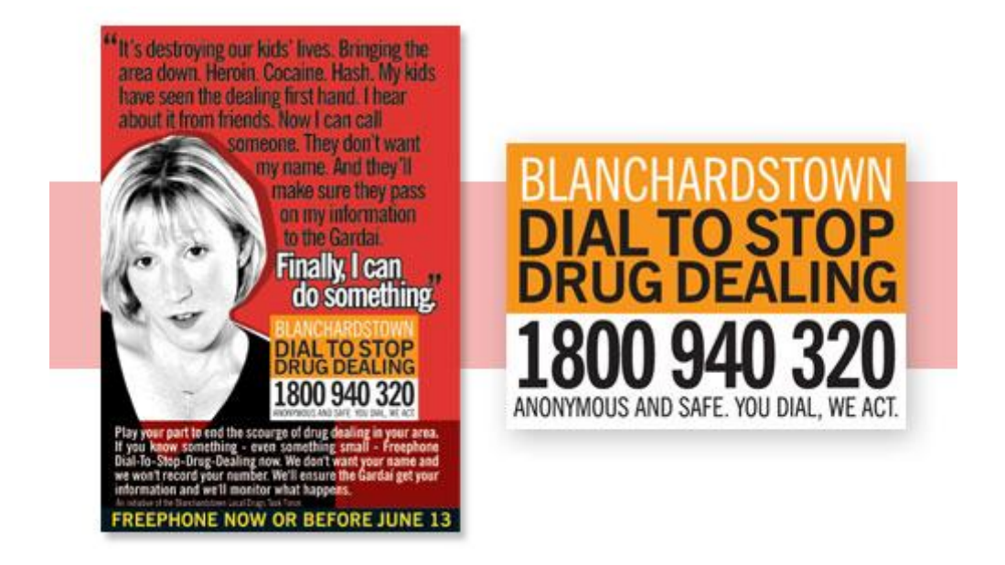
Figure 3 – School priorities 2: Anti-drugs poster in Newtown Community School