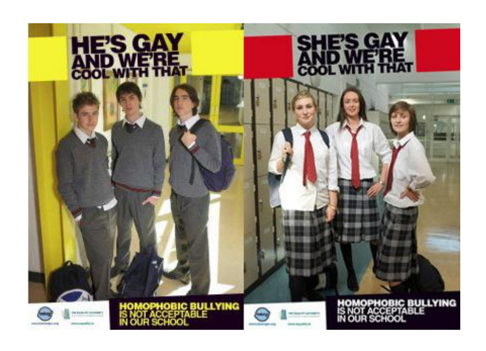
Figure 2 – School priorities 1: Antigay bullying posters hanging at Oaktree College. These were added as a result of the 'Anna Project' realised by an international student