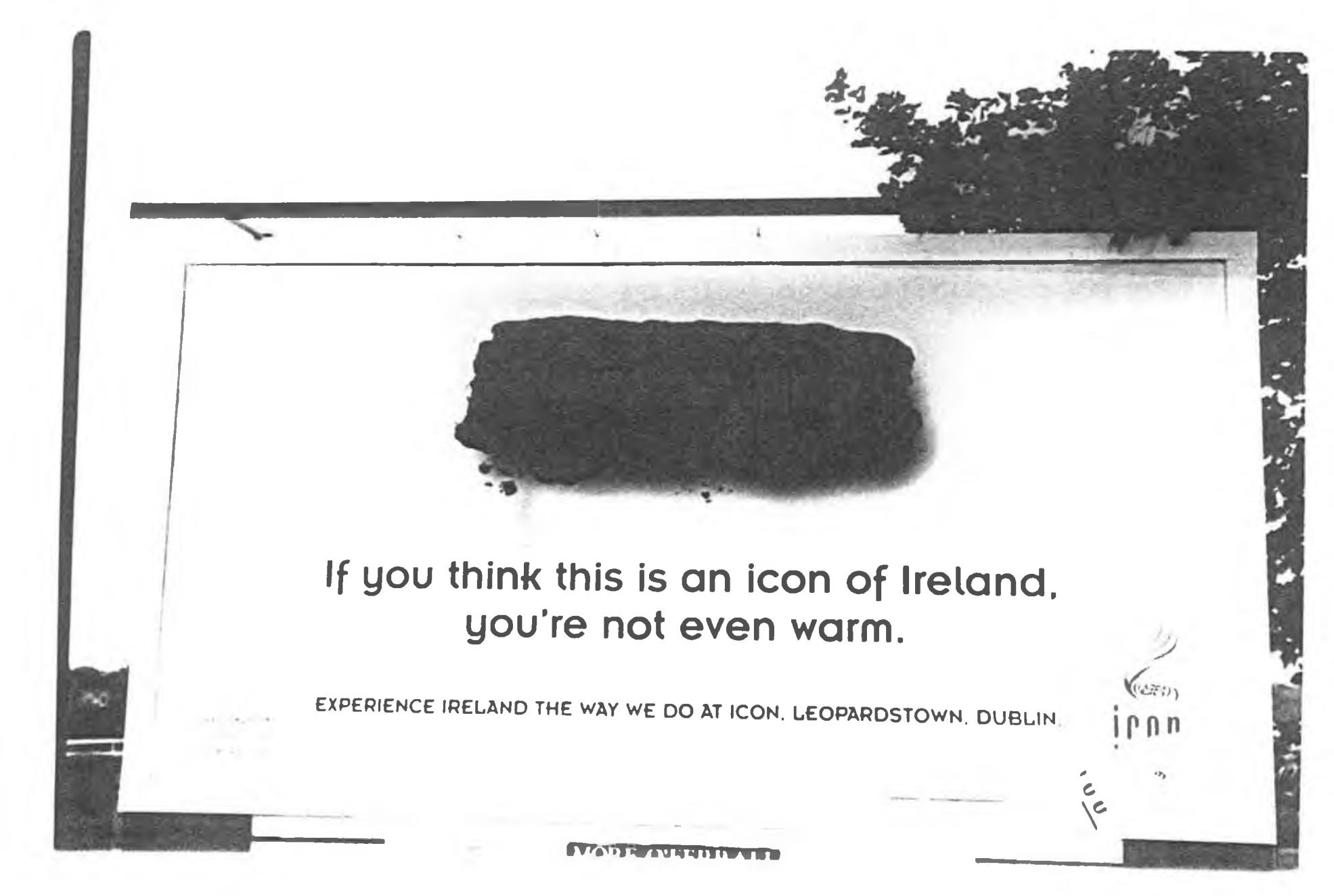
6. A luring device- what is the alternate icon?