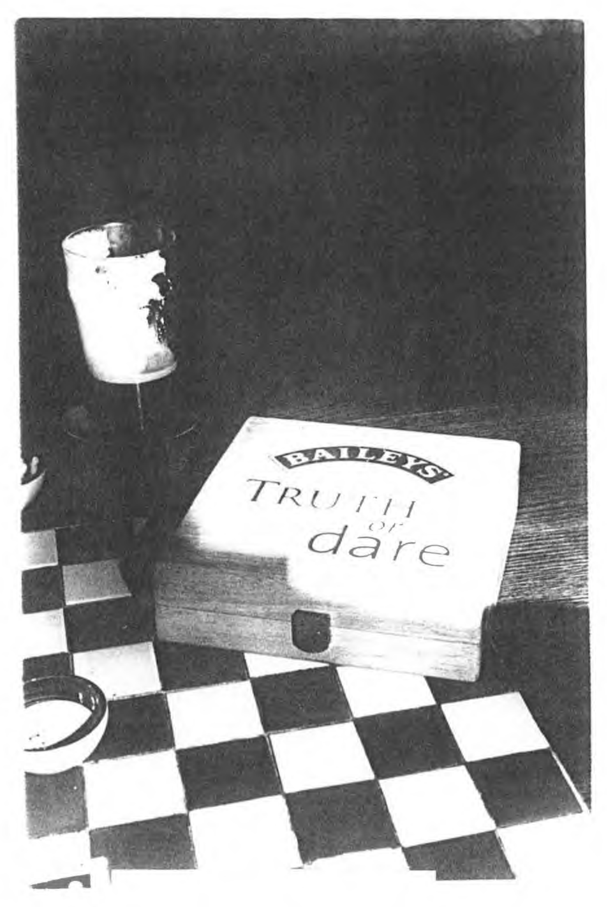
4. Chess/draughts board inlaid on pub table. 'Do they dare to tell us the truth?'.