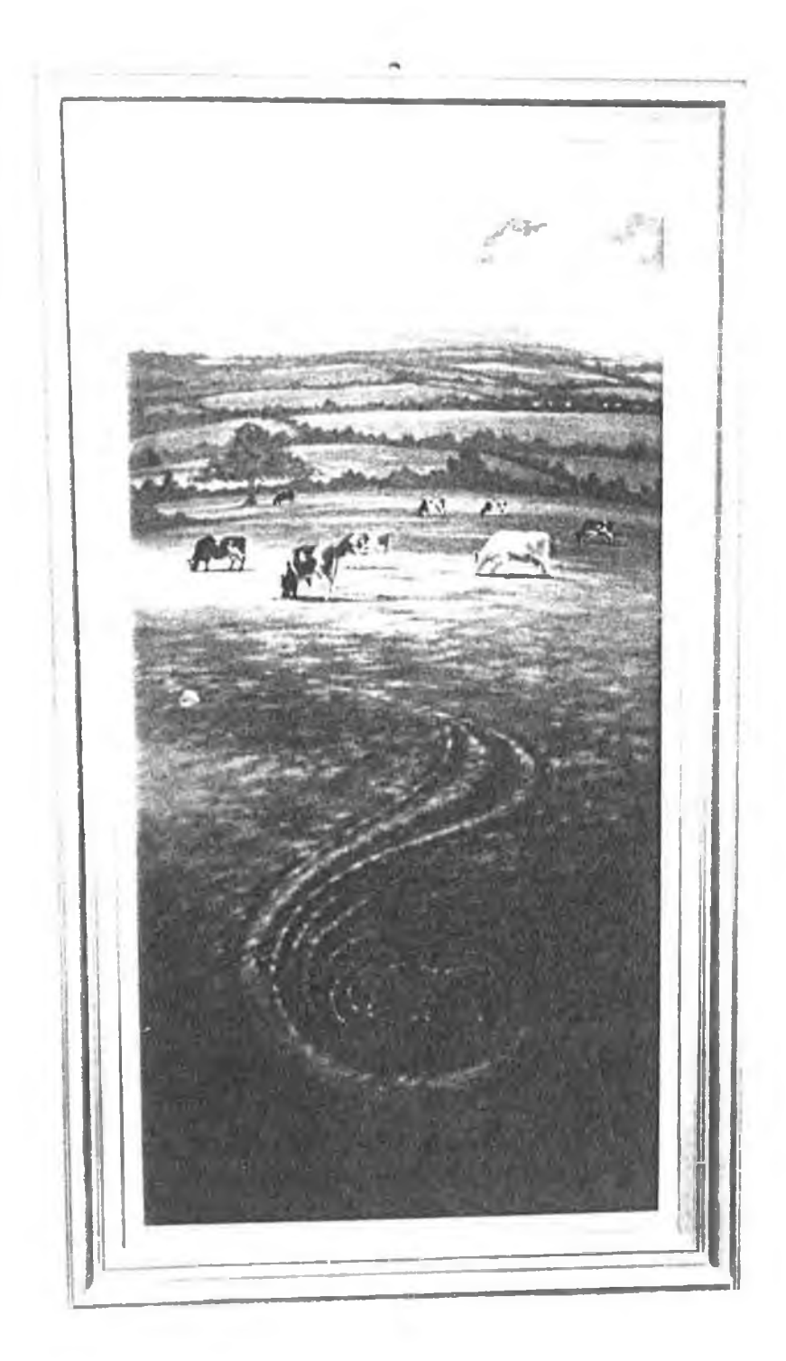
5. Baileys- part of the Irish countryside?!!