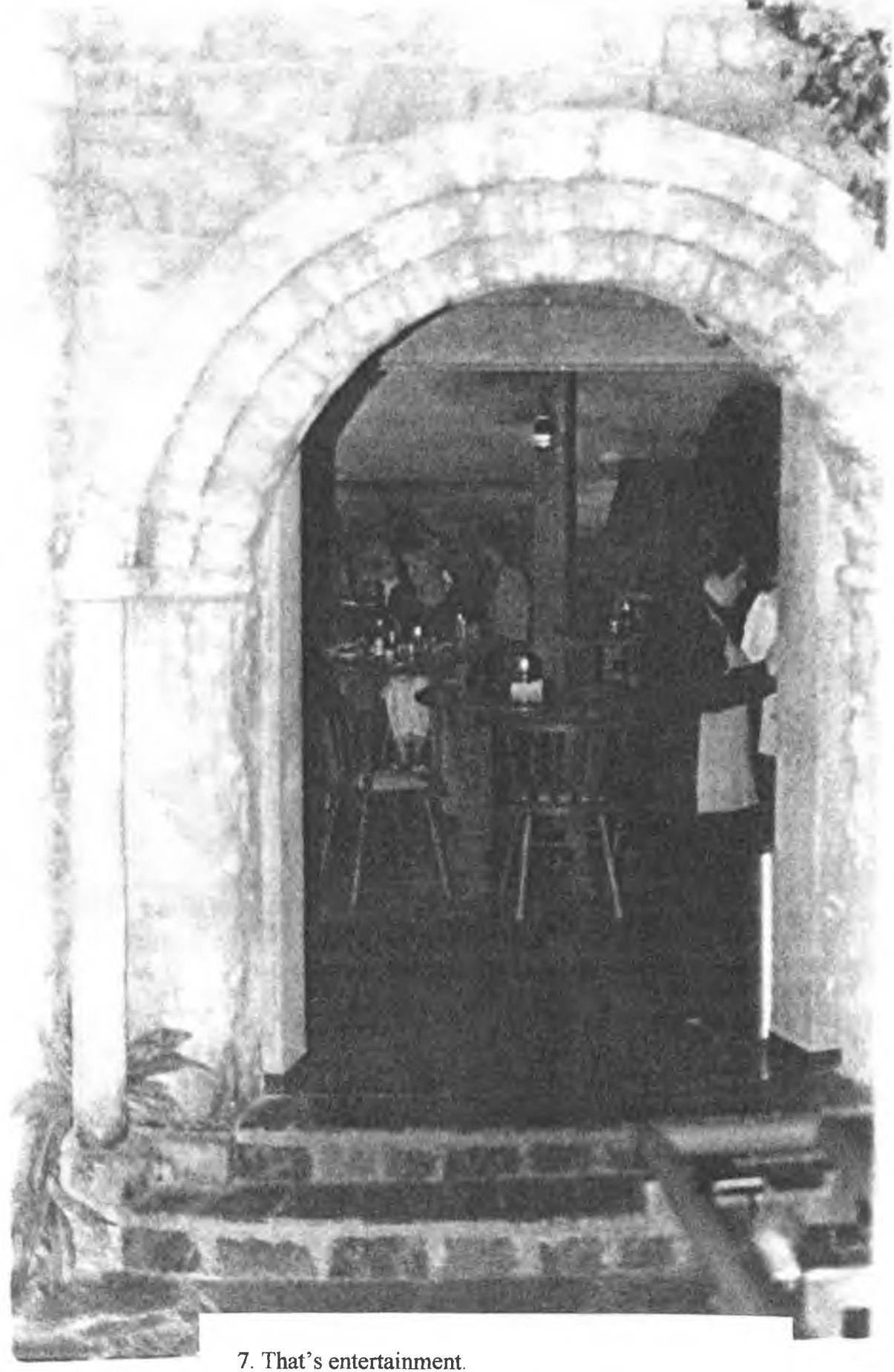
7. That's entertainment. Enjoying a meal in a medieval environment with A holographic background to the Cliffs of Moher.