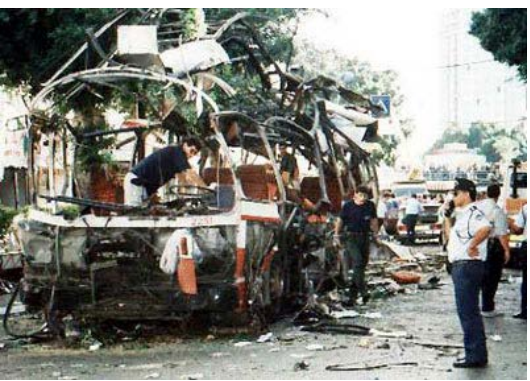
Aftermath of a bus bombing – following rejection of a peace offer, the Palestinians waged a terror campaign against Israeli civilians.

Woman with grenade during Israel's War of Independence. The new state of Israel was rejected by the Arab states around it and had to fight for its survival. The new Israeli army was citizens' army of men and women committed to the survival of the Jewish people.