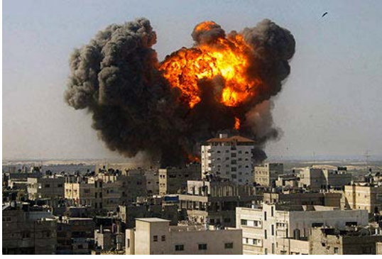
Air strike on Gaza. Part of a three week long assault that left 1,400 Palestinians and 13 Israelis dead.

Shatila Refugee Camp, Beirut, Lebanon. Following the Israeli invasion of Lebanon, Israeli forces introduced their Christian Lebanese allies into the Palestinian refugee camps of Sabra and Shatila. Under the gaze of Israeli soldiers an estimated 1,700 civilians were murdered over three days.