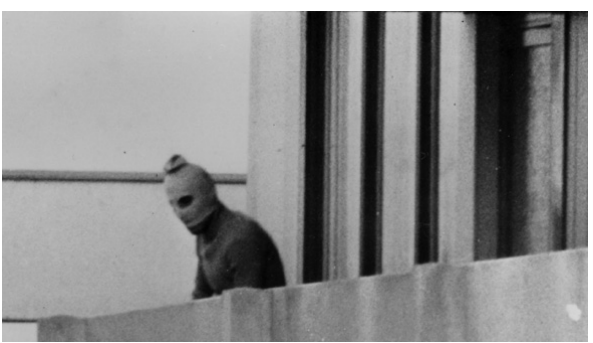
Terrorist at the Munich Olympics. Those opposed to peace continued to launch wars and terrorist attacks upon Israeli civilians.