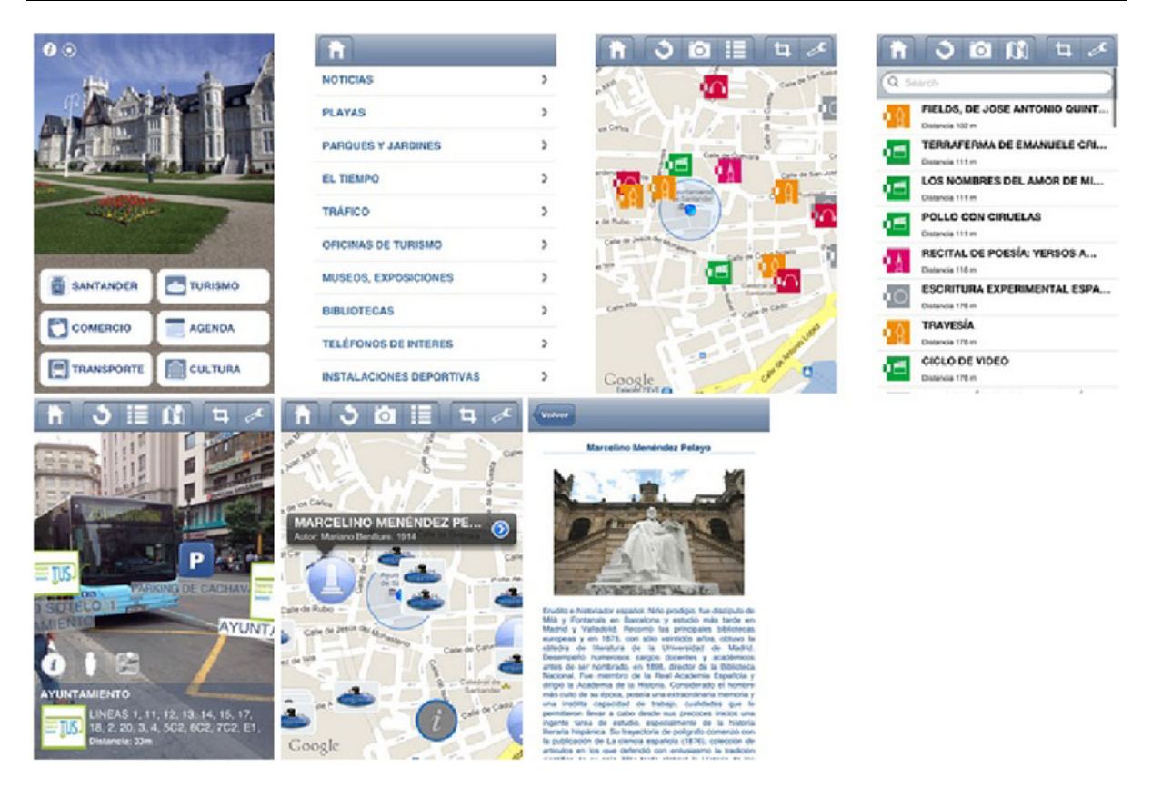
Fig. 2 SmartSantanderRA augmented reality app. Source http://www.smartsantander.eu/index.php/blog/item/174-smartsantanderra-santander-augmented-reality-application?template=retro

and forecast, public buses information and bike-rental service<sup>4</sup> (see Fig. 2).