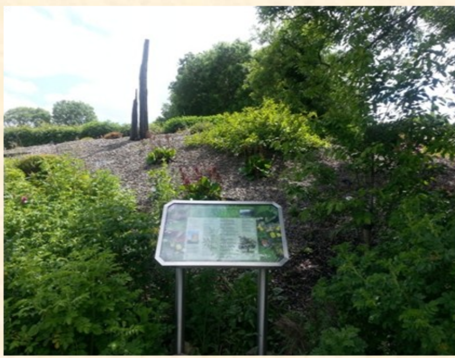
Information panel at The Old Bog Road