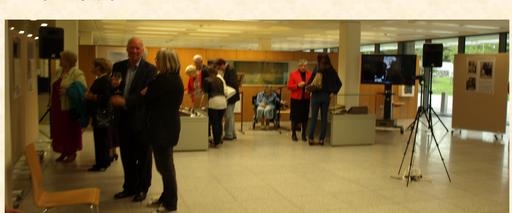
Launch of exhibition