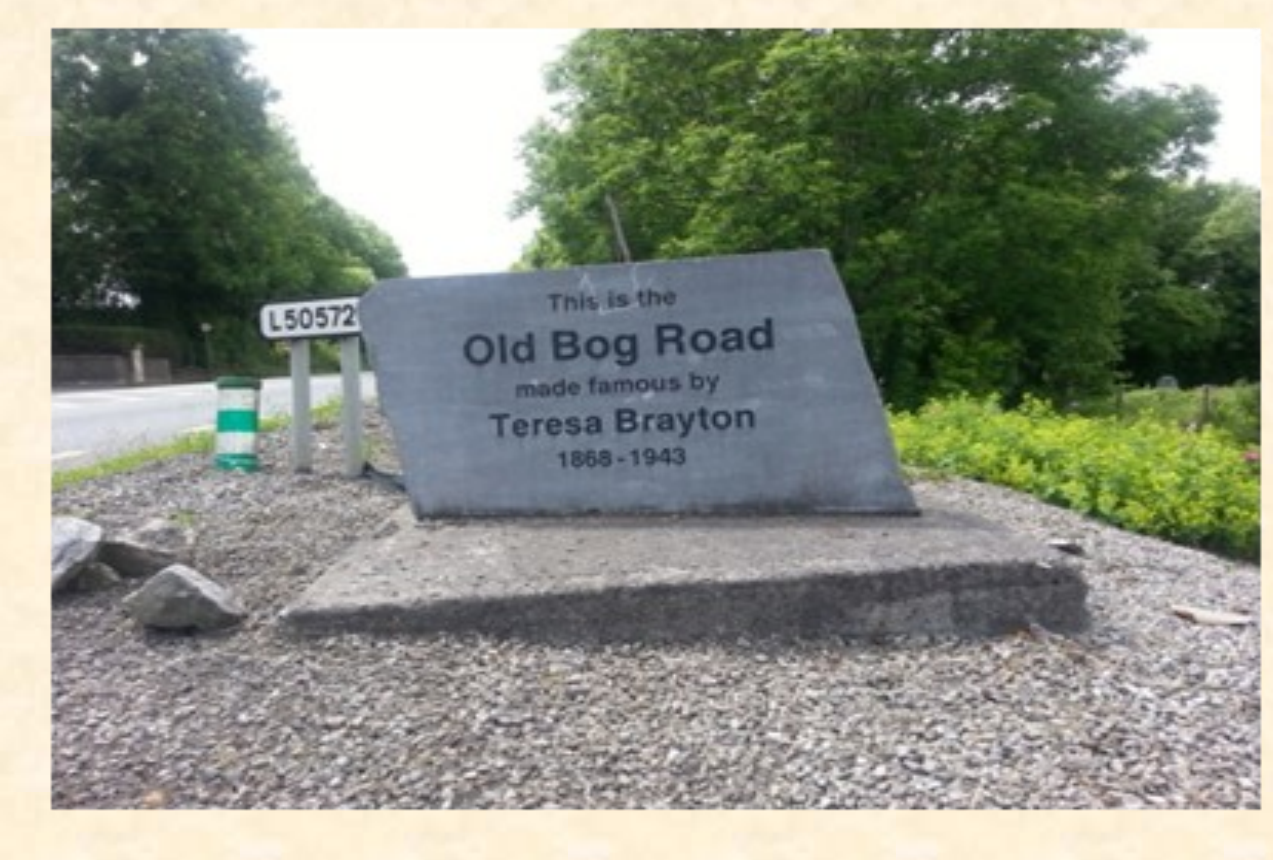
Entrance to Old Bog Road