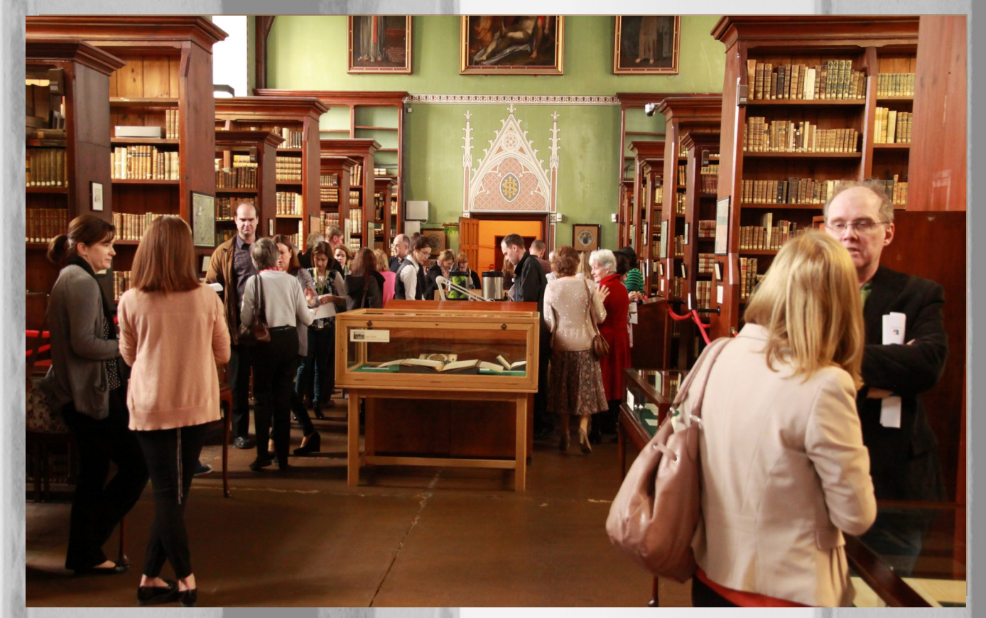
Heritage Week and Culture Night tours

The Russell Library houses the historical collections of St Patrick's College, Maynooth. The College was founded in 1795 as a seminary for the education of Irish priests. The reading room was designed by British architect and designer A. W. N. Pugin (1812-1852) and is open to researchers, scholars and the public by appointment. The rich and diverse collection of material and unique setting offers many opportunities for regional, national and international collaborative projects.