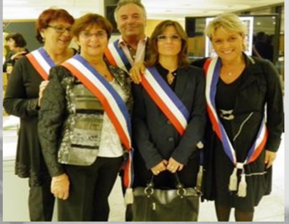
Delegates from Canet-en-Rousillon

As part of their annual pilgrimage to Ireland, St John of God Healthcare, Australia visits the Russell Library to view the