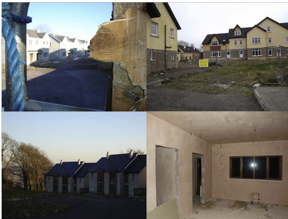
Fig. 1. Examples of 'ghost estates'.

While the property market was still booming unfinished construction sites were comprehensible within the dominant Celtic Tiger narrative as developments that were yet to be completed and occupied. For most people, they did not constitute a worrying sight,