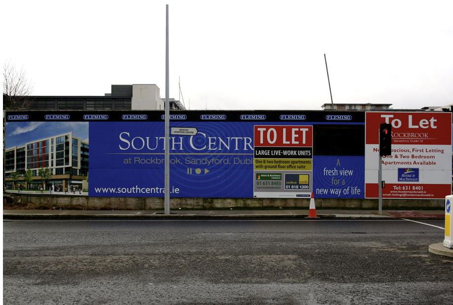
Fig. 3. A fresh view of life: Hoardings around unfinished developments, Sandyford, Dublin 2009.

'A fresh view for a new way of life'... The jaunty advertising slogan of this particular development company has an unintentionally ironic tone: the fact is, for a considerable number of people around the country, living alongside unfinished developments has indeed become a new way of life... One completed apartment block overlooks the shell of another, which has an immense trompe loeil-type piece of fabric covering two sides of it, giving the illusion from a distance that the place is populated with couples on balconies taking in the view, or sitting outside for a bit of al fresco dining (Boland, 2009)