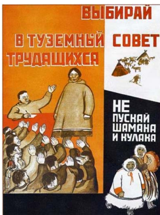
Plate 3.6. A Soviet poster. ‘Elect workers in the Tribal Soviet. Don’t let shamans and kulaks go in’.