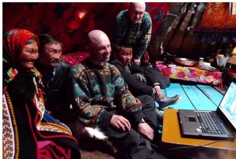
Plate 3.3 Missionaries show the latest world news in the tundra. The Polar Ural tundra, 2011.

The Nenets reveal a new imaginary geography and increasingly widen their cognitive map; in the terms of Frederic Jameson, they enter ‘postmodern hyperspace’ (Jameson 1991:43). Newly arrived Evangelical missionaries also are involved in such processes of widening Nenets geographical imagination, contributing to the development of ‘imagined nomadism’.