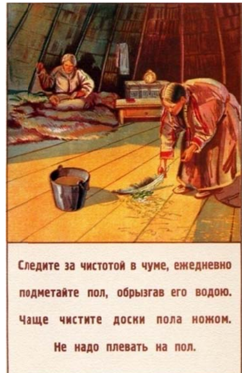
Plate 3.4 Soviet poster. 'Keep cleanliness in a chum , sweep floors daily, sprinkling them with water. Frequently clean battens with a knife. Don't spit on floor.'

'50 Nenets [from Novaia Zemlia] study at secondary school... Women deliver not in chums , but in district hospitals. Nenets listen to radio. Those who did not have their written language nowadays read books in their native language. There are more Nenets teachers, poets, students... and social activists each year. Novaia Zemlia is not a distant outskirts anymore' (cited in Zelenin 1938:34).