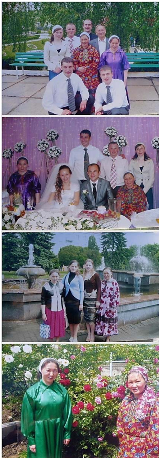
Plate 8.1 From a tundra photo album. Pictures taken by tundra Polar Ural Nenets during their trips to Ukrainian Evangelical communities.

Such religious tourism trips are of great symbolic value and prestige among converted Nenets. They carefully preserved the memory, organizing photo albums and producing narratives about new places and travel experiences. In every Baptist chum or house I visited in the Polar Urals, I was proudly presented such carefully organized photo albums, capturing every moment of these journeys.