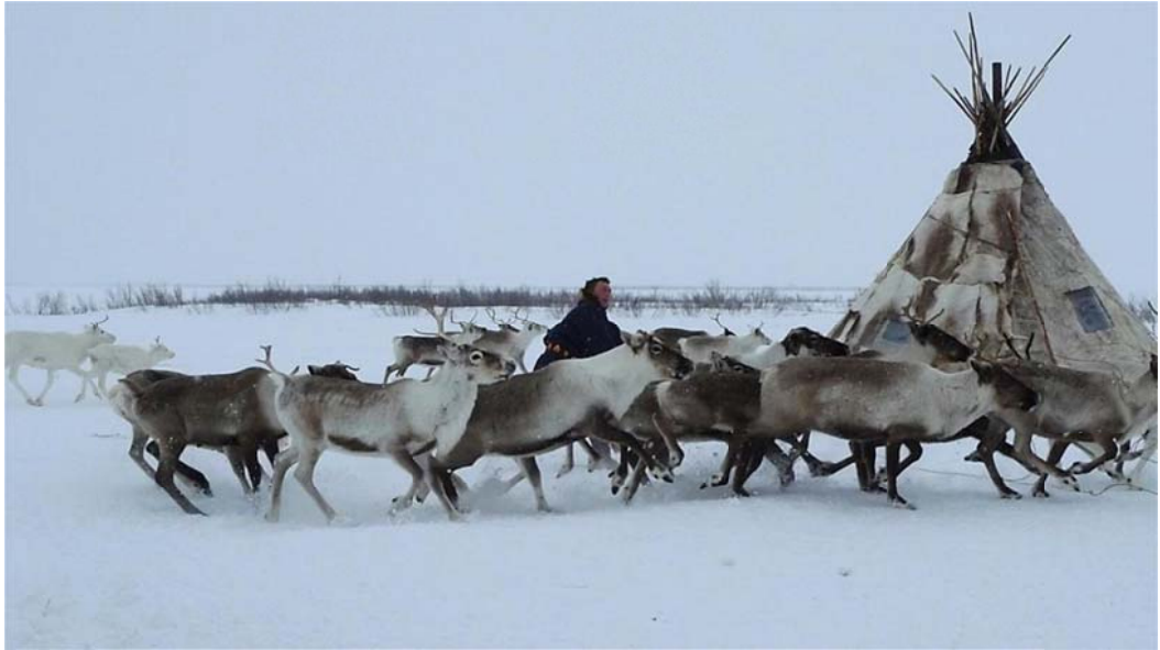
Plate 1.5 Nenets chum. Baidarata tundra, 2011.