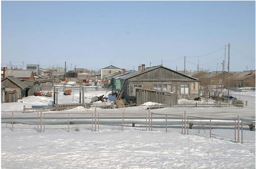
Plate 1.15 Beloyarsk village. Priural'skii district of Yamal-Nenets Autonomous Okrug. 2008

Polar Urals (both nomadic and sedentary) settle on rivers banks for fishing – the practice is called ‘to sit on sands’ ( sidet’ na peskakh ) (for more on pendulum temporality of sedentary and nomadic patterns of Nenets lives see Volzhanina 2013). Therefore ‘the Nenets on sands’ are often referred to as semi-nomadic.