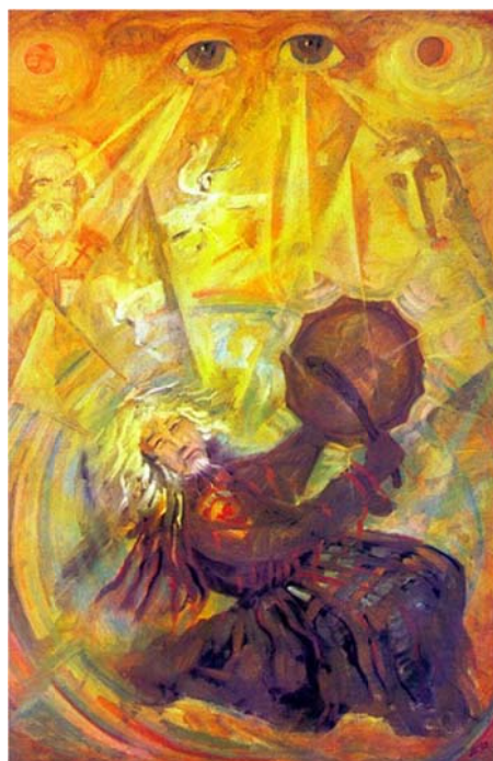
Plate 2.8 Leonid Lar. ‘Num’s eyes’, 1992.

artist, ethnographer, and sometimes is called shaman. By his works and paintings he constructs the idea of a unified and structured Nenets religion, with its pantheon, hierarchized system of shamans and spirits, etc. (Lar 1994; 1998; 2004); he contextualizes ‘Nenets religion’ within modern ecological discourse (Lar & Vanuito 2001). Being close to neo-shamanic international trends, he promotes the idea of Nenets shamanism as the main sphere of religious life of the Nenets.