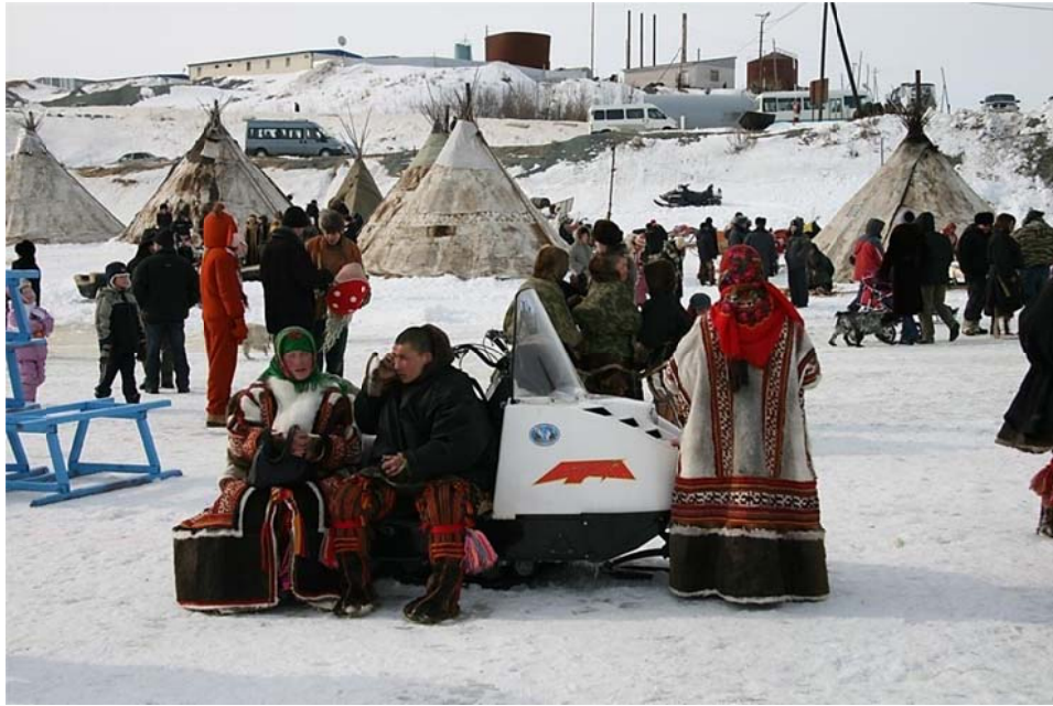
Plate 1.12 Reindeer Herder's Day in Aksarka, 2008.