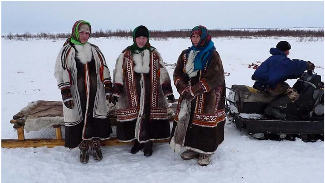
Plate 1.3 The Polar Ural Nenets. Baidarata tundra 2011.