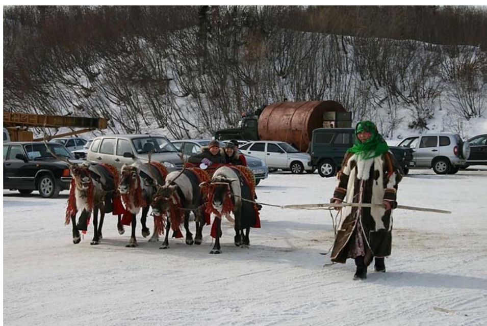
Plate 1.11 Tundra Nenets visit a settlement on Reindeer Herder's Day. Aksarka village, 2008.