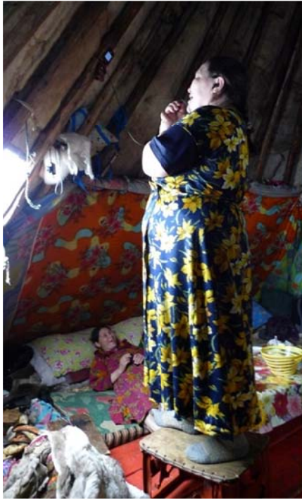
Plate 3.1 A mobile phone call in the Baidarata tundra. 2011.