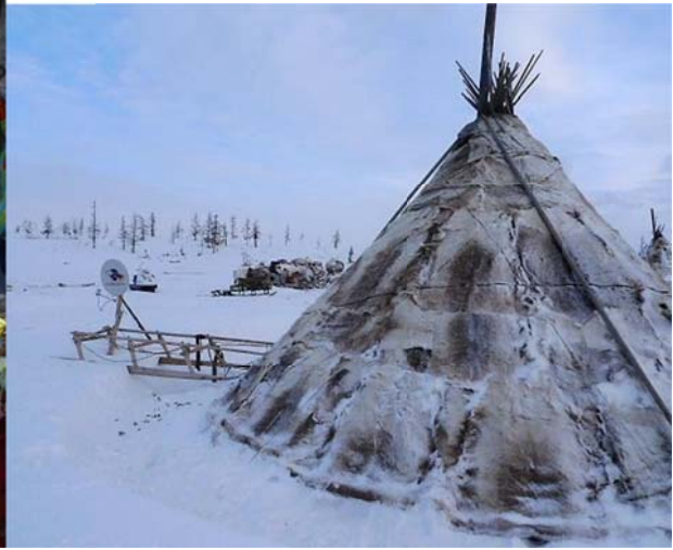
Plate 3.2 Satellite dish in the Salemal tundra (Southern Yamal). 2011.

The Nenets reveal a new imaginary geography and increasingly widen their cognitive map; in the terms of Frederic Jameson, they enter ‘postmodern hyperspace’ (Jameson 1991:43). Newly arrived Evangelical missionaries also are involved in such processes of widening Nenets geographical imagination, contributing to the development of ‘imagined nomadism’.