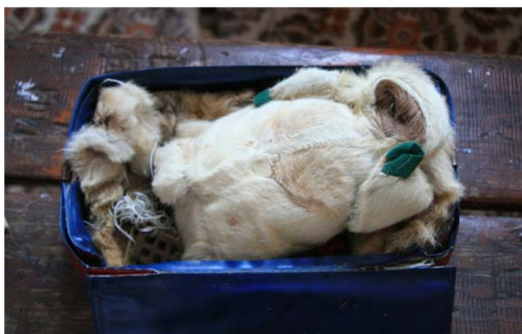
Plate 6.2 Nytarma in a ‘bed’ made of an ambulance box. Baidarata tundra, 2008