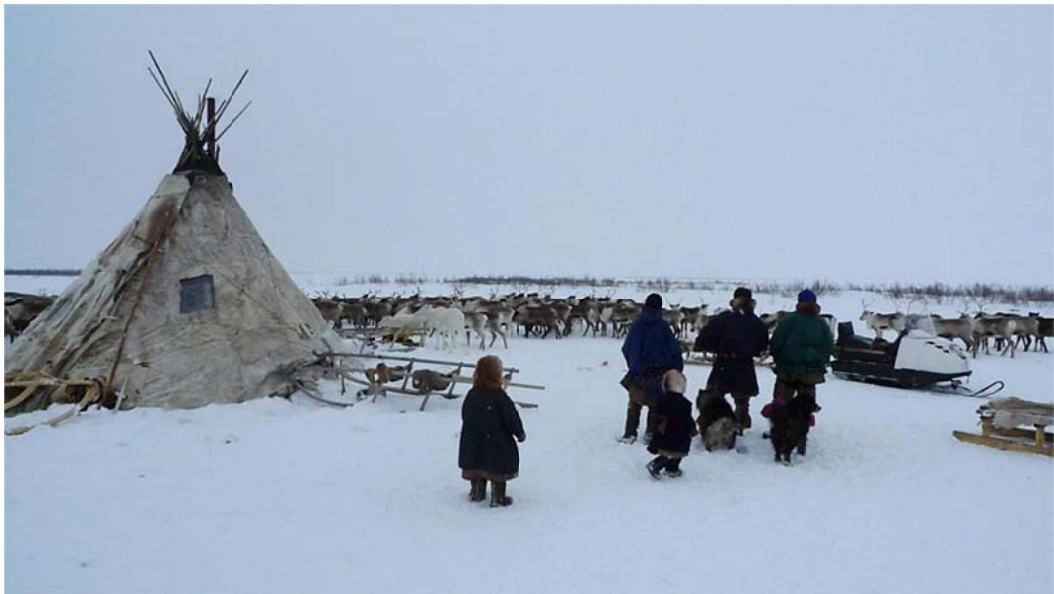
Plate 1.1 A Nenets campsite. Baidarata tundra, 2011.

The aim of this dissertation is to answer the primary question: why do those brave defenders of their ‘traditional knowledge’ so eagerly embrace Evangelical missionary initiatives nowadays? Why do the Nenets opt for one of the religions on the market over another, choosing as a result the most fundamentalist Baptist movement, which claims the most radical changes over the convert’s life? The dissertation also aims to explore how, through conversion experience and daily encounters with the missionaries, in a local context where anti-conversion activism and anti-sectarian discourse are prevalent, Nenets negotiate their indigenous identities, ‘native tradition’ and ‘culture’, and what response they elaborate in the situation of broken authenticity and cultural continuity.