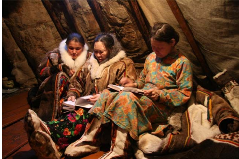
Plate 5.4 Sunday gathering in a chum. Nenets women read the Bible. Baidarata tundra, 2008.