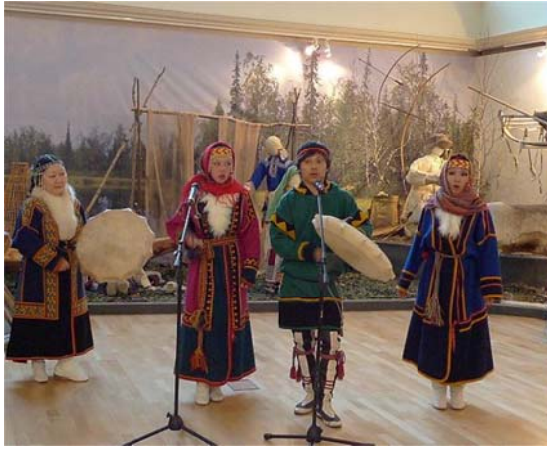
Plate 2.10 The performance with shaman drums. The Nenets folklore group Vy' sei' . Salekhard, 2011.