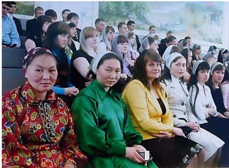
Plate 5.5 Two Nenets women in their traditional dresses among Russian Brotherhood ‘sisters’.