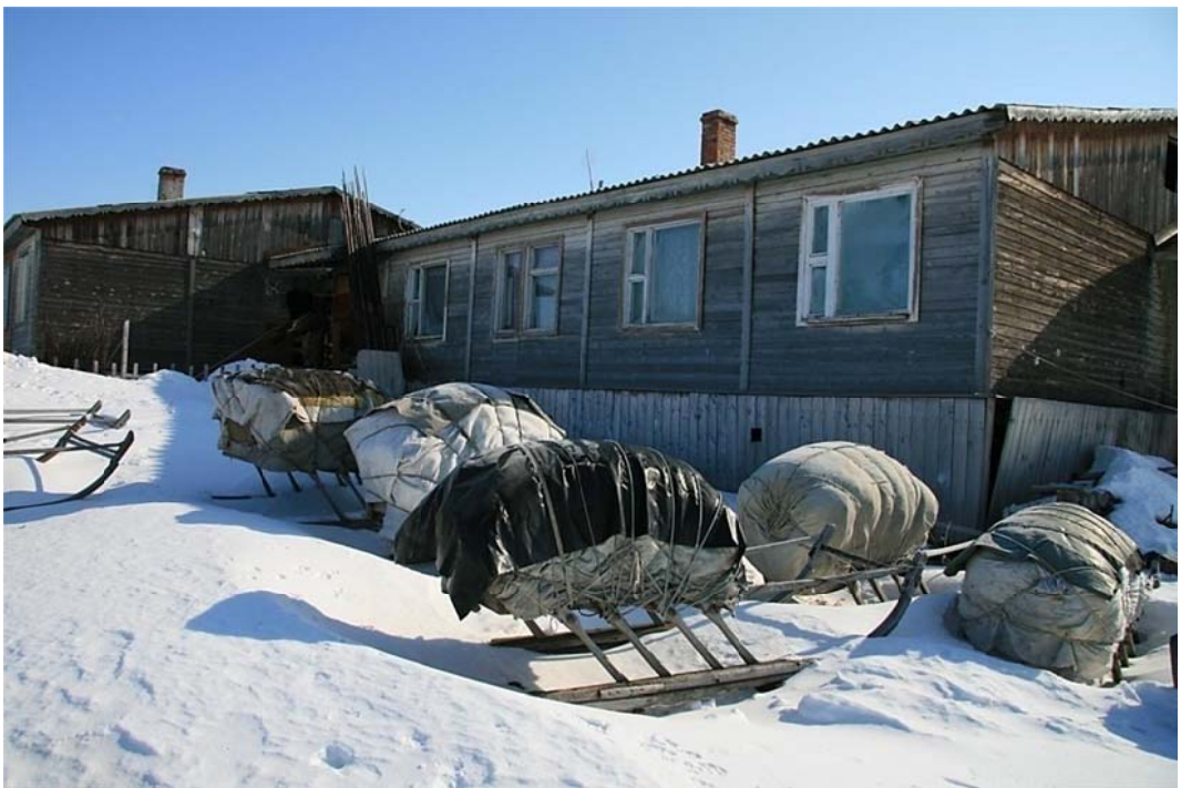
Plate 1.16 Typical yard in Beloyarsk. Tundra household is settled (possibly temporary): disassembled chum and household effects are packed in sleds and kept near the house. 2008.