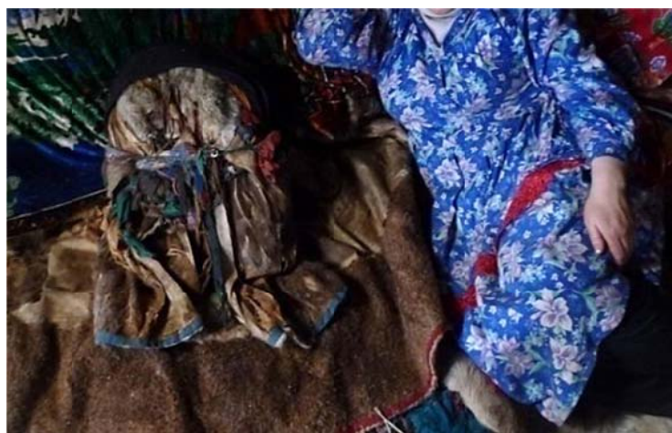
Plate 6.1 Miad' pukhutsia . Salemal tundra 2011.

khekhe ). These are typically wooden, stone, or occasionally metal anthropomorphic or zoomorphic images. The Nenets keep some of them on specially designed sacred sites in the tundra. Miad' khekhe (from N.: mia' –home, chum ) are kept in chums or nearby outside, in specially made sacred sledges (N.: khe-khe' khan ). Some of miad' khekhe live in chums and are treated as living persons ( miad' pukhutsia – ‘a chum’s old woman’, a wooden doll, dressed in multiple female coats, believed to be a female master of a chum; nytarma and sidriang – images of male deceased relatives). Nenets can talk to them, feed them and make clothes for them. Up to the present, almost every Nenets and Khanty nomadic family (mostly among Siberian groups) carefully preserve their ancestral khekhe and follow detailed and multiple regulations and rituals surrounding this sphere. (Islavin 1847:116; Khomich 1976; 1977; Kostikov 1930a; Prokof'eva 1953; Shrenk 1855:358-62; Veniamin 1855:58-9).