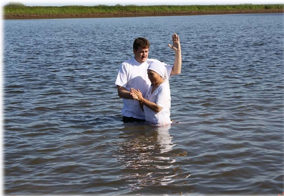
Plate 1.7 Christening in Ob’ River.

When all these Charismatics and Pentecostals, and these Baptists arrived, one pulled us over to their side, the other pulled us over to their side. And we were like these [Holy Spirit] tongues – we were between heaven and earth. Cannot rise, nor go down. So we dangled [ boltalis ] like that. We didn’t know who and what to believe in.