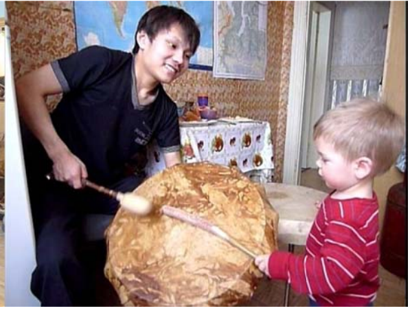
Plate 2.11 A young Nenets man, promoter of shamanism, teaches my 18-month-old son to play a shaman drum. Salekhard, 2011.