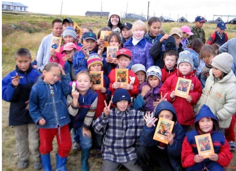
Plate 2.7 Nenets children holding the Gospel translated into Nenets.

On the emerging religious spectrum there was one missionary church that particularly distinguished itself in the Arctic mission. The Baptist Brotherhood of the International Council of the Churches of Evangelical Christians Baptists (ICCECB) became the most successful in its missionary activity among the indigenous people, particularly amongst the tundra Nenets. With its mission centre in Vorkuta (Komi Republic), equipped with modern vehicles, satellite communication, and most importantly, with a well organized religious network throughout post-Soviet space, the Brotherhood spread its influence all over Yamal, the Polar Ural and European tundra regions.