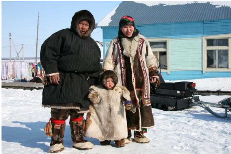
Plate 1.19 A Nenets family visiting a village, 2008.

meanings in terms of what they already know, assimilate new ideas into preexisting frameworks, Sahlins argues that people give significance to new objects and ideas from the existing understanding of the cultural order (1985:vii). In such an ideational framework, historical process is understood as ‘functional revaluation of the categories’, in which the latter stretch and acquire new functional values, but always as a logical extension of traditional conceptions (1985:ix, 138).