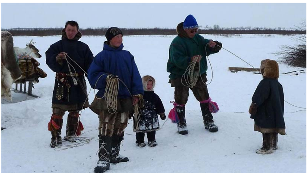
Plate 1.2 The Polar Ural Nenets. Baidarata tundra, 2011.