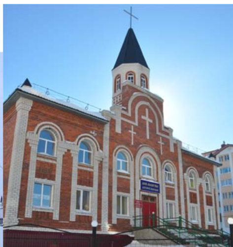
Plate 2.2 Prayer house of Baptist Union (RUECB) in Salekhard.