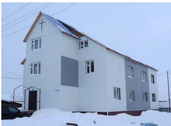
Plate 2.1 Prayer house of Evangelical Christians Blagaia Vest' in Salekhard.