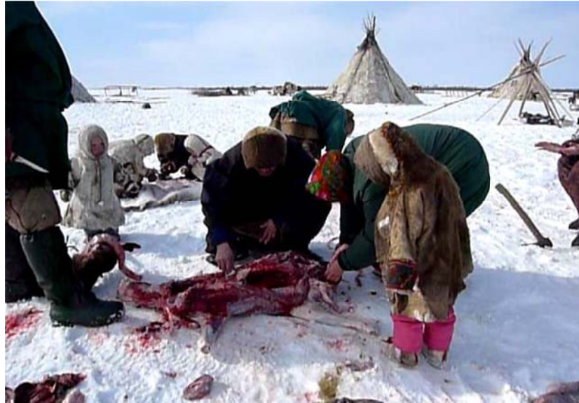
Plate 6.3 Daïabad – eating raw meat and blood of freshly slaughtered reindeer. Baidarata tundra, 2011.

Meanwhile, the use of the blood and meat of strangled animals for food is forbidden in the Bible; the prohibition is mentioned several times in both the Old and New Testament (Lev 17:10-12; Acts 15:20). Therefore, the traditional Nenets practice of consuming blood is excluded from accepted Christian behaviour. Converted Nenets often stopped using blood for food and changed their way of killing animals.