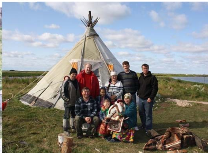
Plate 2.6 Missionary trip to the tundra Nenets.