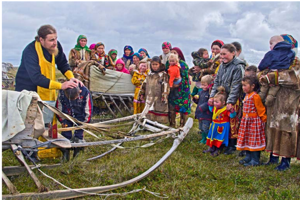
Plate 1.6. An Orthodox priest baptizing native children in the Polar Ural tundra.