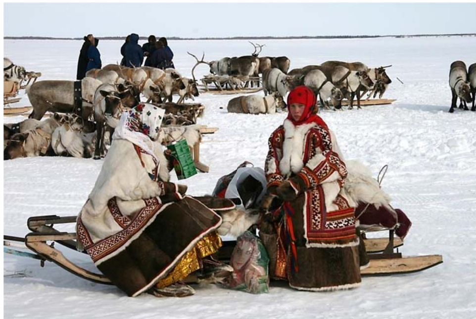
Plate 1.13 The Polar Ural Nenets. Aksarka, 2008.