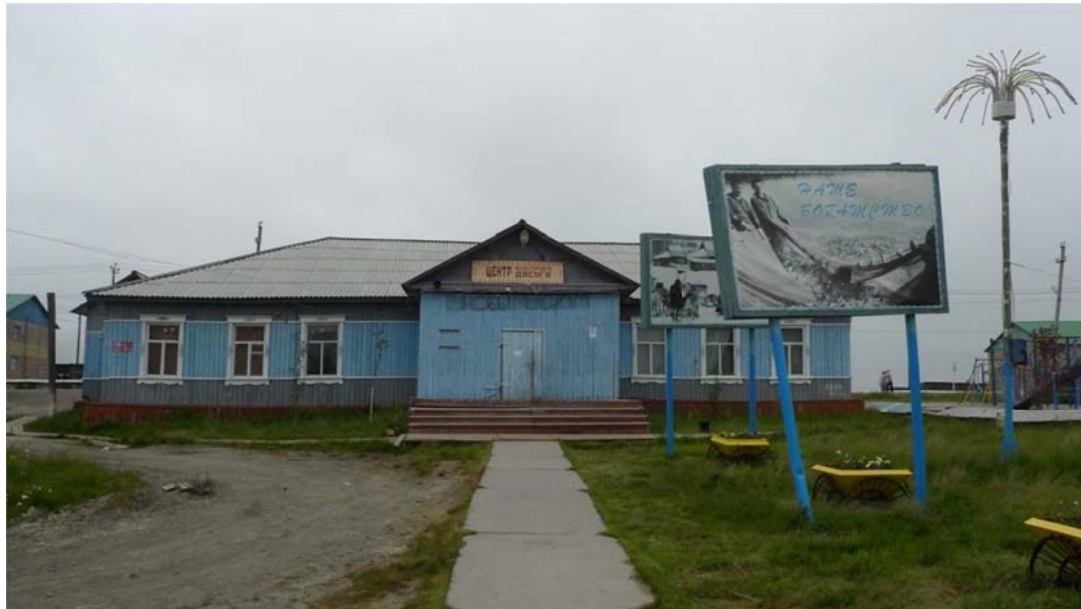
Plate 1.18 TSentr Kul'turnogo Dosuga – local club in Beloyarsk, 2011.