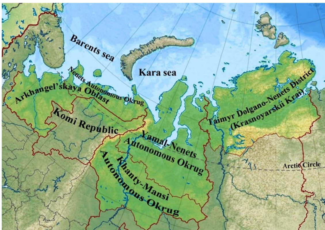
Map 1.1 The breadth of the traditional habitation of the Nenets people.

The Nenets people 7 belong to the group of the so called ‘indigenous less-numerous peoples of the North of the Russian Federation’ ( korennyye malochislennyye narody severa Rossiiskoi Federatsii ) (one of 44 listed in this group). According to the All-Russian census in 2010, the Nenets number 44,640, with 78% classified as rural population. Historically they inhabit the tundra of the European North, North-Western-Siberia, and the Taimyr Peninsula, with smaller groups living in taiga of the Polar Urals and the territory between the Ob’ and Taz rivers. The largest groups of Nenets live in the Yamal-Nenets Autonomous Okrug (29,700 Nenets, comprising 5.9% of total population) and in the Nenets Autonomous Okrug (7,500, comprising 18.6% of total population), while smaller groups are dispersed in the Taimyr Dolgano-Nenets district of Krasnoyarski Krai, the Khanty-Mansi Autonomous Okrug, and the Komi Republic. 8