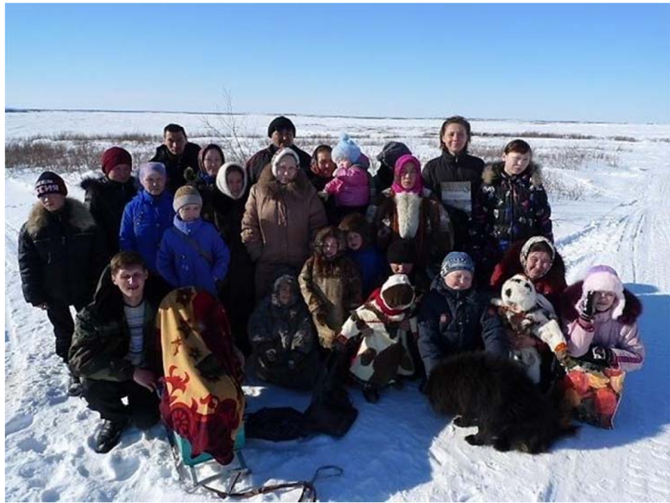
Plate 1.8 Baptist community in Beloyarsk. 2011.