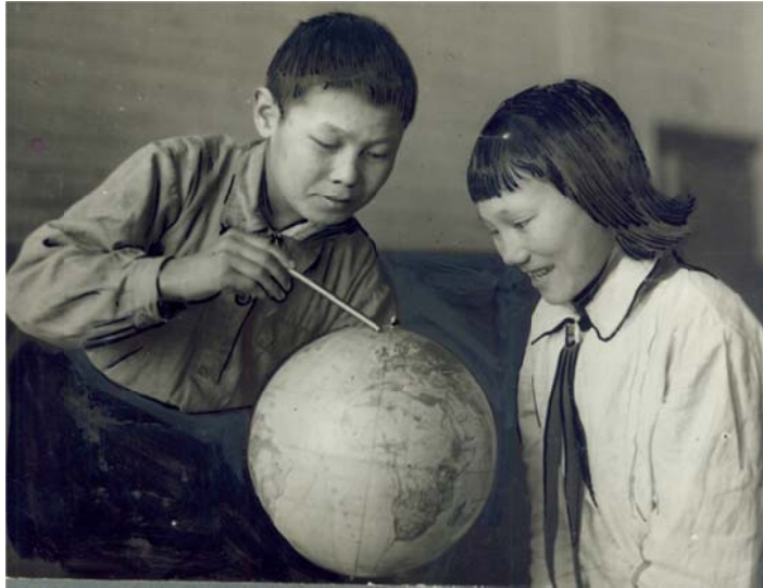
Plate 3.5 Nenets children at Tel'visochnaia school (Nenets National Okrug).

Apart from that, from the 1950s industrial development of the northern territories became a priority economy, changing the environment, the social landscape and people's lives in the Russian Arctic. As Nikolai Vakhtin points out, often industrial enterprises 'behaved like a victorious army in an occupied town', whereas some Northern minorities 'were turned into mere food and transport suppliers' for giant industrial companies (Vakhtin 1994: 49). Besides its economic (oil-gas industry as the mainstay for the Russian economy) and ideological dimensions (bringing 'civilisation' to the 'uncivilised' territory [Ventsel 2011:119], industrialization meant a huge influx of incoming population to the Arctic, which dramatically inverted its demographic landscape. To use the words of Art Leete and Aimar Ventsel (2011:9), Soviet industrialization, with the construction of new settlements, a network of infrastructure, and influx of incoming population 'has changed not only the lifestyle of the indigenous people but created a unique polar society where different social and ethnic groups live together, tied to each other through mutual interests. The interdependence of these groups is very intensive and has caused an exchange of ideas, concepts and know-how'.