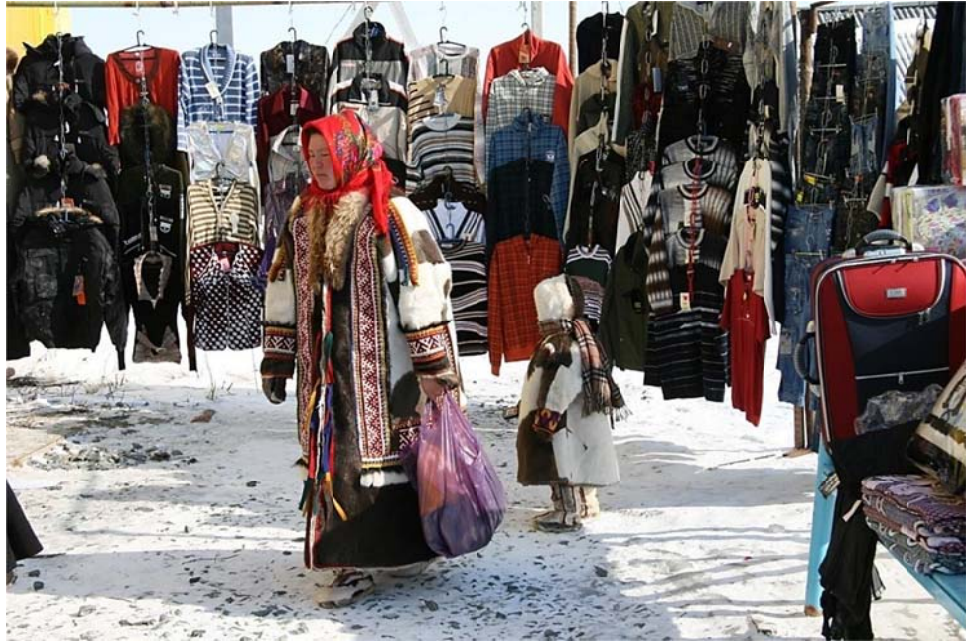
Plate 1.14 A Nenets tundra woman visits clothing market in Aksarka village, 2008.

Another feature is the high rate of sedentary native population in the Priural'skii district. The village of Beloyarsk, established in 1951 as part of the Soviet project of sedentarization of nomadic people, has become one such centre of gravity for tundra native people. In the Beloyarsk rural district the correlation of tundra and sedentary Nenets is 1:4.8 (Volzhanina 2005). One of the biggest issues for sedentary natives is the lack of work places and correspondingly unemployment. Nenets and Khanty living in northern settlements such as Beloyarsk are generally engaged in manual unskilled jobs, such as cleaner, nurse's aid, watchman, or laundress, whereas jobs in local administration, management, school education system, and public health services are mainly occupied by Russians and other incoming population. However, in recent years increasingly more natives have acquired the profession of tutor, teacher, medical assistant, zootechnician, fur farm worker, bootmaker and seamstress (Volzhanina 2005).