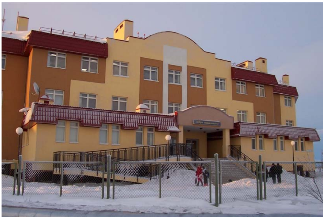
Plate 1.17 New building for residential school is notable on the background of old private houses. Beloyarsk. 2006.