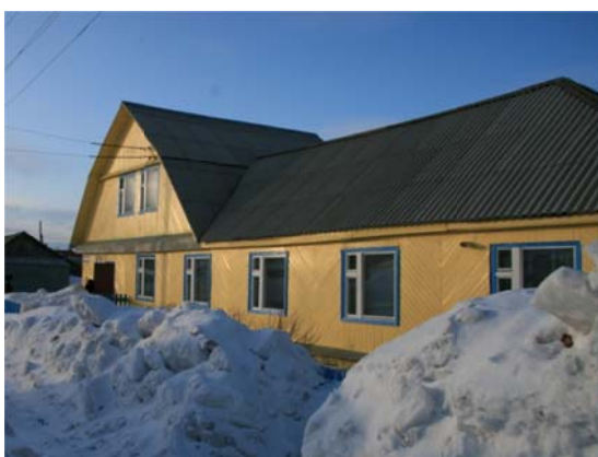
Plate 2.3 Prayer house of the Baptist Brotherhood (ICCECB) in Vorkuta.