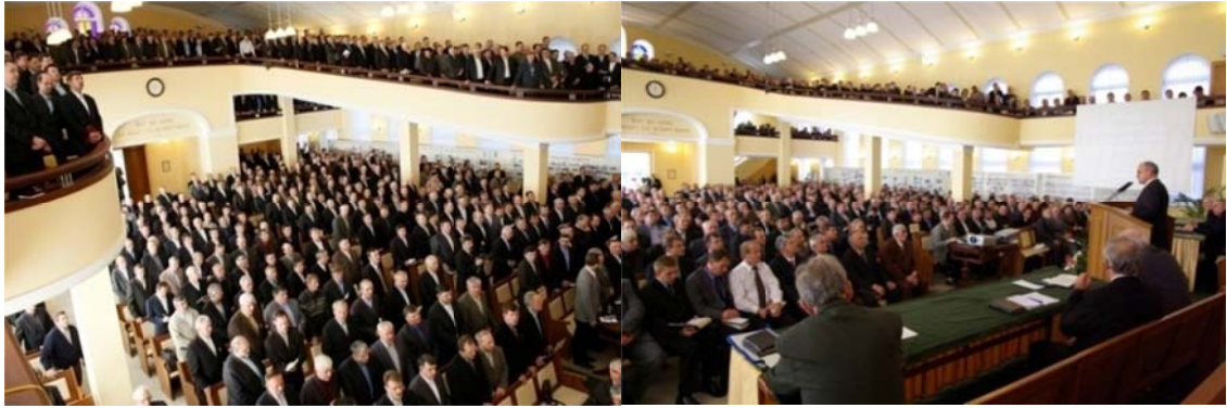
Plate 5.2 Only men on the Congress of churches representatives, International Council of Evangelical Christians-Baptists, Tula 2009.

Even though the unofficial leaders and communicative nodes in the Beloyarsk community were mostly women, official leading positions were held by men. It was only men who were permitted to preach and lead religious sermons and prayers, though there were only three male members in the community. All of them were young (two of them are in their early twenties), unmarried, and in the view of Nenets, far from obtaining any authority within Nenets society, in which the social power is usually delegated to elder men (cf. Brodnev 1950:51 on Soviet struggle against the Nenets practice to nominate elder men as candidates for brigade, kolkhoz and sovkhos leadership positions). However, visiting missionaries tended to involve these three young men in religious leadership, training them in preaching, reading Bible and praying.