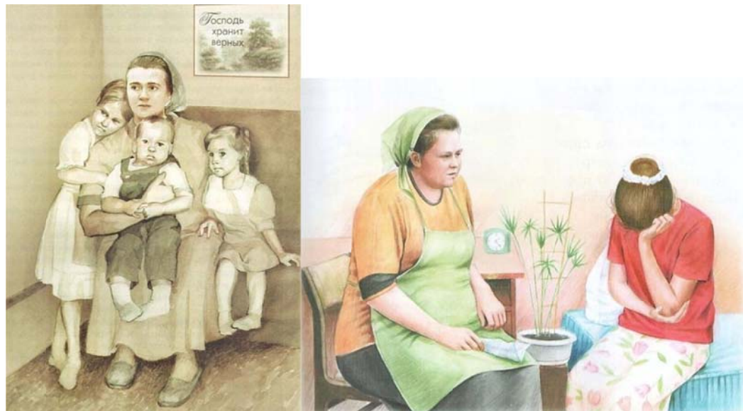
Plate 5.3 Typical images of women in the Brotherhood. Pictures from the children's journal ' Svetil'nik ', published by the Children's Department of the IC EChB.