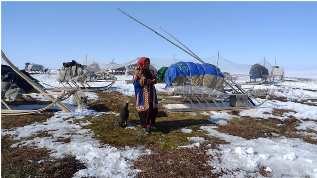
Plate 1.4 A Nenets campsite. Polar Ural tundra, 2011.