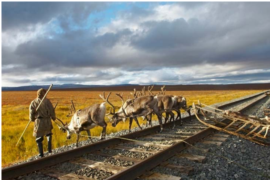
Plate 1.10 A herder crossing a railway in the tundra.

It appears that even the Polar Ural Nenets themselves internalize the image of being non-authentic. A Polar Ural Nenets woman recently settled in Beloyarsk said, ‘Doctors came here the other day, and they did blood tests among the Nenets. And it was revealed that the Nenets do not have pure blood anymore – everything is mixed: Nenets, Khanty, Russians.’