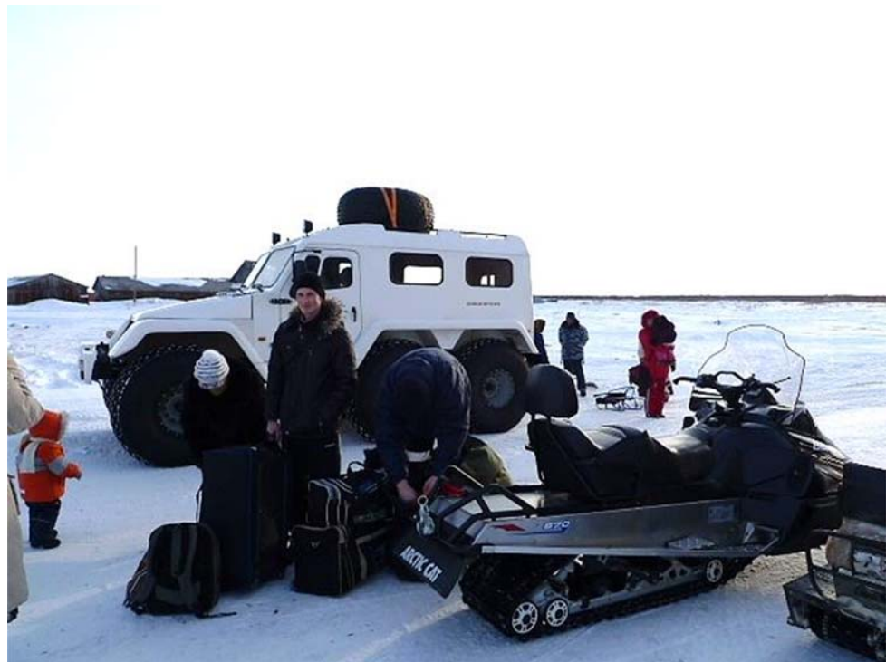
Plate 1.9 Missionary trip to the tundra. Beloyarsk, 2011.

During my fieldwork in Beloyarsk two religious communities existed – Charismatic and Baptist. Both village religious communities were small, about 10 and 20 people respectively, though the rest of the members were dispersed in the vast Yamal, Polar Ural and European tundra regions. Neither of the communities had a permanent pastor, and the intensity of the communities’ religious life pulsed with frequent visits by