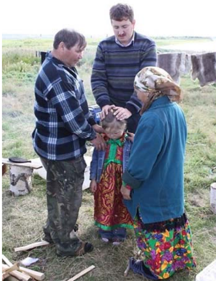
Plate 2.5 Missionary trip to the tundra Nenets.

Many young and full-of-energy 'brothers' and 'sisters' arrived in the tundra for the so called 'youth work' ( molodëzhnoe sluzhenie ). They were not considered missionaries in a proper sense, but rather beginners or probationers who prepared people for upcoming missionary work. Most of them usually arrived during summer time with the aim to organize tundra Christian camps, but there were some young Christian workers who visited Nenets chums (both European and Siberian) more regularly, staying in the tundra and villages for several months. They were usually engaged in Christian education, preaching and reading the Bible, but also helped in household and child minding, taught reading and writing to the illiterate Nenets, as well as provided instructions in hygiene and sanitation. Once, a family of converted tundra Nenets told me a story about a believing sister, who spent several months at their chum teaching them music and singing.