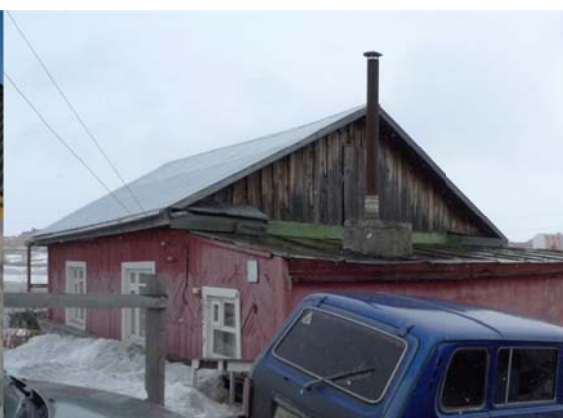
Plate 2.4 Prayer house of the Charismatic community in Salekhard.

At the beginning of the missionary movement the newly organized Protestant movements worked generally in urban spaces, populated mostly by incoming Russians and Ukrainians. However, as some missionaries reported, it was sometimes unexpectedly revealed that beyond the borders of the renovated and well-organized infrastructure of Arctic towns, there was another world of tundra people, who spoke unknown languages, wore strange clothes and worshiped their own gods.