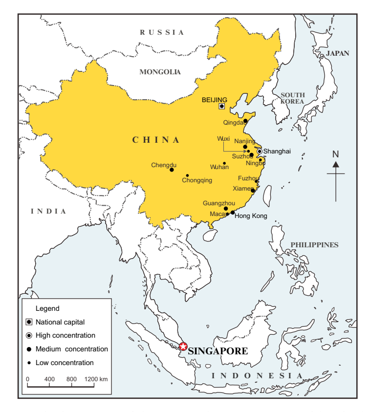
Figure 2. Geographical concentration of Chinese cities with overseas Singaporean clubs as listed on the OSU website. Source: Ho, 2013. Reproduced with permission from NUS Press.