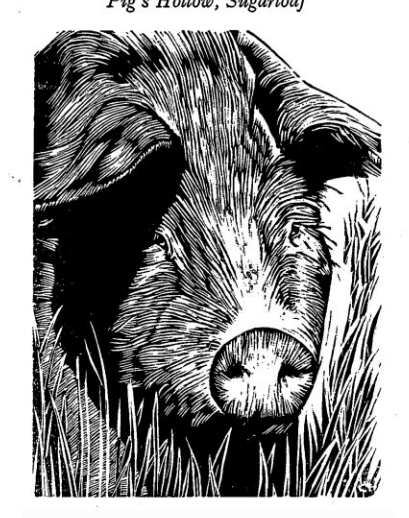
Mist at Dusk Pig's Hollow. Sugarloaf

Maybe it's the breath of the giant pig that lay then rose and moved off down the lea of the hill crump swaying, steam rising as it sets off down snuggery lane or maybe it's the breath light leaves; having pitched up and settled on the slope it shrugs and moves off down the mountain side, as night's grasses spring back.