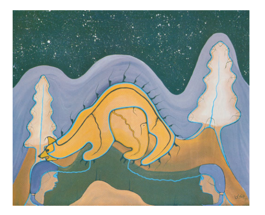
Figure 9 Bear Walk by James Jacko (Southcott 1984).

What strikes me is that airport-goers are being led into an imaginative landscape.