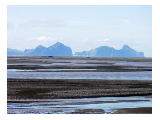
Figure 8 Iceland seascape/Sigur Ros Soundscape.

Karioitahi Beach, Port Waikato, Raglan Harbour... the flight path is familiar, but the novelty of being Wellington-bound never wears off. The contrast between the gentle green folds of farmland and the relentless west coast surf. The early start, gentle motion