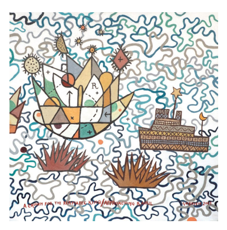
Figure 1 Gregory O'Brien, A crown for the Kermadec King, 2011, acrylic on hardboard.