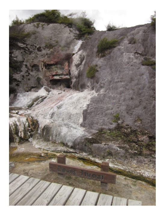
Figure 5 The Devil's Throat.

But the poem that may come is not a description ... not a geo graphia but the product of