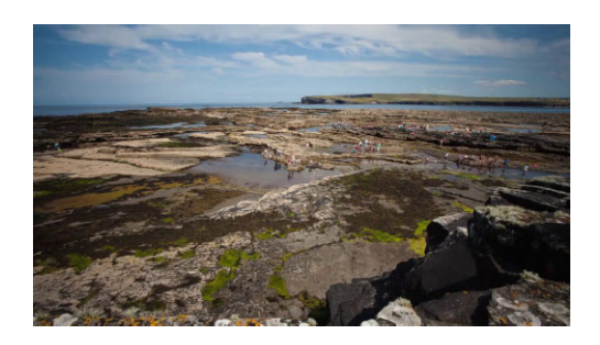
Figure 4 The Pollock Holes, Kilkee.

I have been carrying out research at a number of established swimming spots in Ireland including the 40 Foot in Dublin, the Guillemene near Tramore and the Pollock Holes in Kilkee (Fig. 4): as well as some inland river and lake sites. In each location, the idea of a history of bodies moving in, out, across, up and down that space is central (Gatrell 2013). Each site can be viewed throughout the day or seasons as a succession of movements, fluxes and flows that in turn are shaped by weather, season, tide, mood and inclination. At such sites, a natural community emerges, in which the regular finds a place, the visitor can choose to engage, the lone swimmer can still do their own thing, safe in the knowledge that there are always bodies at rest that may look out for them. Conversations, repeated and ephemeral, emerge in those resting places as bodies are toweled down, pants are put on, enflasked cups of tea are sipped. We leave our clothes in little piles, as if we are leaving off our skin to become more like the other mammals in the water, and then put our human skin back on again once we leave the water. Bodies encounter each other out of the water, but some encounters take place in the water, from where a specific view, or re-encounter with the land can emerge (Ryan 2012). Much traditional landscape research, for example, focused on the idea of the detached 'view' or 'gaze', but swimming forces a genuine immersion in the water instead, from which it is