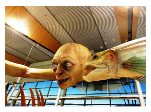
Figure 10 Middle Earth, Wellington.