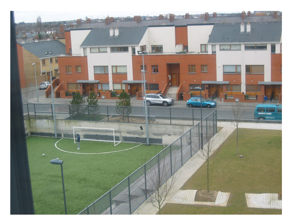
Figure 2. Fatima Mansions 2010