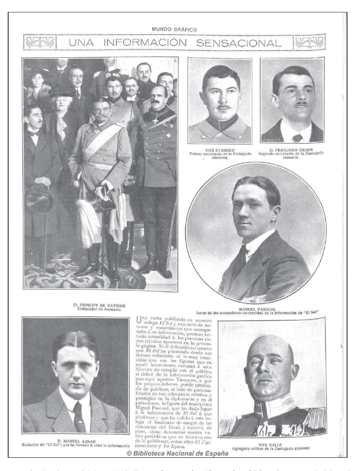
Mundo Gráfico, 13 Mar. 1918. Reporting on the 'Sensational News' as revealed in El Sol. The main protagonists in the affair are introduced.