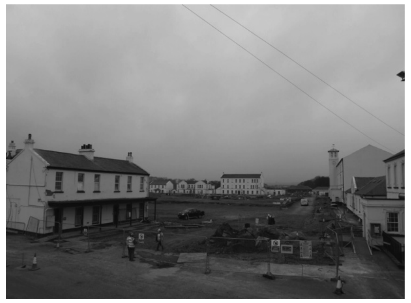
Figure 5: The former Ebrington Barracks parade ground undergoing transformation into a multi-purpose public space. Photo taken in 2011.