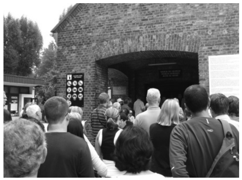
Figure 1: Tourists gathering at the entrance to the Auschwitz I concentration camp, a UNESCO World Heritage Site since 1979. Photo taken in 2009.