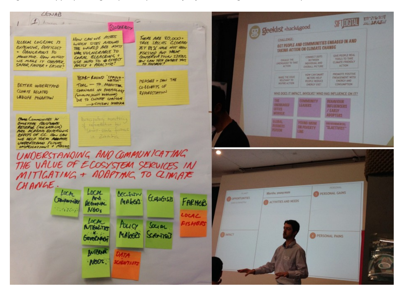
Figure 10: Appropriating corporate practices for formulating civic hackthon problem statements