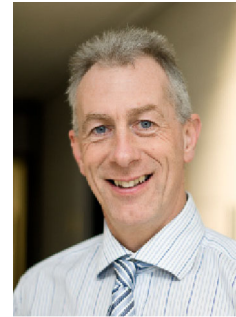
John V. Ringwood

With an increasing imperative to harness diverse forms of renewable energy, the focus on wave energy has increased considerably over the last two decades. In the struggle to make wave energy commercially viable, many fundamental problems need to be addressed, including to the reciprocating energy flow characteristic of most wave energy converters (WECs), the hostile environment, the need to optimise WEC geometries and arrays, and the desire to optimise WEC device output through the use of control systems. Fundamental to many of these issues is the need for appropriate mathematical models, to facilitate the design and evaluation of various WEC systems and subsystems.