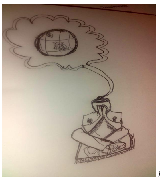
how to think

The aim of education should be to teach us rather how to think, than what to think—rather to improve our minds, so as to enable us to think for ourselves, than to load the memory with the thoughts of other men. (Beattie, 1779, p. 475)