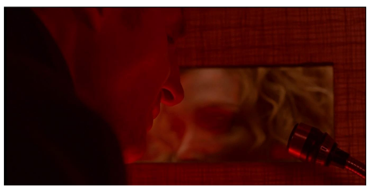
Figure 14. Liam Neeson and Cillian Murphy in Breakfast on Pluto (2005)

When he does eventually come to Kitten's aid in London with the new address of Kitten's biological mother, Father Liam is unable to verbalize personal events from the past that link the three of them together. The priest's narrative is related with a screen dividing him from Kitten's view, and even then it is spoken in the third person, so as to remove himself personally from the story (see fig. 14).