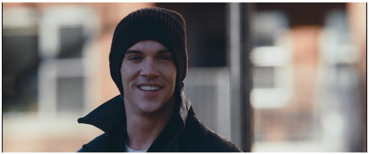
Figure 18. Jonathan Rhys Meyers in August Rush (2007)

of immature masculinity transformed through fatherhood" (93), whereby fatherhood brings about the necessary circumstances for maturity and redemption. In the case of August Rush , Louis' transition from amateur musician to businessman becomes the catalyst that brings about the unification of the nuclear family.