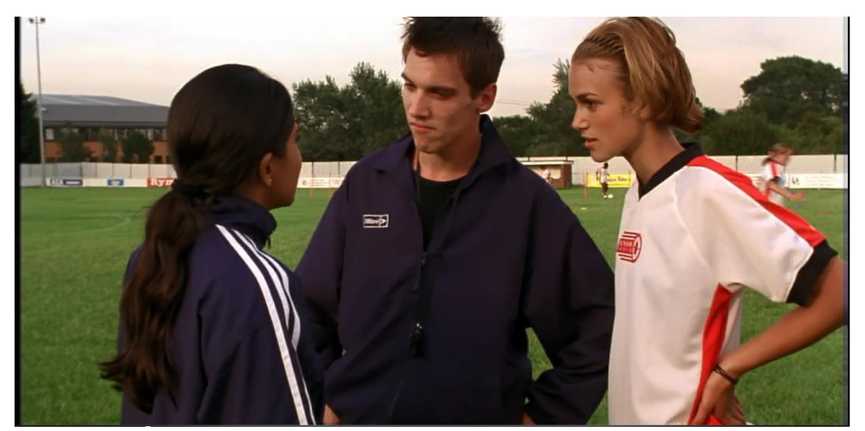
Figure 1. Keira Knightly, Jonathan Rhys Meyers and Parminder Nagra in Bend It like Beckham (2002)

Based on Straayer's and Lindner's hypotheses, then, Joe serves as a token character, or a plot device, included to heteronormalize the film. He is, to use Lindner and Straayer's term, "an intermediary male," and, in this respect, Joe's masculinity is predicated on his position as a love interest, but not offensive enough to overshadow the relationship between Jess and Jules (see fig. 1 and 2).