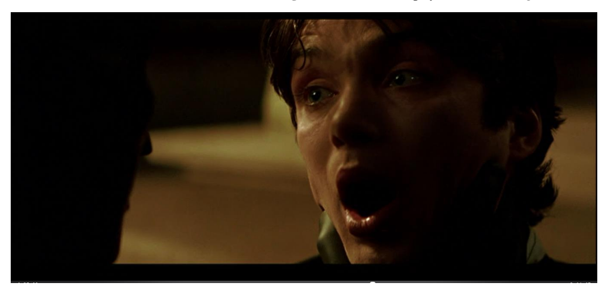
Figure 10. Cillian Murphy in Batman Begins (2005)