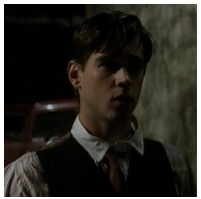
Figure 22. Colin Farrell in Falling for a Dancer (1998)