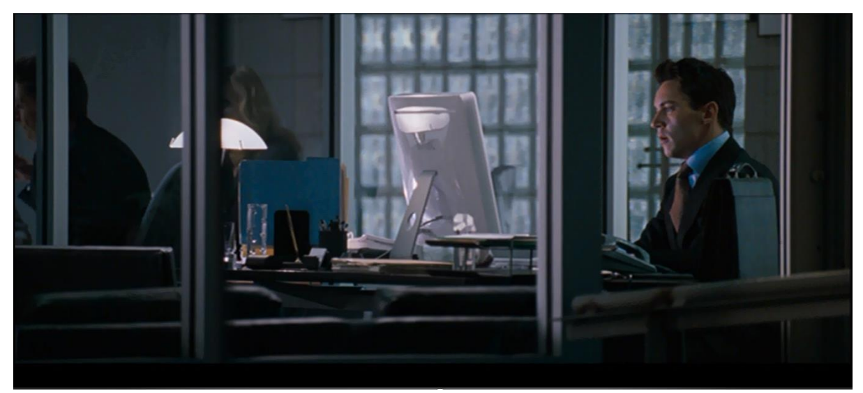
Figure 19. Jonathan Rhys Meyers in August Rush (2007)

To the extent then that Meyers is cast as the father and not the son, August Rush offers much scope for consideration within the present discussion. In positioning Louis as "the good father" figure rather than the bad, the film uses the character of an Irish immigrant in America during the Celtic Tiger period, and the actor playing him, as a medium to promote a