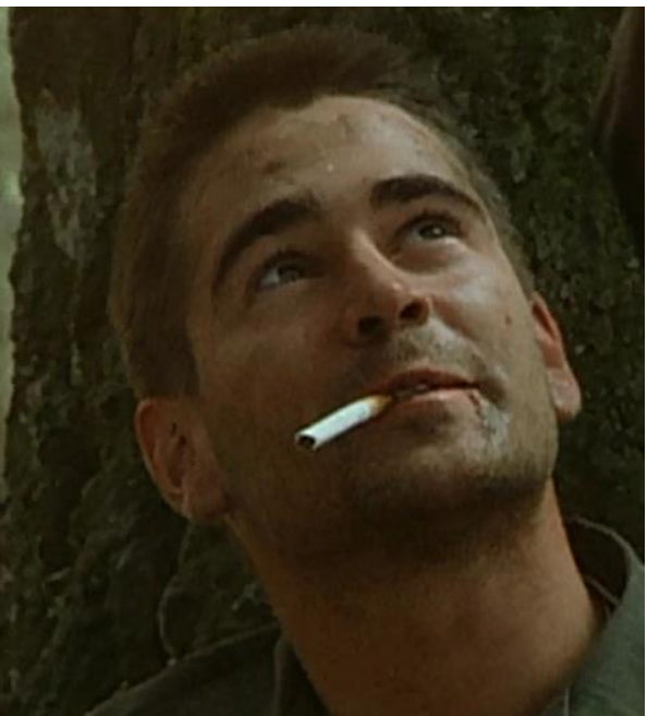
Figure 23. Colin Farrell in Tigerland (2000)

While Farrell's early star persona traded on his rugged good looks and the sort of uncouth behaviour that is more redolent of a disadvantaged background, and the sort of