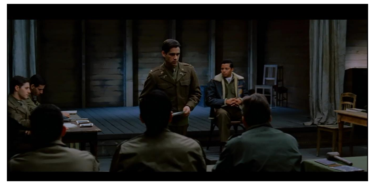
Figure 5. Collin Farrell and Terrence Howard in Hart's War (2002)

Whiteness in the film is based on its agency over blackness: McNamara's capacity to sacrifice Scott for the supposed good of the war effort, Hart's ability to prove Scott's innocence, and Hart's own entitlement to military respect. Hart's reclamation of his masculinity is predicated on his successful defence of Scott in the staged Court Martial (see fig. 5). Scott explicitly rejects Hart's offer to escape with McNamara, preferring instead to stay and give the other troops a chance at survival. But Hart denies him that choice. He confesses to murdering Bedford himself, knowing that only a direct confession will prevent the Germans from executing Scott at the conclusion of the trial. In so doing, and in forcing McNamara's own confession, Hart denies Scott the right to dictate the course of his fate. By the end of the film, and having assured the audience that Lincoln Scott got to return to his family in Macon, Hart has become a man after learning the true meaning of "honour, courage, duty," and "sacrifice."