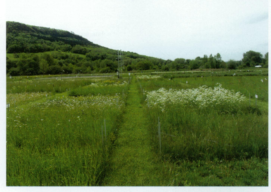
PLATE 1. Some dominance plots of the biodiversity experiment in Jena, Germany, in 2007. Here, nine dominant grassland species were established on 206 plots with a diversity gradient from 1 to 9 species.

of phylogenetic diversity in explaining the diversity effect (Hypothesis 2). Including terms for interactions between each pair of functional groups and for within each of the three functional groups (Kirwan et al. 2009) added to the explanatory power of the average interaction effect (model 5 vs. 2a, P < 0.001 and P =0.011; Table 2). Jointly, average pairwise interaction and functional group effects explained most of the diversity effect, especially in Biodepth Ireland (model 2 vs. 5, P =0.012 and P = 0.117; Table 2). Functional group effects were largely captured by community phylogenetic diversity in a single degree of freedom; including functional groups in addition to community phylogenetic diversity somewhat improved the fit only in Jena (model 5c vs. 4, P = 0.026 and P = 0.183; Table 2). The linear effect of community phylogenetic diversity did not add to the functional groups effect (model 5c vs. 5, P =0.786 and P = 0.318; Table 2). These tests confirm the strong relationship between functional groups and community phylogenetic diversity (Hypothesis 3), with the latter capturing most of the functional group effect in a single degree of freedom. Results from the Jena data are explained and presented in further detail in the Supplement.