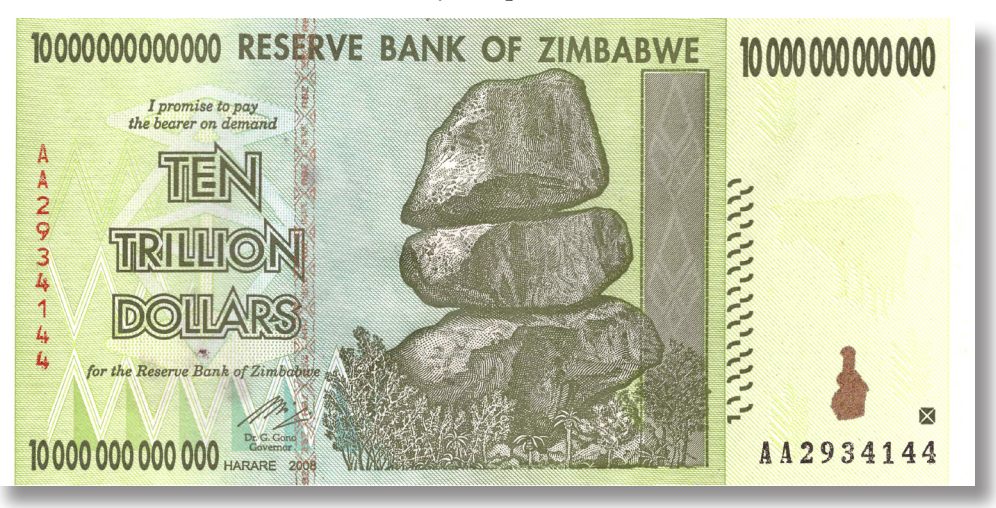
FIGURE 4: A banknote for 10 trillion dollars from the Reserve Bank of Zimbabwe, issued in 2008. (From the author's collection.)

trust turned substance, so to speak, but with the interesting corollary that the more trust there exists, the less substance is necessary to represent it.