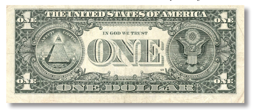
FIGURE 3: The phrase "In God We Trust" on the reverse of an American one-dollar banknote.

Since 1957, all American currency carries the motto, "In God We Trust." The use of this motto can be traced back to 1864, when it first appeared on a two-cent coin. The intention was always to acknowledge the existence of God on the country's very currency, so that no economic transaction could occur without at least implicit recognition of the De-