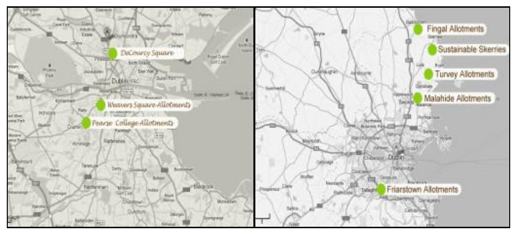
Fig. 2: Allotment sites in Dublin City Centre (left) and the greater Dublin Region (right)

In this paper, we offer an analysis of the growth in, and motivations behind, UA in Dublin and its relationship to the availability of vacant space. We gathered data through multi-sited, ethnographic methods (semi-structured interviews, participant observation and visual analysis). Fieldwork was conducted mainly between 2011 and 2013 in Dublin (across eight diverse locales in the city and on the perimeter), see Figure 2. Site selection reflected the rise in demand for UA, and the socio-economic profile of practitioners residing in each locale. In total, we conducted forty-eight interviews with plot-holders, fifteen interviews with advocates and five with providers (both public and private). Respondents who participated in the study differed in terms of a range of variables including: gender, ethnicity, social class, professional and occupational status, and length of time investing in UA. This paper draws on a sub-set of interviewees, namely, those plot holders and advocates who directly or indirectly referenced austerity and the economic crash in the course of their interviews.