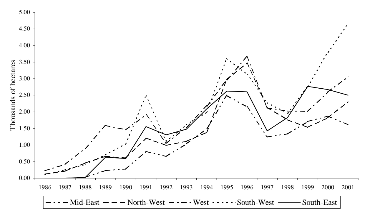
Figure 1. The number of hectares of Irish forestry planted by farmers