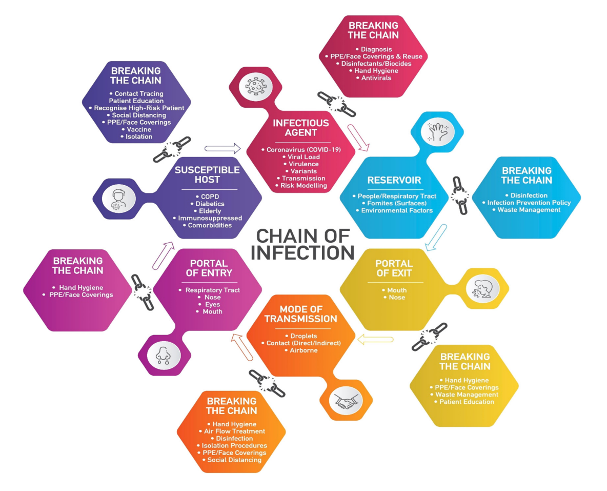
Fig. 2. Breaking the chain of COVID-19 infection: contributions of different NPIs.