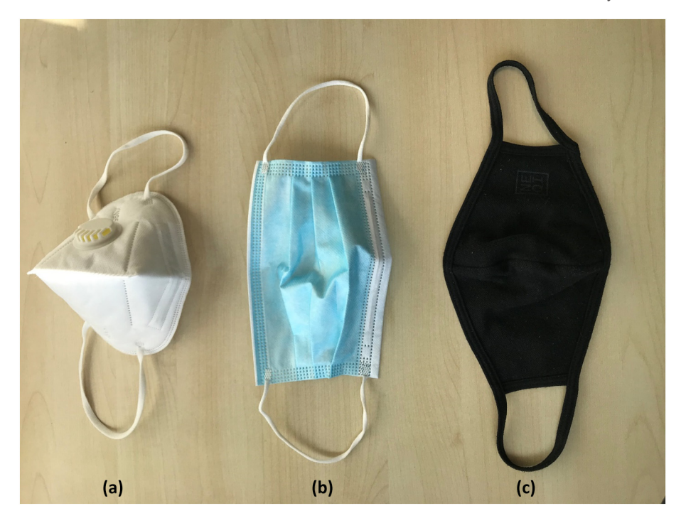
Fig. 1. Examples of disposal face masks and reusable cloth face covering: (a) KN95-type filtering face piece mask, (b) medical or procedural mask, and (c) non-medical reusable cloth face covering.