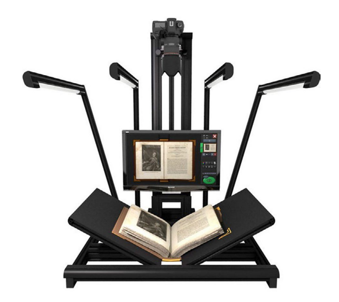
FIGURE 3 Metis EDS Gamma professional digital scanner used to image historical meteorological registers held in Met Éireann

Daily rainfall observed at 114 sites throughout Ireland was transcribed as part of this work (Figure 4). Stations were selected based on record length, continuity and spatial distribution. Additional stations that could potentially be used to infill gaps in long-term data series were also included. The transcription from paper and digital image format to digital numerical format was largely undertaken by final year Geography students at Maynooth University as part of a novel crowdsourcing initiative to integrate data rescue activities into the classroom. Ryan et al. (2018) presented an innovative approach to data rescue by developing a