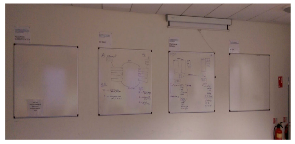
Figure 1. Four whiteboards in a local coordination centre.

a belief in not getting lost in the data, drawing out the high-level information and keeping it tangible, and maintaining strategic decision-making and action. The key function of the coordination centre/control room is collective discussion and negotiating a common message and response. The emphasis is on following established protocols not reacting on an ad-hoc basis to data flows. In other words, even if AGS were willing to collaborate on a shared data infrastructure, there is no present programme to which to contribute.