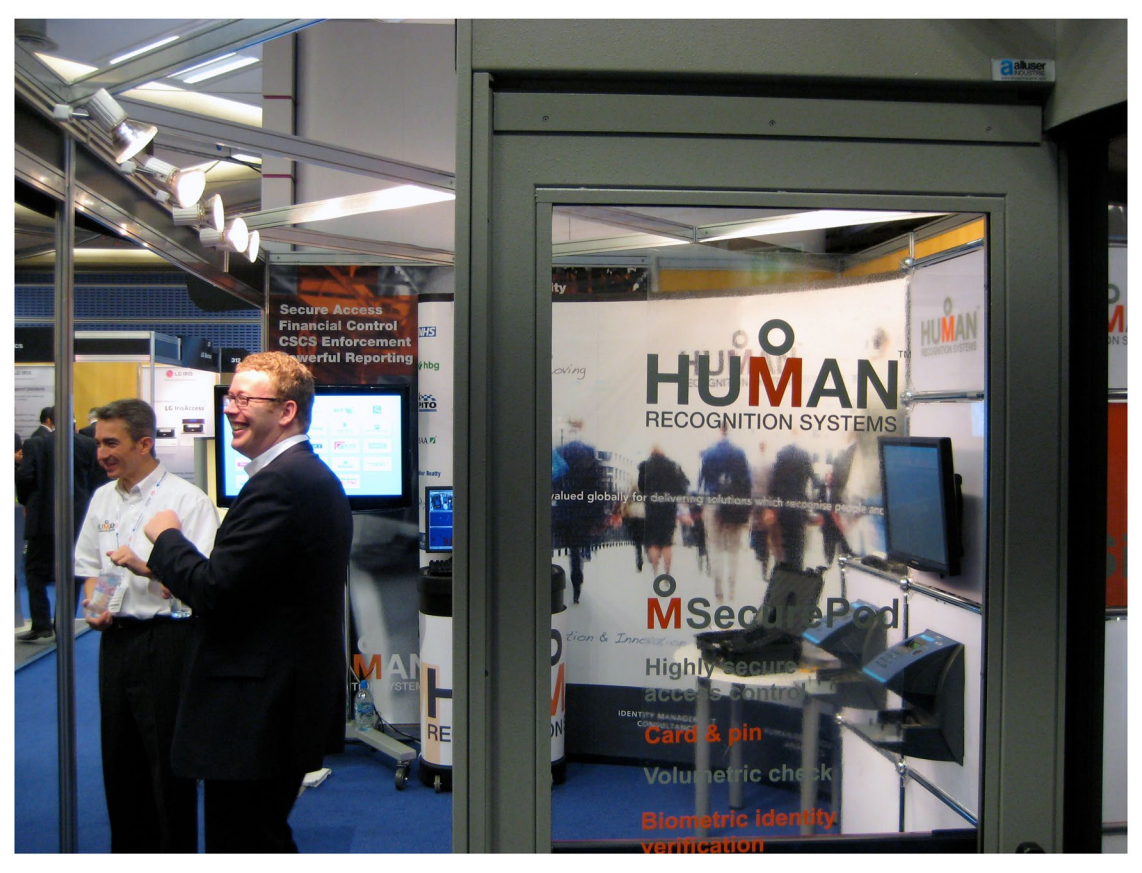
Figure 5. "Security Design Conference, Westminster, London," photograph by Mark Maguire.

line, he flicked from slide to slide, each with an airport image or CCTV still. The audience watched as the terrorists exited a taxi; another camera picked them up entering the terminal. The time stamp showed 7:58, and the presentation slide changed to show the terminal façade. The building erupted with shattering glass, fragments of concrete and great clouds of smoke. We watched the footage with William, who stood with his back to the audience, concentrating as if seeing the images for the first time. Something needed to be done. But what was most interesting about this meeting, and similar ones in other European jurisdictions, was that front-