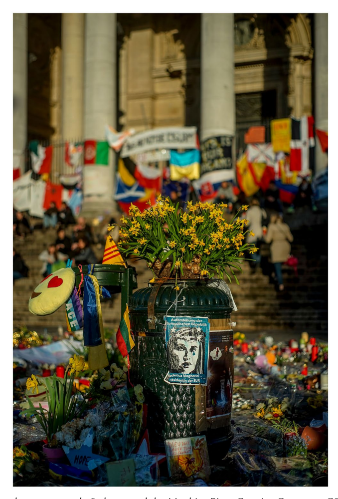
Figure 2. "Brussels after the terror attacks,"