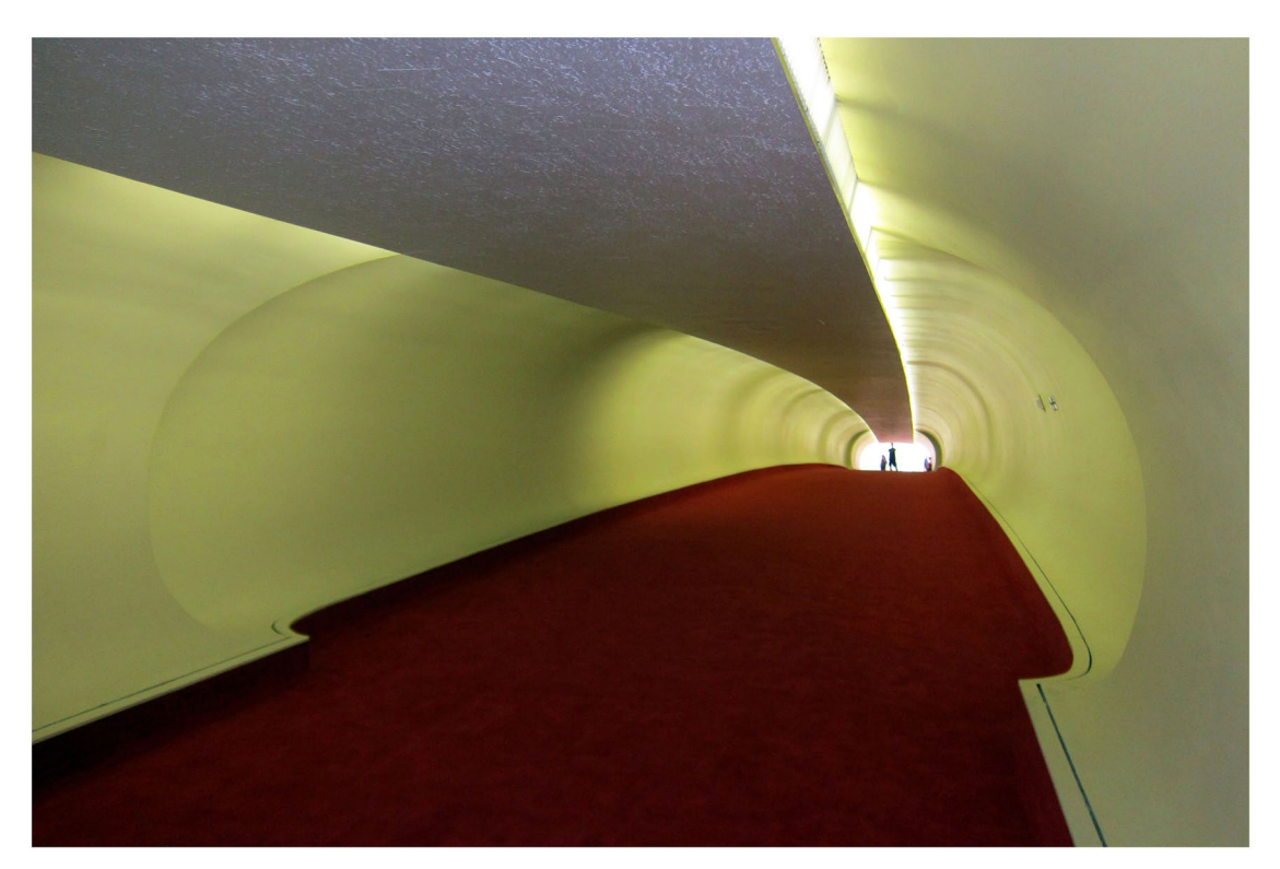
Figure 4. "NYC - JFK Airport: TWA Flight Centre,"

the State, and other entities" such that "responsibilities for landside" are defined. Here one can see the true scale of the problem surfacing, especially for European counterterrorism. Landing at a given airport and exiting passport control and customs, consider that the building may be owned by a quasigovernmental or commercial enterprise and patrolled by a mix of state police and private security, perhaps with a military presence. Does "landside" begin in the terminal or outside at the transit center or taxi stand, and where does it end, exactly? When one steps off the metro in the nearest city center? And what of major airports such as Amsterdam Schiphol, with its 71 million passengers per annum and 28 square kilometer campus,