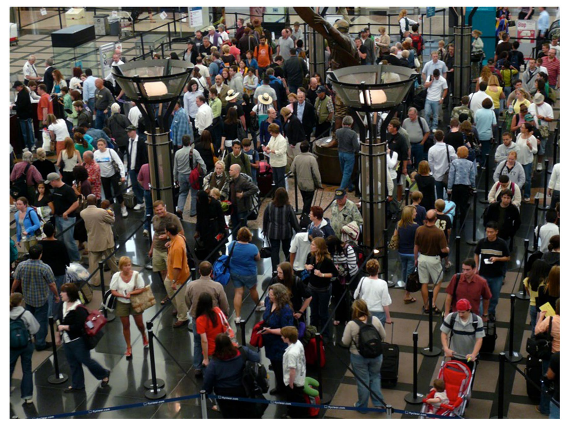
Figure 3. "Denver Airport Security Lines," [The photographer explains the image thus: "Weirdest thing. They funnel everyone through these long, long lines. You can watch it all from above."]

campus of 1,254 hectares, on which 25,000 people are employed at any one time.