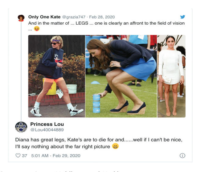
Figure 2. Meme Comparing Diana, Middleton and Markle.

existent variation among the legs of three thin, fit, wealthy young women generates the absurd categories of "great," "to die for" and "affront to the field of vision."