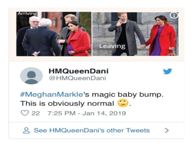
Figure 4. Surveillance of the Sussex Baby Bump.

The rivalry with Middleton rendered Markle the unruly, lesser duchess and illegitimate mother. Recirculating tropes of Black motherhood as pathological, press and social media coverage valorised Middleton in comparison to the "deceptive" Markle, establishing a familial tension that creates an idealized mother of the nation's next ruling generation (Middleton), while castigating the mixed-race mother who disrupts the hierarchies and protocols of the royal family (Markle). The Royal Family may be read comically within the famous feuding family frame, but it is also an emblem of English aristocratic white privilege. Markle and Windsor's marriage and Archie's birth disrupts those privileges, with the soap opera storyline of feuding sisters-in-law displacing these social and political challenges entirely onto the domestic sphere.