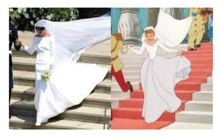
Figure 1. Royal Wedding meme: Markle as Cinderella.