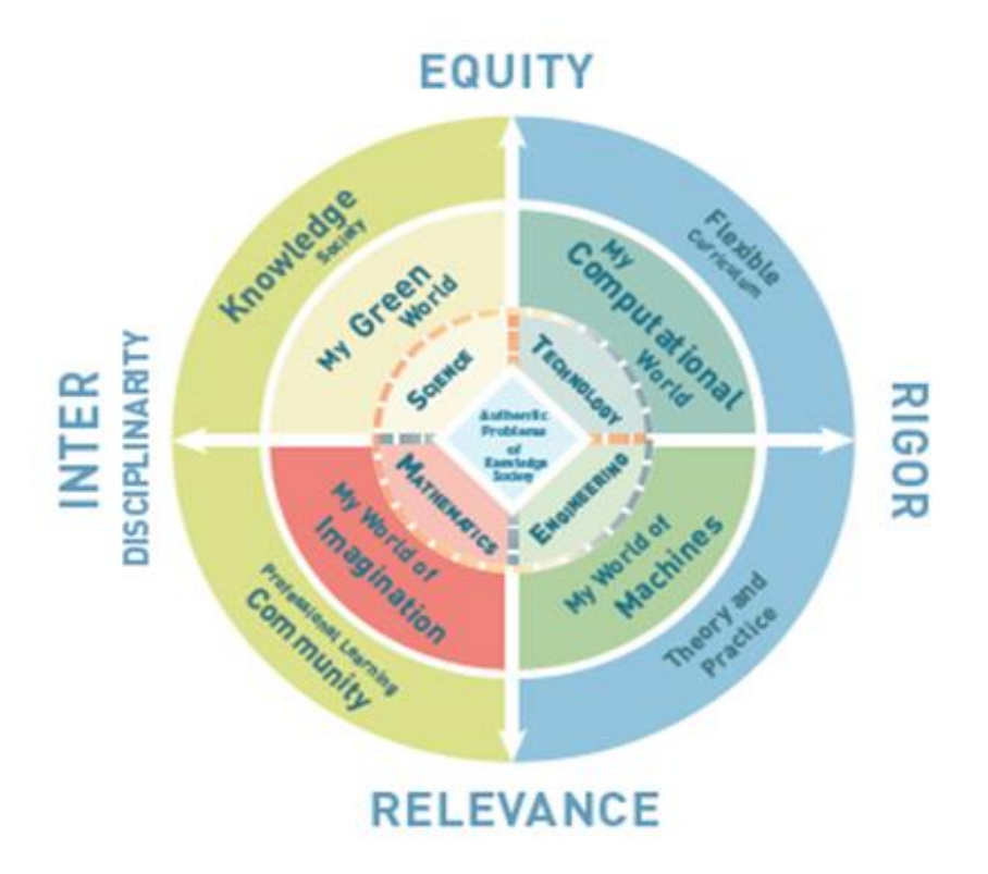
Figure 1. Integrated Teaching Framework for earlySTEM program