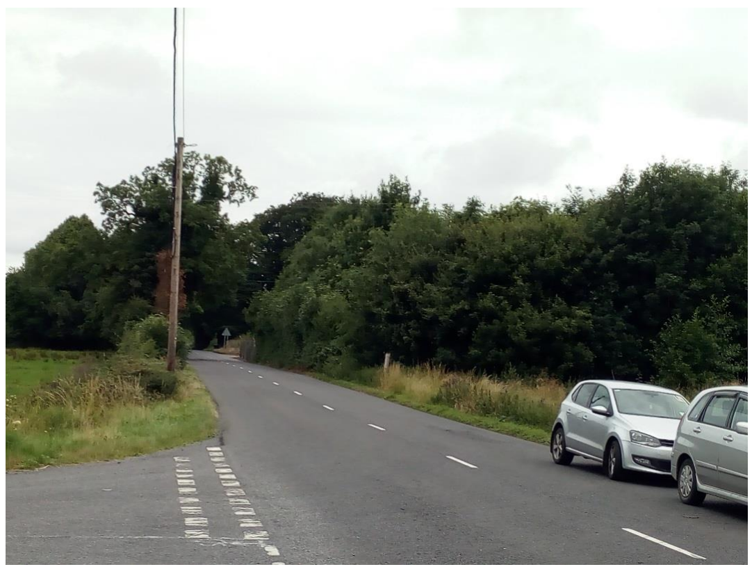
Figure 17: The Dash, near Newtonbutler, co. Fermanagh.