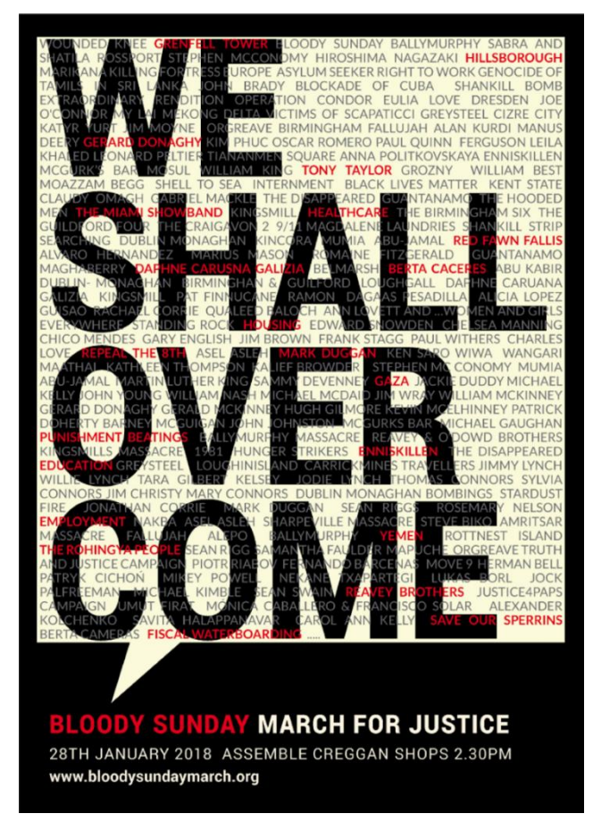
Figure 9: 2018 Official Bloody Sunday March for Justice Leaflet. Available at: http://bloodysundaymarch.org/for_justice/.

The names forming the spectral convocation, for example, are given no particular pride of place amongst the cascade of other names. But more controversially, the image gives ample space to victims and survivors of Republican atrocities perpetrated during the Troubles, signalling a clear rejection of Sinn Féin's right to ambiguate the spectral convocation. Interspersed amongst the names of the victims of Bloody Sunday, one can find "Enniskillen," "Paul Quinn," "the victims of Scapaticci," "the Disappeared," "the Kingsmill Massacre," and the "Shankill Bombing," all direct references to IRA-perpetrated acts of deadly violence. While this was not the first time survivors or bereaved of Republican violence had spoken at events during the Bloody Sunday Week or taken part in the march, the 2018 programme marked the first attempt to systematically ambiguate the spectral convocation to also speak for these groups and communities. Many older members of physical force Republican groups, such as Tony Taylor, were also members of the IRA or the INLA, and as such, may have