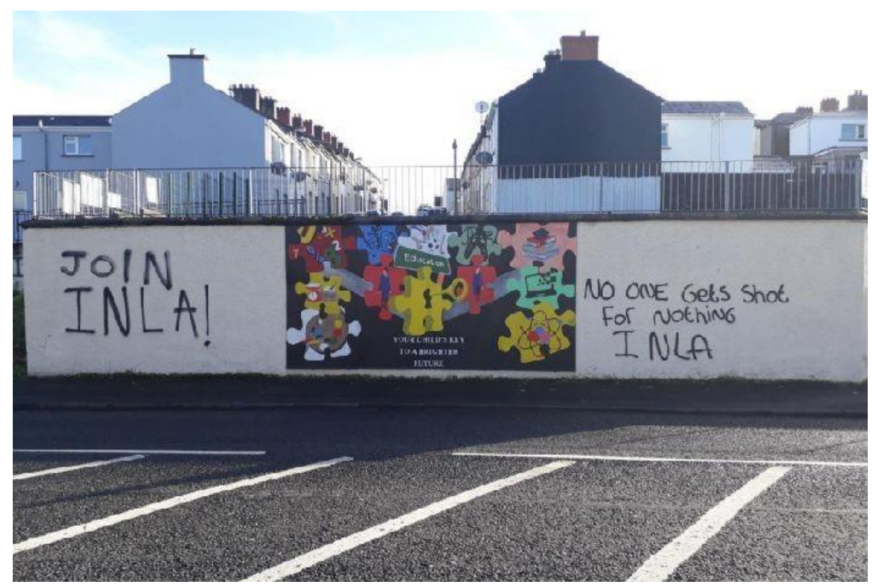
Figure 11: INLA Graffiti, Rosemount, Derry.