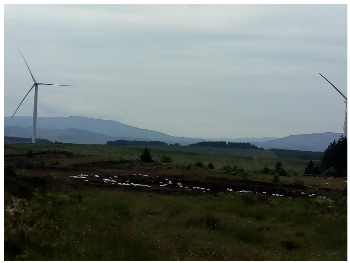
Figure 22: Turf Bog, Fermanagh (specific location withheld).

It finally begins to dawn on me why William has taken me up here. Up here, miles from any house, William was completely isolated. This is a perfect place for an assassination. "So if anyone knew you were coming up here..." I prompt.