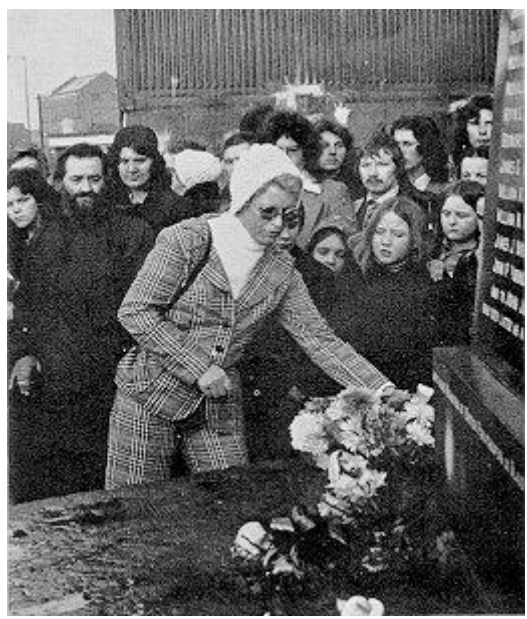
Figure 4: Relative of a Bloody Sunday victim laying a wreath at the Bloody Sunday.