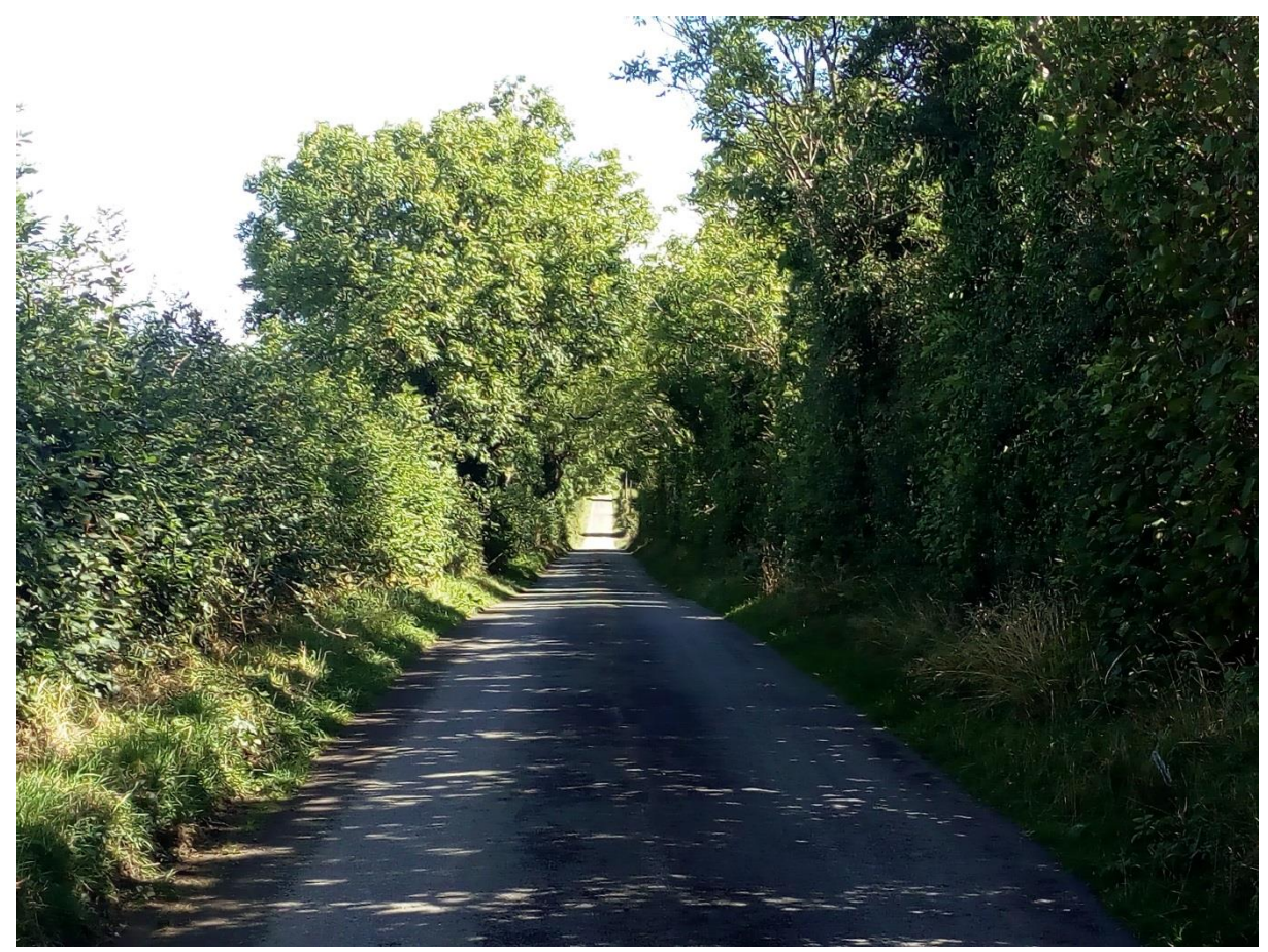
Figure 21: Border Road C. Fermanagh/Cavan.

The foregrounded brutality only snaps into visceral reality when one is surrounded by the isolation of these farmhouses, when one encounters the encoded sectarian microgeographies of the border. When one stands in these places, one feels , rather than merely hears, lives lived in perpetual anxiety and terror, often for decades. In towns like Derrylin, as the memory of the céilidh illustrates, their neighbours, their colleagues, their tradespeople, even children, all might be agents of dehumanisation, even death. These landscapes become archipelagic, a network of islands of security and insecurity, this bend in the road, this section of the village, all known and categorised along a spectrum of fear. And the way Jenny sits in the backseat of the car, pulling her sunglasses down now so we will not see her tears, refracts her ongoing alienation from the rural borderlands that were and are her home. These places and these landscapes are not past, they remain radically present not only in Jenny's memory, but in the hyper-awareness of her body, her everyday mobility, and the ways in which she feels secure