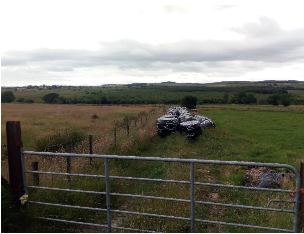
Figure 14: Border Road A (specific location withheld).