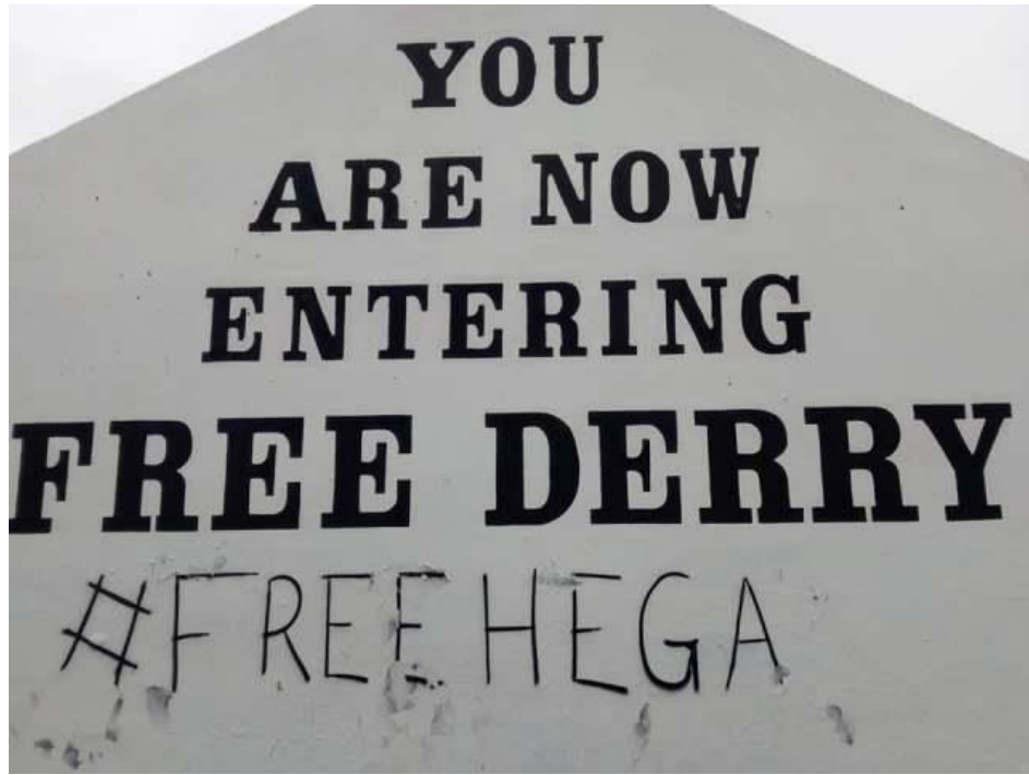
Figure 12: Free Derry Wall, accreted with #freeHega slogan, The Bogside, Derry, 2018.