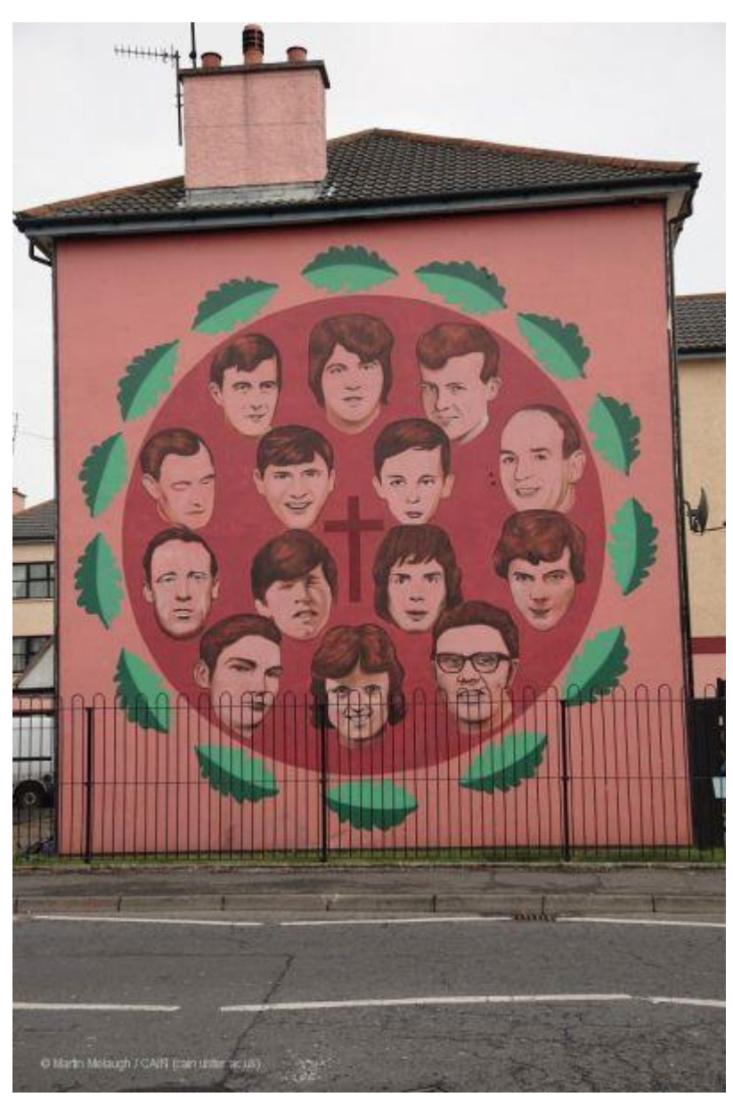
Figure 3: Faces of the Bloody Sunday Dead, Lecky Road, Derry. ©CAIN and ©Martin Melaugh. Used with Permission.

As the primary part of the disciplining landscape of the Bogside and Creggan, they demand what Paul Ricoeur (2004) refers to as a "duty of memory" [ devoir de mémoire ] amongst all who inhabit the space or interact with the landscape. Crucially, for Ricoeur, a duty of memory is not to provide a forensic or authoritative recollection of past traumatic events, rather it is to compel history to stand for the idea of justice in the abstract, specifically justice for those whose lives have been violently interrupted. But, in keeping with Schein's analysis,