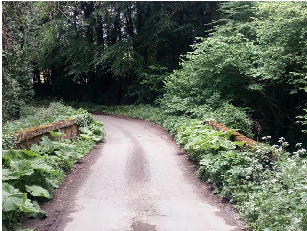
Figure 20: Border Road B. Fermanagh/Monaghan.