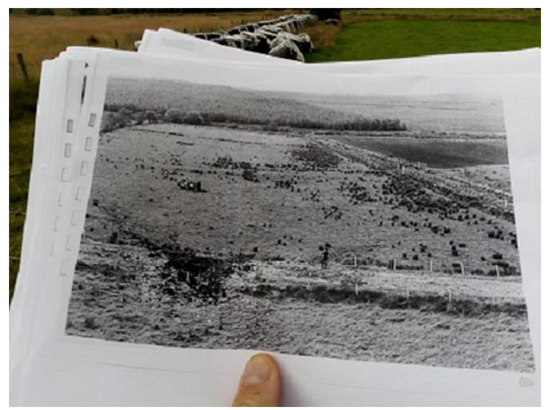
Figure 15: Border Road A, past and present (specific location withheld).