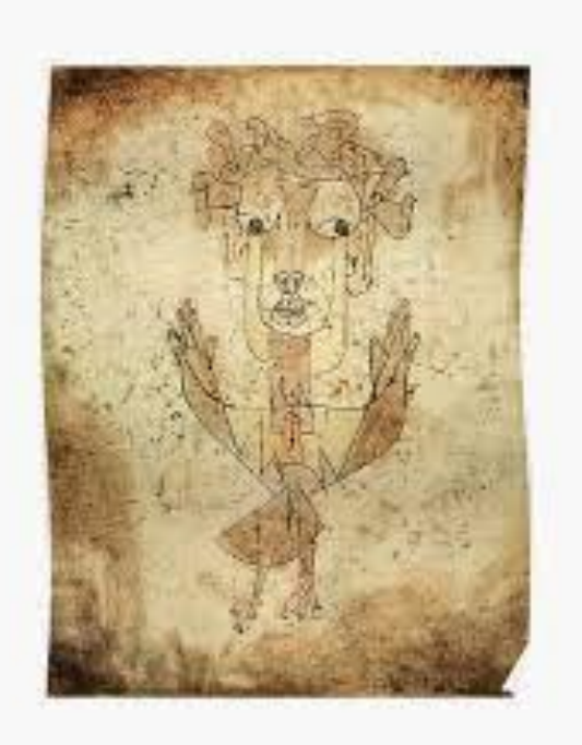
Figure 26: Paul Klee (1920). Angelus Novus

That metaphorical pile of debris he elsewhere (2005, 576) refers to as "layers of sediment," blown by the winds, burying, rendering invisible, those who have been left prostrate.