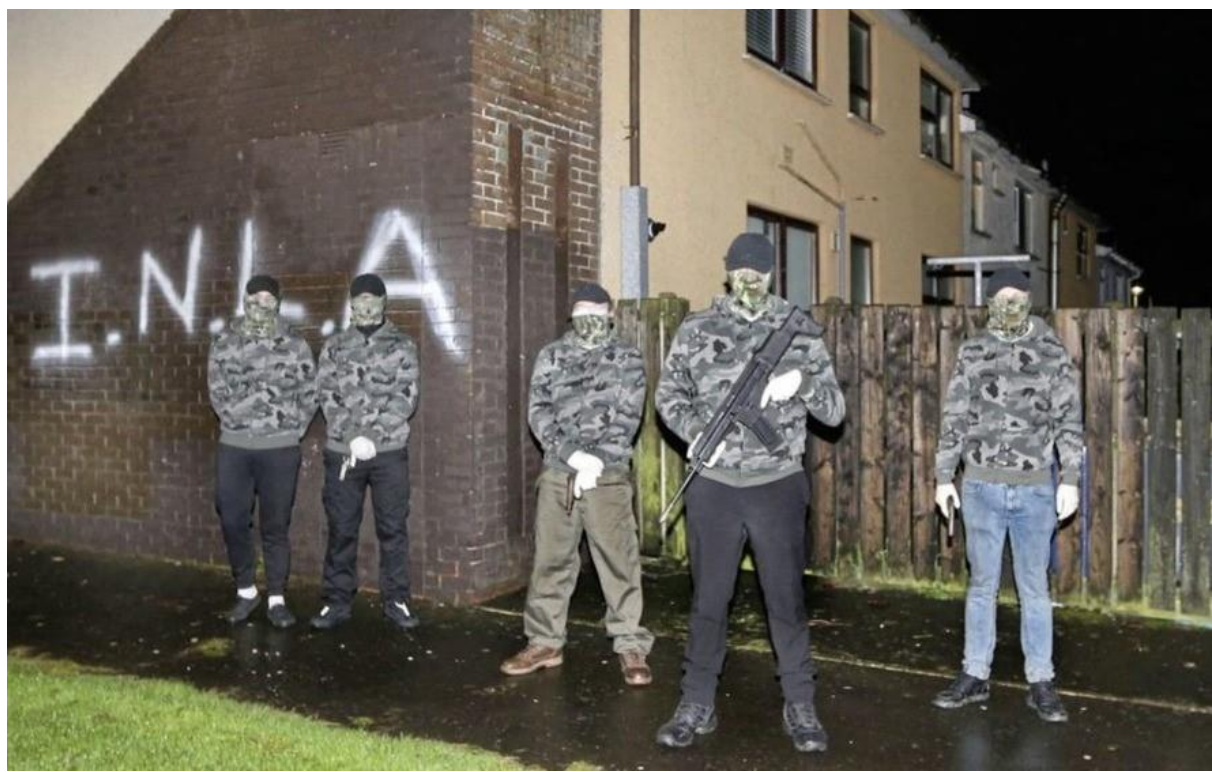
Figure 10: INLA Graffiti and show of force. Galliagh, Derry. Photo shared widely on social media.