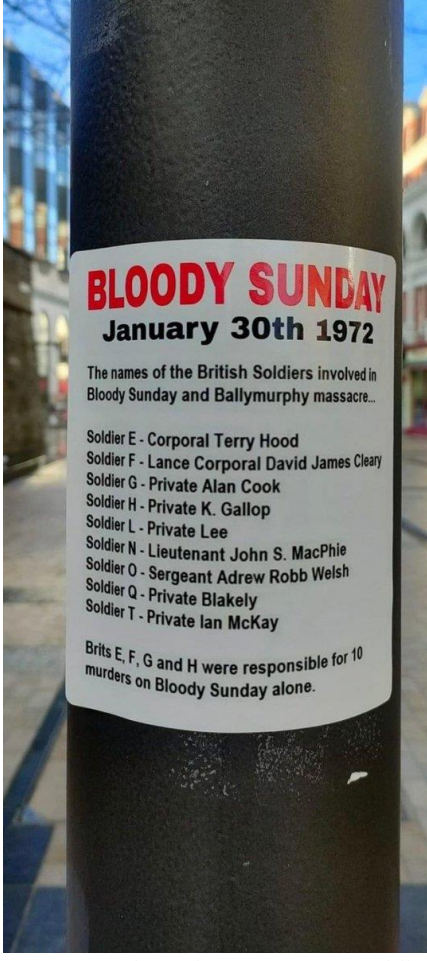
Figure 25: Placard appearing in Guildhall Square, Derry, July 2021 (exact date unknown).

At the meso-level, refusal manifests as a rejection of colonial or administrative recognition or regulation of the geographical, temporal, and racist boundaries of membership in a given Indigenous tribe or Band. For Simpson, however, these larger and more visible politics of