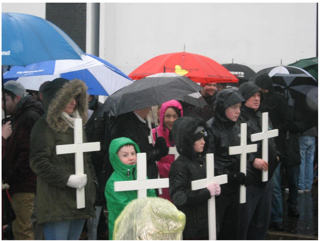
Figure 5: Bloody Sunday March, Creggan Shops, Derry (2017).

They have demanded civil rights, demanded one person, one vote, a right to fair housing and end to internment and employment discrimination. They have also stood for the violent