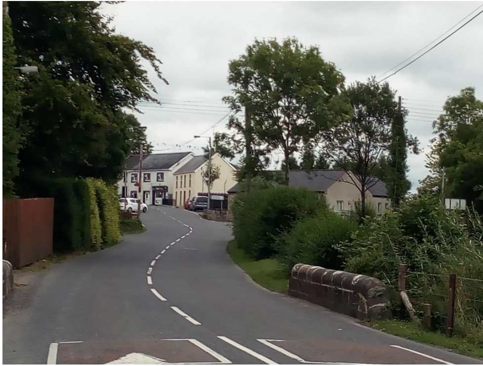
Figure 19: Peering into Rosslea.

James responds: "Everybody in this area, they couldn't just drop everything and flee. They were farmers, business owners, they were tied to the land. You see that's why I still hold a great deal of resentment towards the Irish republic. When they got across that border, they were home free. Not a Gard to be seen. But foot-and-mouth disease came along and they sealed every bloody road."