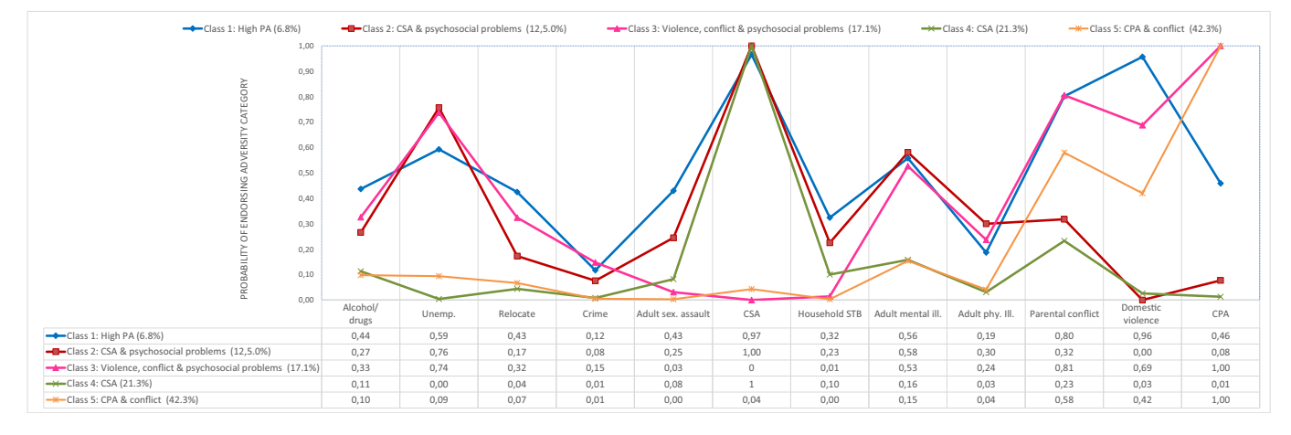
Fig. 1. Female class plots.