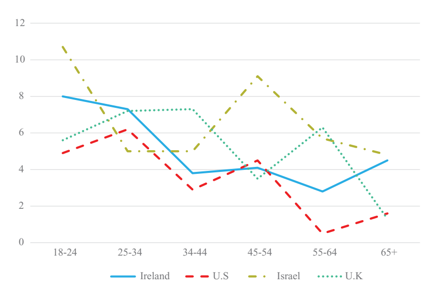
Figure 1. Estimated prevalence rates of ICD-11 PTSD across age groups in each sample.