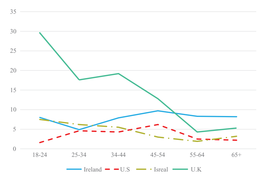
Figure 2. Estimated prevalence rates of ICD-11 CPTSD across age groups in each sample.

were relatively higher in those aged 65+ in the Irish and Israeli samples.