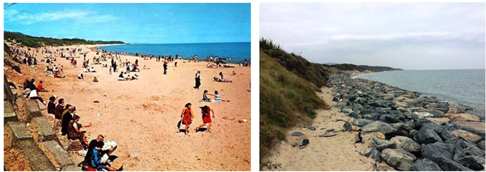
Fig. 1 Left: North beach at Courtown 1967. Right: North beach at Courtown 2015, including rock armour.

Courtown harbour and Riverchapel talking and listening to locals which included some participants from the pilot questionnaire, in unstructured and casual conversations. We conducted this work to help us understand their use of language when describing changes to the beach. The word ‘loss’ was repeatedly used by local residents to describe these changes, which informed the language used during question design for piloting. Discussions with residents also informed us that residents from Riverchapel should be included, as many would have moved from Courtown to the neighbouring area of Riverchapel. Piloting allowed us to refine how questions were asked, survey presentation and length, sampling strategy and delivery method.