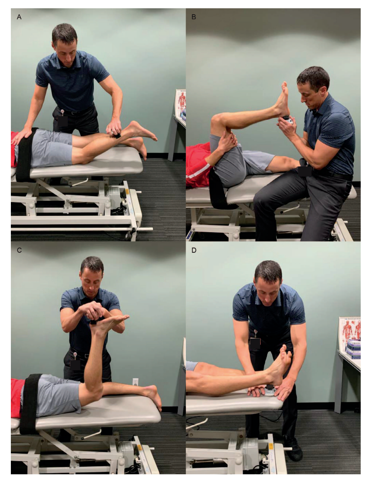
Figure 2. Isometric strength testing of the knee flexors in A, prone position at 0^{\circ} of hip and 15^{\circ} of knee flexion and B, supine position at 90^{\circ} of hip and 90^{\circ} of knee flexion and of the hip extensors in C, prone position at 0^{\circ} of hip and 90^{\circ} of knee flexion and D, supine position at 0^{\circ} of hip and 0^{\circ} of knee flexion.