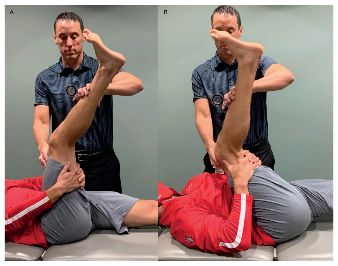
Figure 1. Active knee-extension tests performed with the athlete lying supine and holding the thigh at either A, 90° or B, maximal hip flexion. Range of motion can be assessed by placing an inclinometer on the anterior tibial border and instructing the athlete to extend the knee until the maximal tolerable stretch is achieved.

Given the biarticular nature of the hamstring, kneeflexion and hip-extension strength should be tested with the athlete lying both prone and supine (Figure 2), ideally with the hamstring in a lengthened position, <sup>19,21</sup> which appears most useful for RTS prognosis. <sup>12,13</sup> Internal and external rotation of the tibia can be added to knee-flexion strength tests to differentiate between medial and lateral hamstring muscle injury, respectively. <sup>25</sup> Hip-extension strength can be assessed with the knee flexed to identify muscles other than the hamstring, such as the gluteus maximus, that require strengthening during rehabilitation. <sup>26</sup> Practitioners may also consider testing the strength of movements not involving the hamstring based on the athlete's injury history (eg, hip adduction in those with hip and groin pain<sup>27</sup>), which may inform exercise selection during rehabilitation. SOR: A