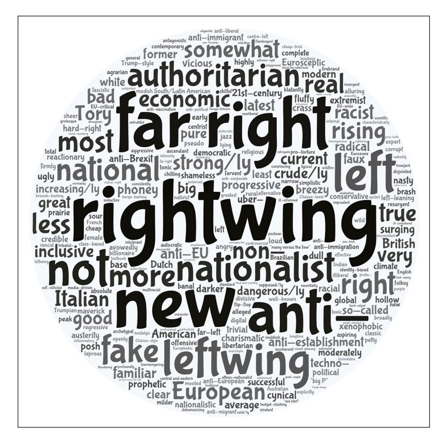
Figure 1. Word cloud of all adjectives/adverbs moderating populis* in the corpus, sized according to their frequency.

While Marine Le Pen had once threatened to sue anyone calling her party extreme right, she openly embraced the populist signifier, stating that 'If it means a government of the people, by the people and for the people, well then, I am a populist' (Le Pen, 2013). Similarly, Matteo Salvini, the leader of the Italian Lega, proudly wore a t-shirt stating 'I am a populist' at a rally in 2018. The populist label also facilitated claims by former stockbroker Nigel Farage that he was leading 'the people's army' during the Brexit referendum campaign, a topic covered in The Guardian series: 'We're reactivating the people's army': inside the battle for a hard Brexit (Hattenstone, 2019), allowing him thus to set the agenda. In the same article, a UKIP member is asked: