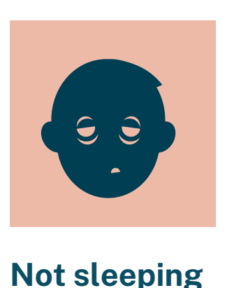
Not sleeping well.