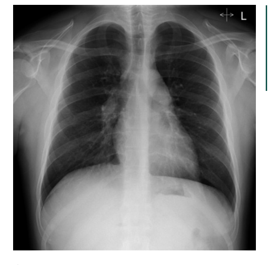
Figure 1 Chest radiograph of a 25-year-old man with dyspnoea and hypoxia, demonstrates normal pulmonary parenchyma and clear lung fields, with prominent hilar vasculature.

An electrocardiogram (ECG) revealed diffuse T wave inversion, suggestive of right ventricular strain and therefore a computed tomography pulmonary angiogram (CTPA) was ordered to assess for a pulmonary embolism and an echocardiogram to exclude intrinsic cardiac disease. The CTPA demonstrated good opacification of the pulmonary arterial tree, with no evidence of a pulmonary embolism, but some abnormalities were noted (figure 2a and b).