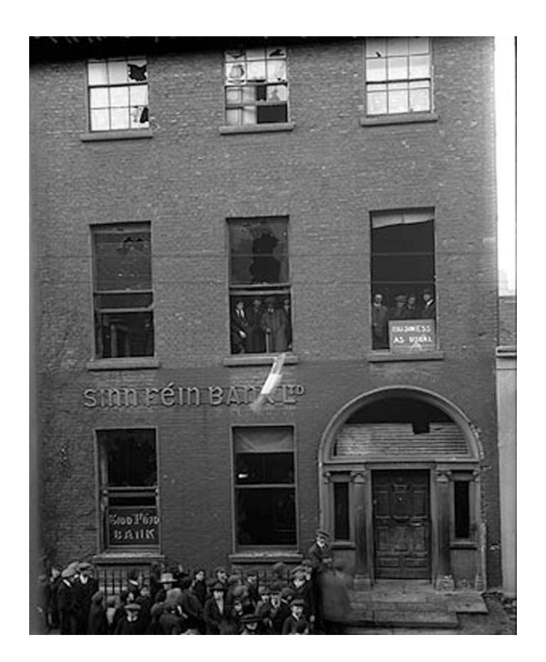
Fig VI: The Sinn Féin Bank, 6 Harcourt Street, after a raid

being passed from hand to hand all over Ireland'. 55 By suppressing the freedom of the press, the government had given the loan the best advertisement possible. Also, men and women who may have been apathetic towards Sinn Féin would have been irritated by being unable to purchase their regular provincial newspaper. Cooper had first-hand experience of the situation in Ireland and he was of the belief that the outright suppression of the Dáil, and all of its programmes and institutions, was the wrong course of action to take. A policy of suppression would only be beneficial for the loan campaign, and the pursuance of such a policy was probably welcomed by Michael Collins and his colleagues. Doubtless however, the British administration felt that the suppression was entirely justified given the escalating violence in Ireland and the links between Dáil Éireann and militant republicanism.