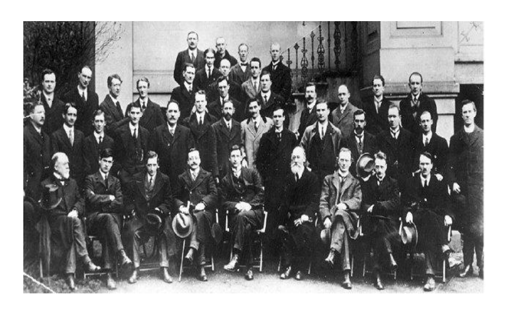
Fig II: Members of the first Dáil Éireann